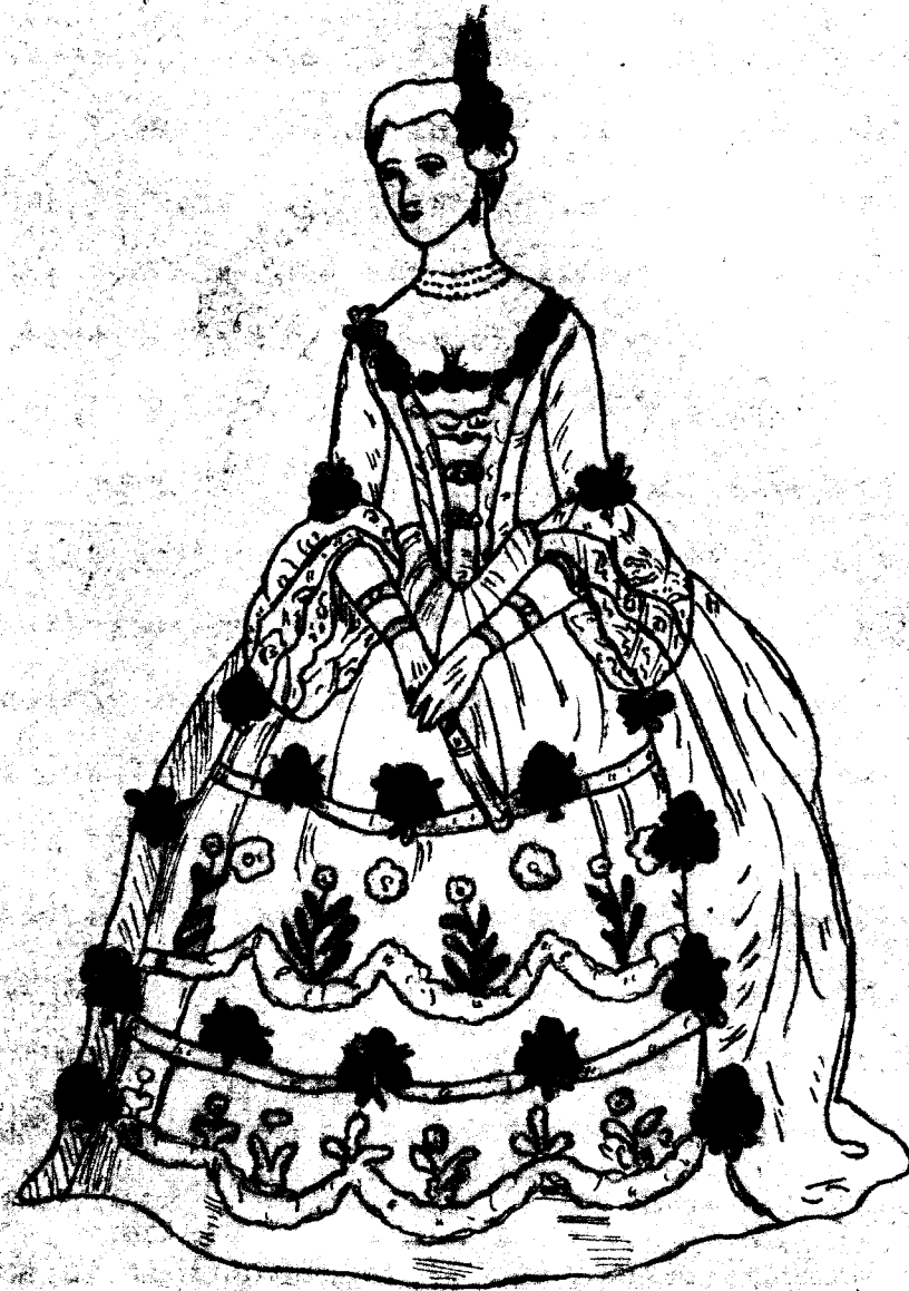
Lady of Rank 1730 - Louis XV (From Lacy)