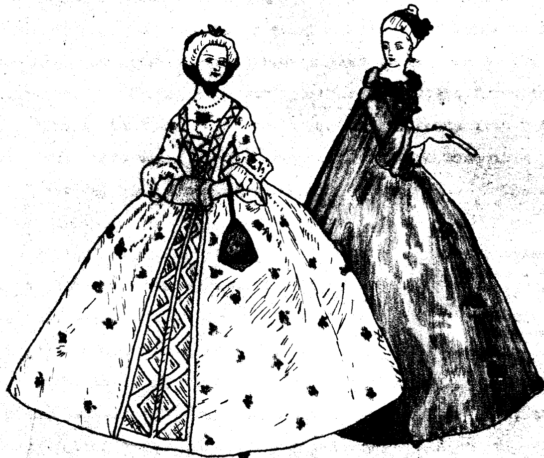
1760 - Louis XV (From Challamel)