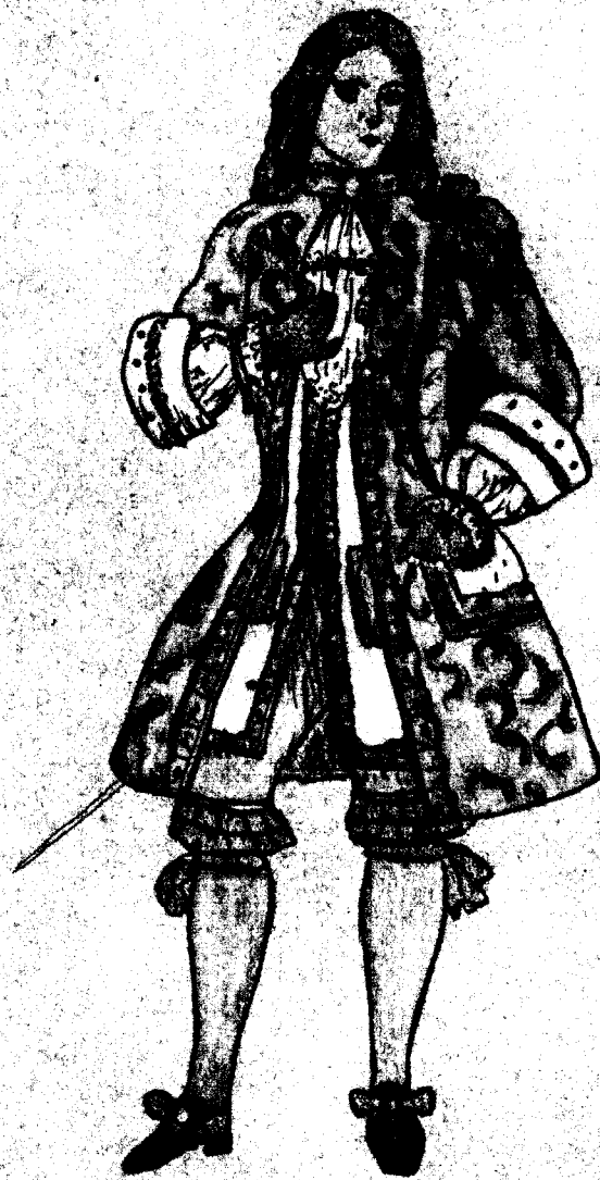
1704 - Louis XIV (From Lacy)