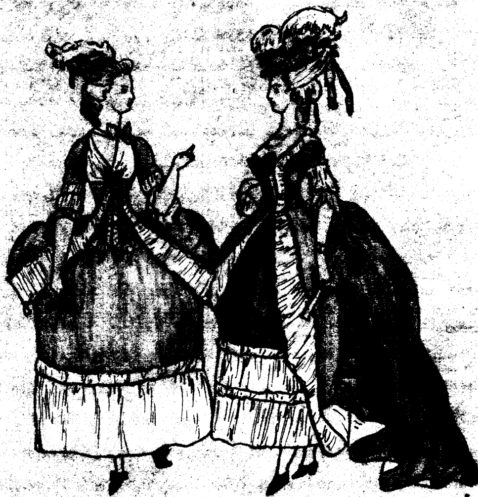
1780 - Louis XVI