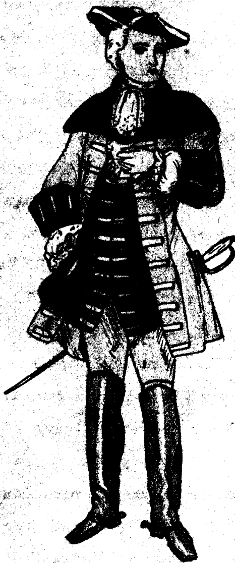
1740 - Louis XV (From Lacy)