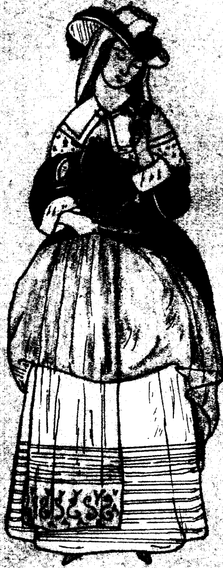
1680 - Louis XIV (From Lacy)