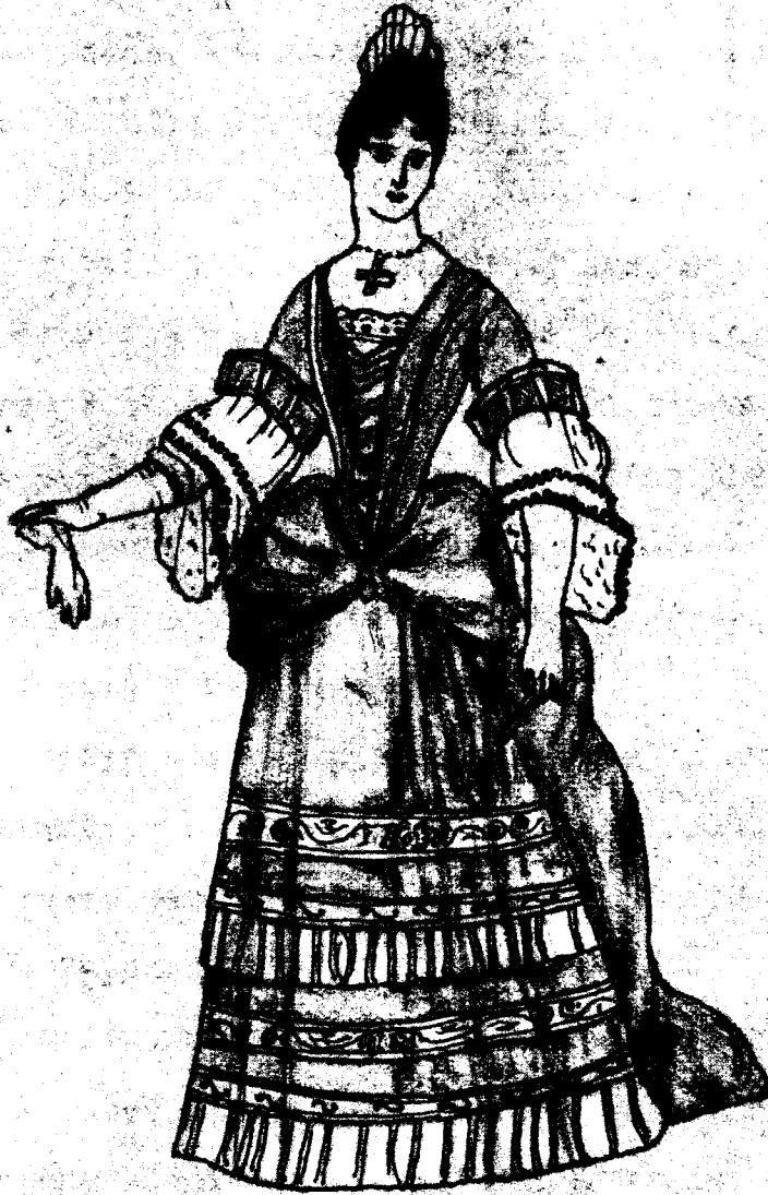
1708 - Louis XIV (From Lacy)