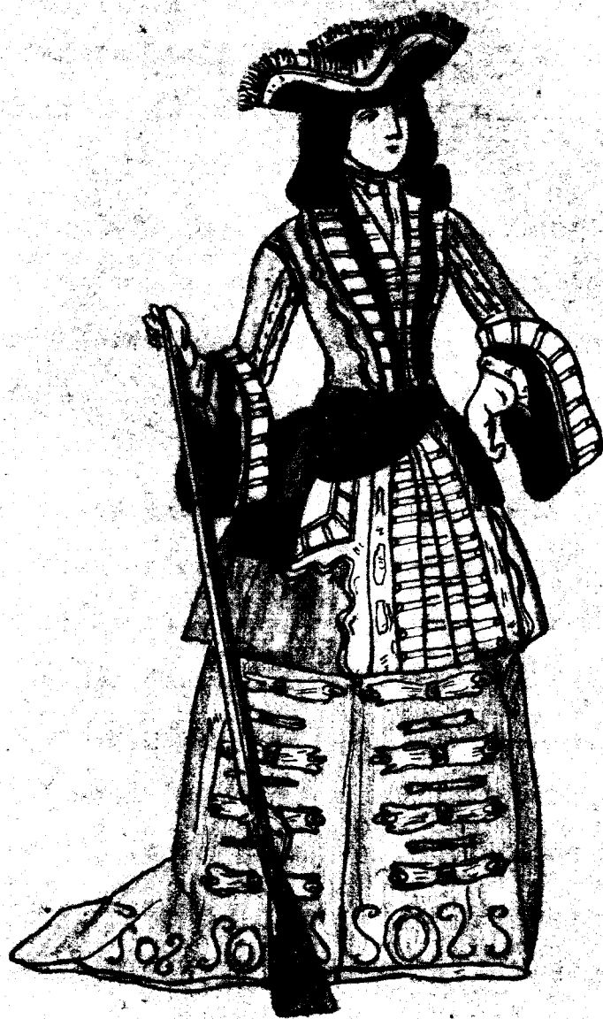
Hunting dress 1695 - Louis XIV (From Lacy)