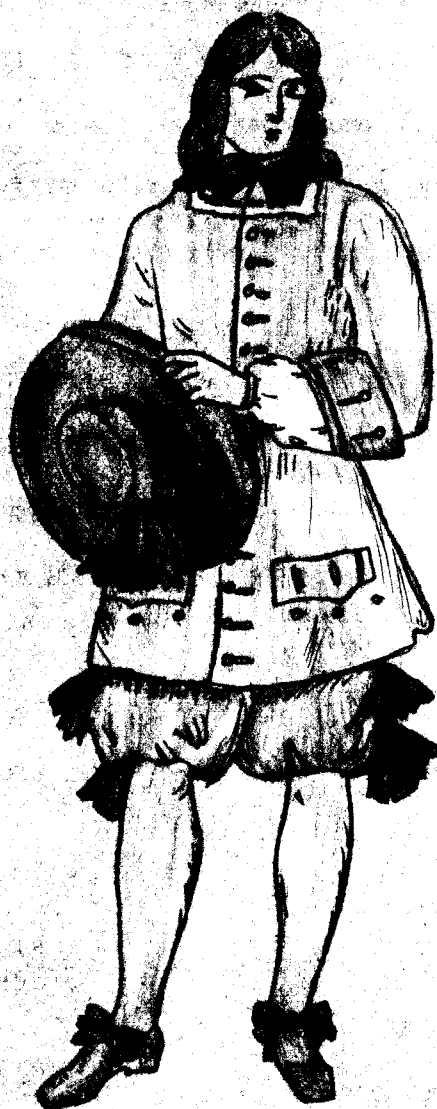
1705 - Louis XIV (From Lacy)