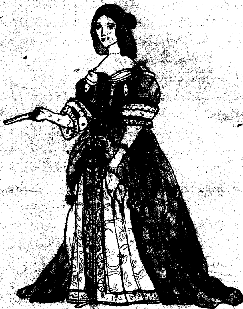
1669 - Louis XIV (From Lacy)