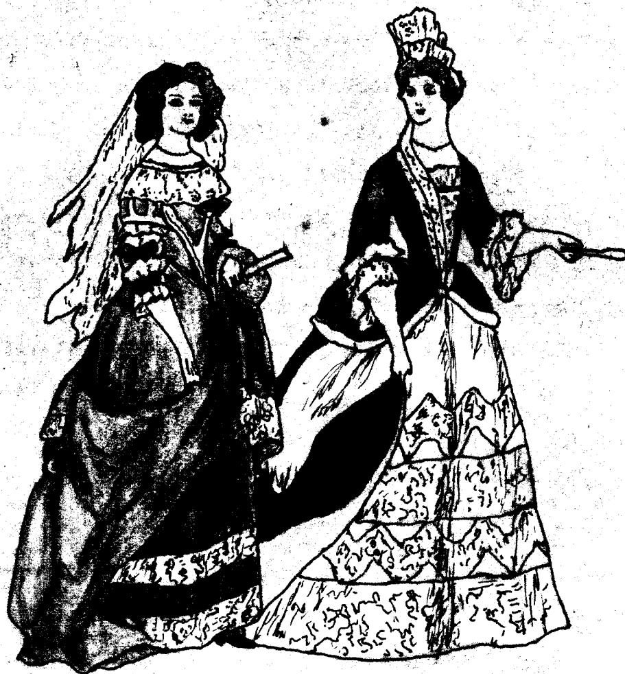
1668-1694 - Louis XIV