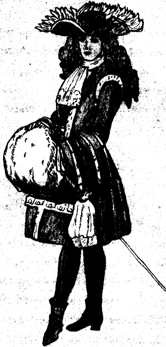
1693 - Louis XIV ♥ (From Lacy)