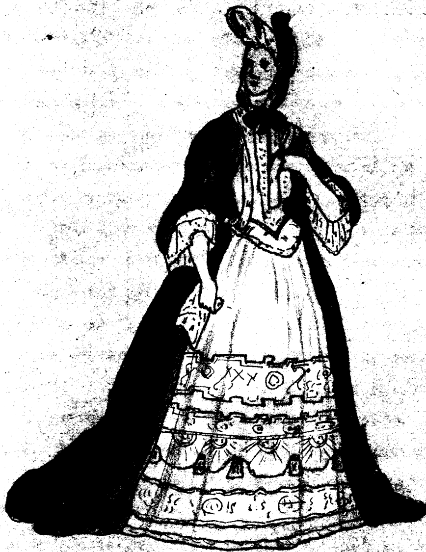
Lady of Rank 1696 - Louis XIV (From Lacy)