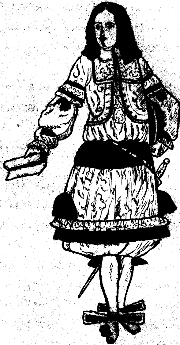
A noble 1670 - Louis XIV (From Lacy)