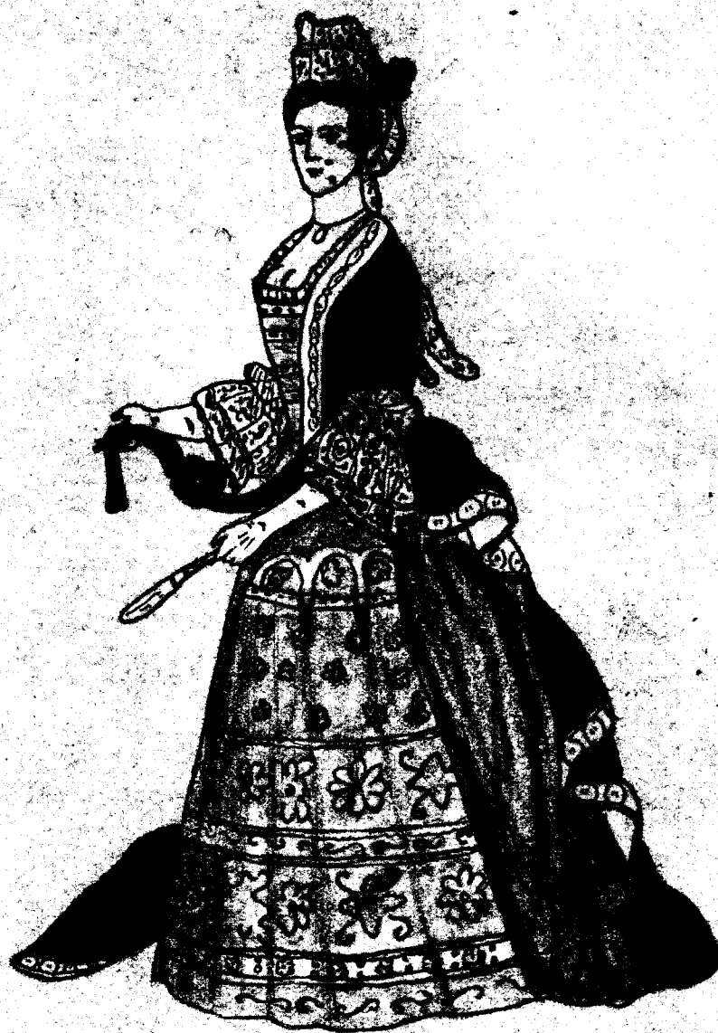
Court Dress 1687 - Louis XIV (From Lacy)