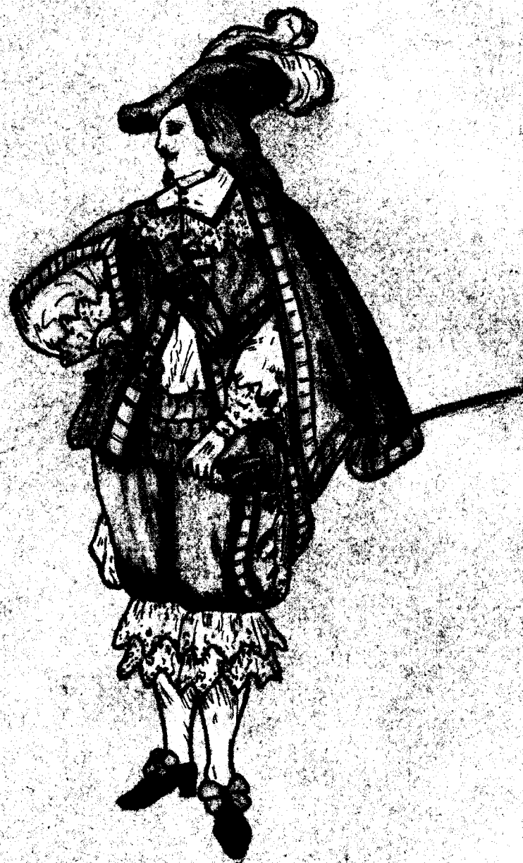
Louis XIV in 1664 (From Lacy)