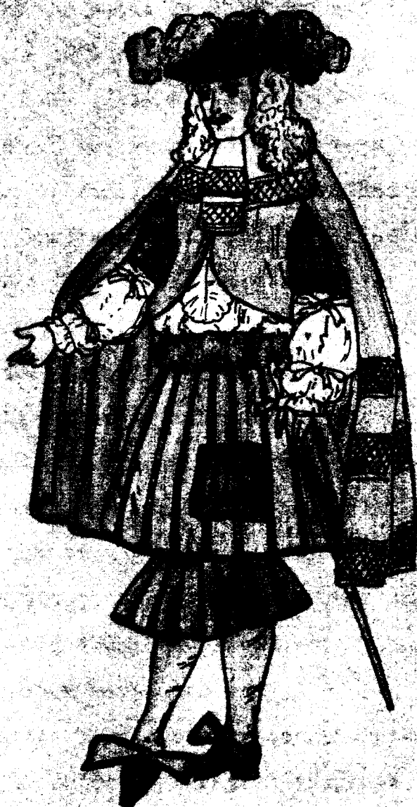
1643 - Louis XIV (From Lacy)