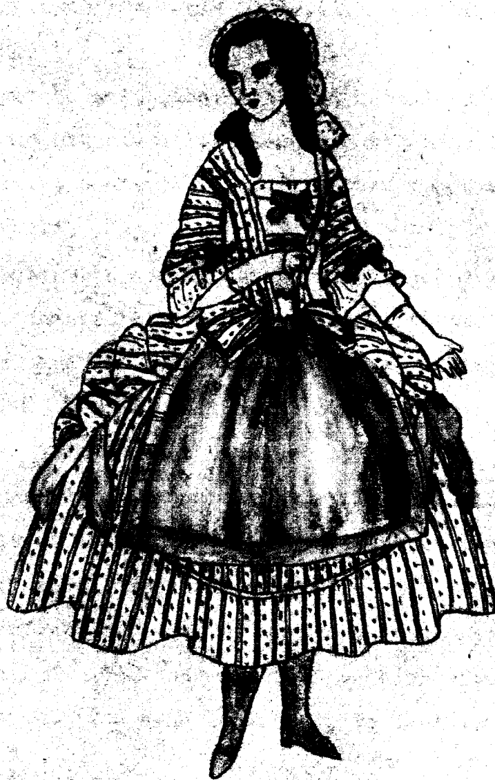
1740 - Louis XV (From Lacy