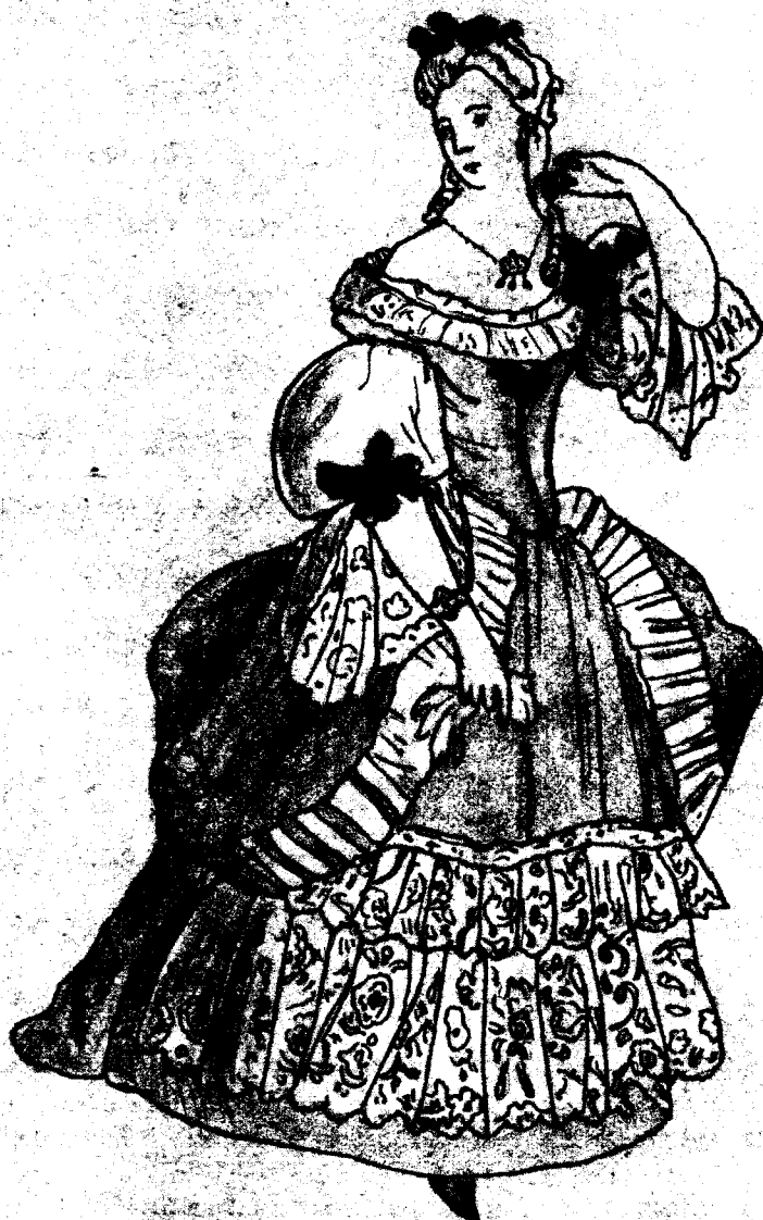
A Lady 1757 - Louis XV (From Lacy)