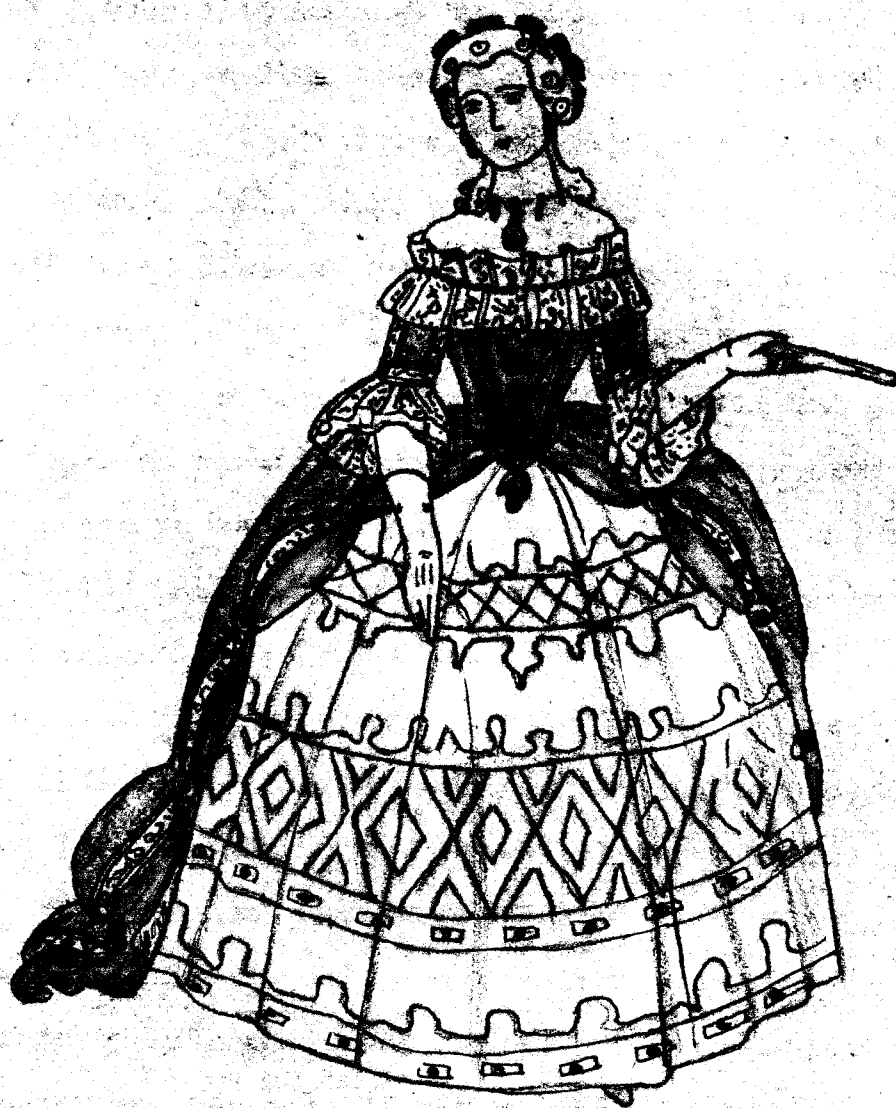
Court Dress 1722 - Louis XV (From Lacy)