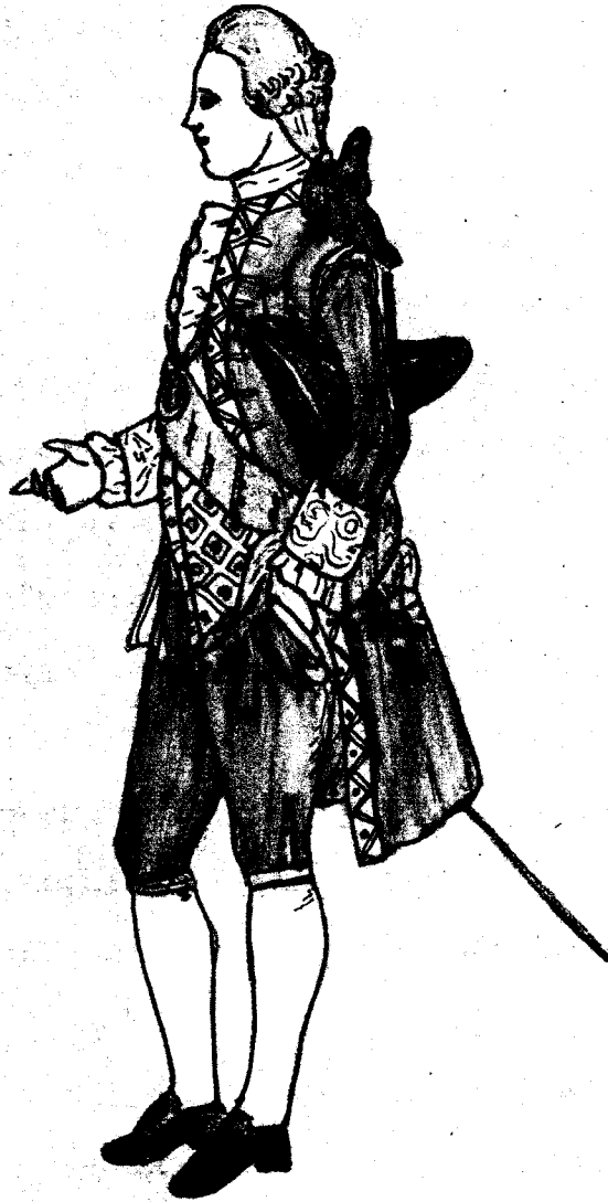
1780 - Louis XVI (From Lacy)