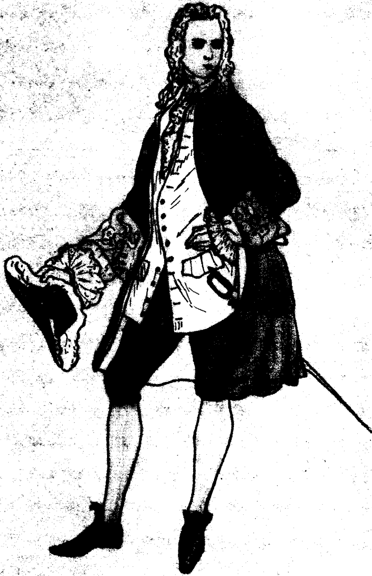
Louis XV (From Lacy)