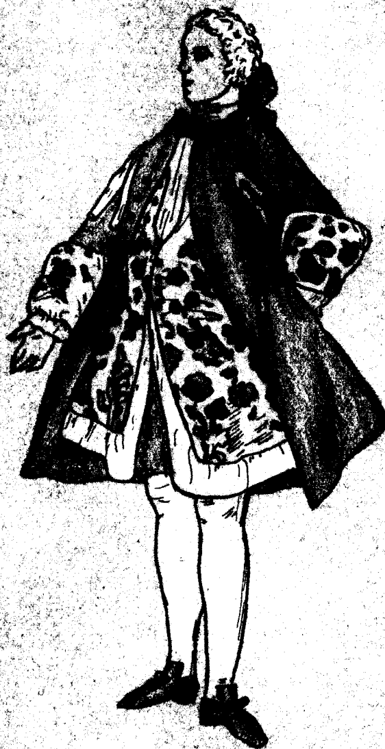
1740 - Louis XV (From Lacy)