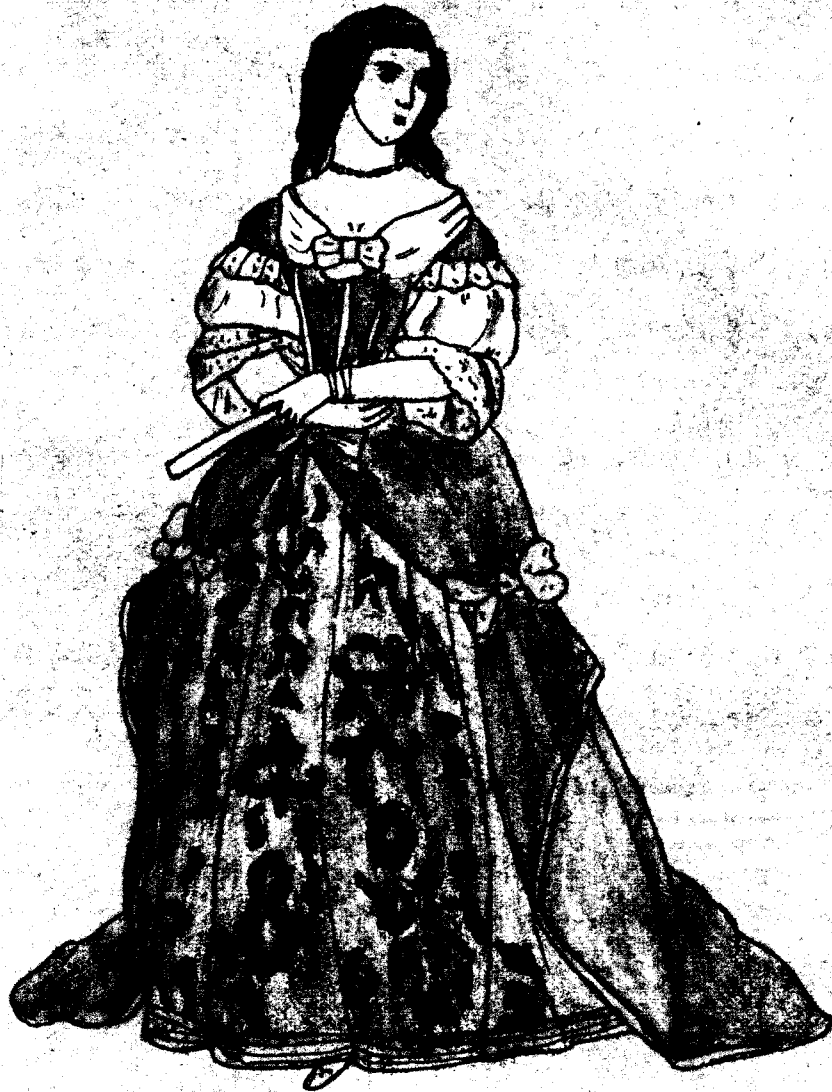
1663 - Louis XIV (From Lacy)