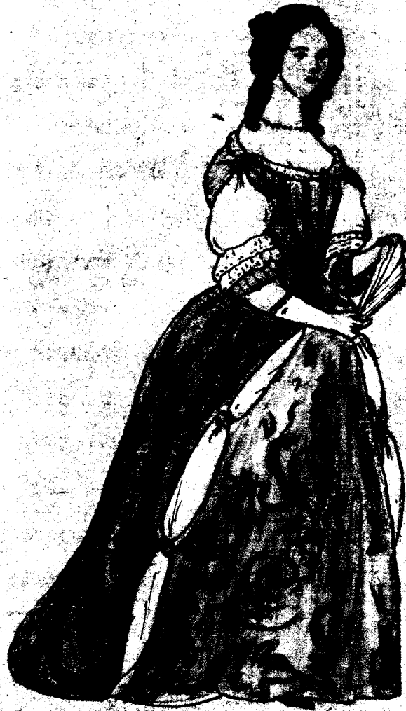
1680 - Louis XIV (From Lacy)