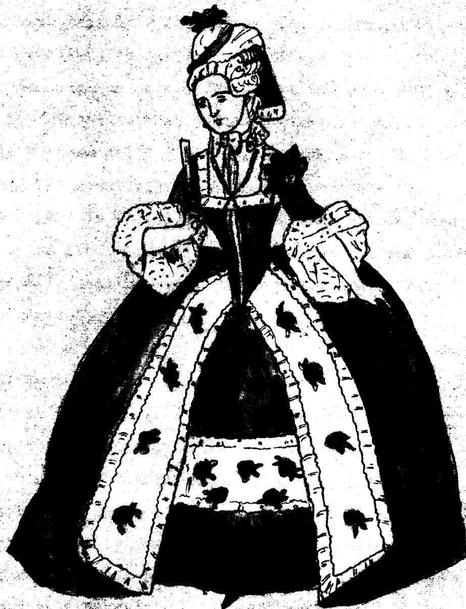
1783 Louis XVI (From Lacy)