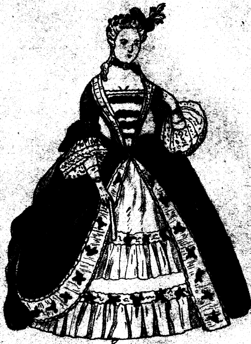
Lady of Rank 1760 - Louis XV (From Lacy)