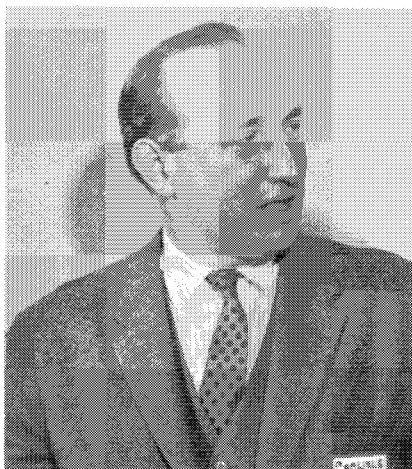
Professor Carl Runge