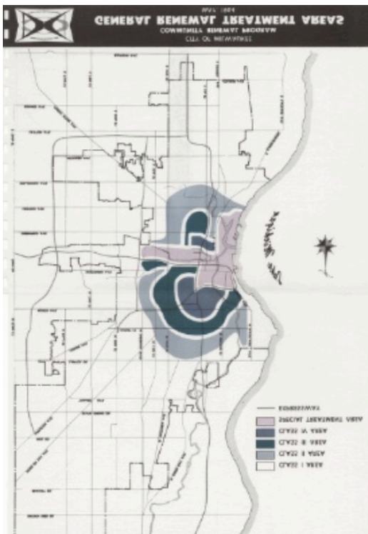
Fig. 04: Milwaukee’s Community Renewal Program Map showing the treatment areas Source: “Milwaukee’s Community Renewal Program: Projects and Objectives, Southeastern Wisconsin Regional Planning Commission, May 1964”