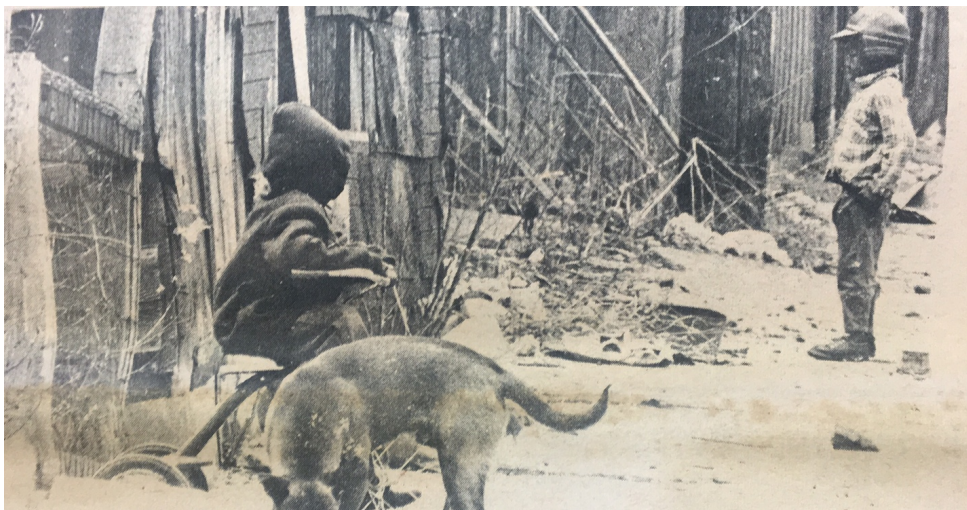
Fig. 03: Activity of two kids in the playground of the inner core Milwaukee

The report, The Housing of Negroes in Milwaukee: 1955 by The Intercollegiate Council on Intergroup Relations, Milwaukee, is a brief survey report on the housing of African Americans in Milwaukee. The survey area was divided into 4 zones; African-American population percentage in these zones were – Zone 1-76%, Zone 2- 45%, Zone- 3-18%, Zone 4- 9%. The survey points out that in terms of education, income, rent and median value of dwellings, these four zones were substandard in comparison to the rest of the city. The report showed that 55 percent of the African-American population lived in fewer than 2 percent of the city’s census tracts. “This agency also found that a 1945 census taken by the Milwaukee Health Department in tracts 20 and 21 [Zone 1 and Zone 2] segregation was more concentrated than it had been in 5 years earlier, i.e. an increase from 75.4% to 80.4% of the non-white population