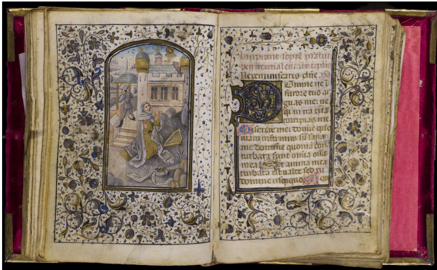
Fig. 4 – fol. 170v-171r, David in penitence and incipit of the Seven Penitential Psalms.

Call # Case MS 53.