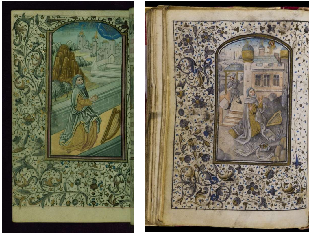
Fig. 12. Left: Walters W 180, fol. 200v. Right: Newberry Library MS 53, fol.170v. Call# Case MS 53

Newberry Library MS 53 and Walters W 180 appear even more closely related when looking at the initials within the text, which, while in general appear fairly typical for the production of the Vrelant workshop of the time (similar initials can be found in the other Walters manuscripts mentioned above), present perfectly identical characteristics in both manuscripts [fig. 13]. The larger ones, painted at the beginning of each hour and in general facing one of the miniatures, present a motif of intertwined clover leaves, colored in dark blue ink with white details, and a very generous use of gold leaf. The medium-sized ones marking the beginning of prayers within the Offices alternate red and blue as the dominant color, but still use gold leaf for the letters themselves and white for the details, while the smaller ones at the beginning of each verse alternate gold leaf with black ink flourishes and blue ink with red flourishes. These two latter types of initials