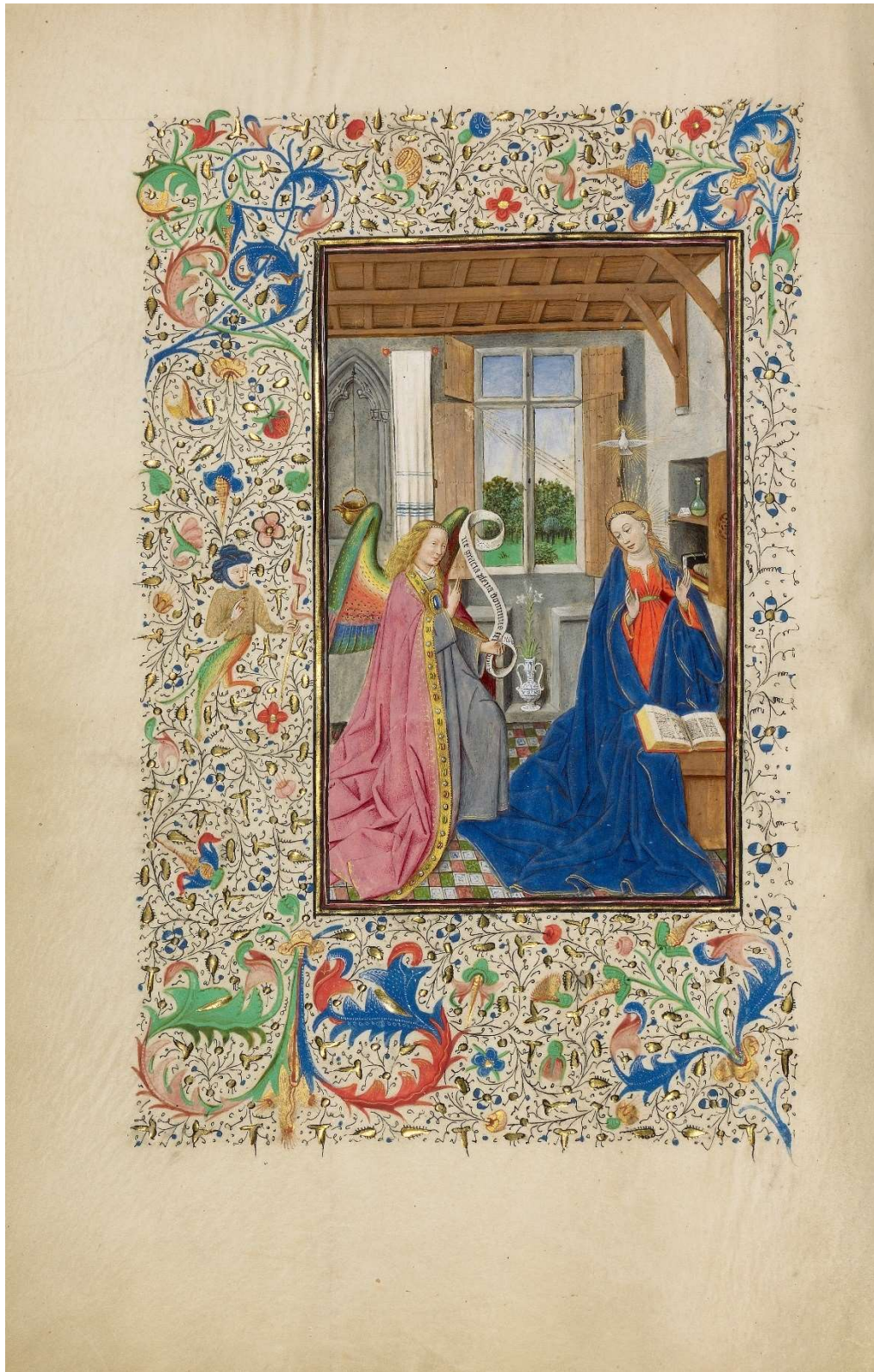
Fig. 6 – MS Ludwig IX 7 (Llangattock Hours), fol. 53v, the Annunciation.