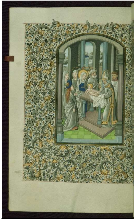
Fig. 10. Walters W 196, fol. 78v.

much larger than the previous manuscript (19.6x12.7cm) also presents many of these characteristics among the smaller figures (along with the same expensive materials as Walters W 197, with an even greater use of ultramarine), but it alternates full color and demi-grisaille miniatures, with the latter, once again, bearing a striking resemblance to those in Newberry Library MS 53. Both Walters W 177 and W 196 also contain some textual evidence which, I believe, can offer the key to unlocking some of the secrets of the Newberry manuscript. I will discuss this particular evidence, and a possible conclusion, in the