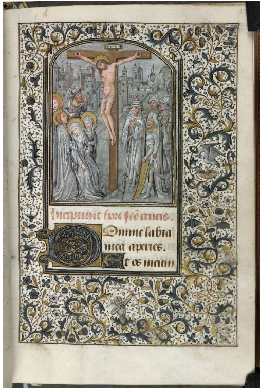
Fig. 7. Yates Thompson MS 4, fol. 27r.

court of Philip the Good, where he held the title of garde-joyaux . The manuscript contains a Crucifixion (fol. 27r.) and a Pentecost (fol. 35r.) that show a great resemblance to the miniatures in Newberry Library MS 53, in the style of the border, the color scheme and the features of the figures depicted. The Crucifixion in particular [fig. 7] is reminiscent of that on fol. 195v. of Newberry Library MS 53 [fig. 5], both in the rendition of Christ and the cross and in the composition of some groups of characters, especially the fainting Mary on the left part of the image and the