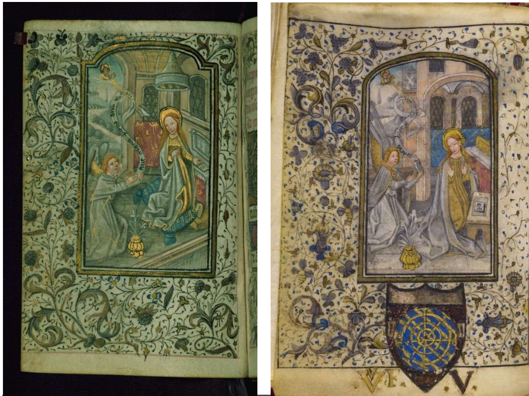
Fig. 11. Left: Walters W 180, fol. 17v. Right: Newberry Library MS 53, fol. 13v. Call # Case MS 53

between the two Annunciations, respectively on fol. 13v. (Newberry Library MS 53) and fol. 17 v. (Walters W 180) [fig. 11], is particularly striking, especially in the face and pose of the Archangel, in the tiny figure of God the Father in the upper left corner, and in details like the golden vase containing a lily on the floor and the pattern of the small altar in front of which Mary is kneeling. Both miniatures present a resemblance with the Annunciation included in the Llangattock Hours [fig. 6], which as mentioned above was modeled after a painting by Van Eyck. Even more evident is the resemblance between the kneeling David preceding the Penitential Psalms on fol. 170v. of Newberry Library MS 53 and the one on fol. 200v. of Walters W 180 [fig. 12]. The two figures appear almost identical in facial features, hair, expression and pose, and were almost certainly traced from the same pattern sheet and differentiated by modifying details of their clothing.