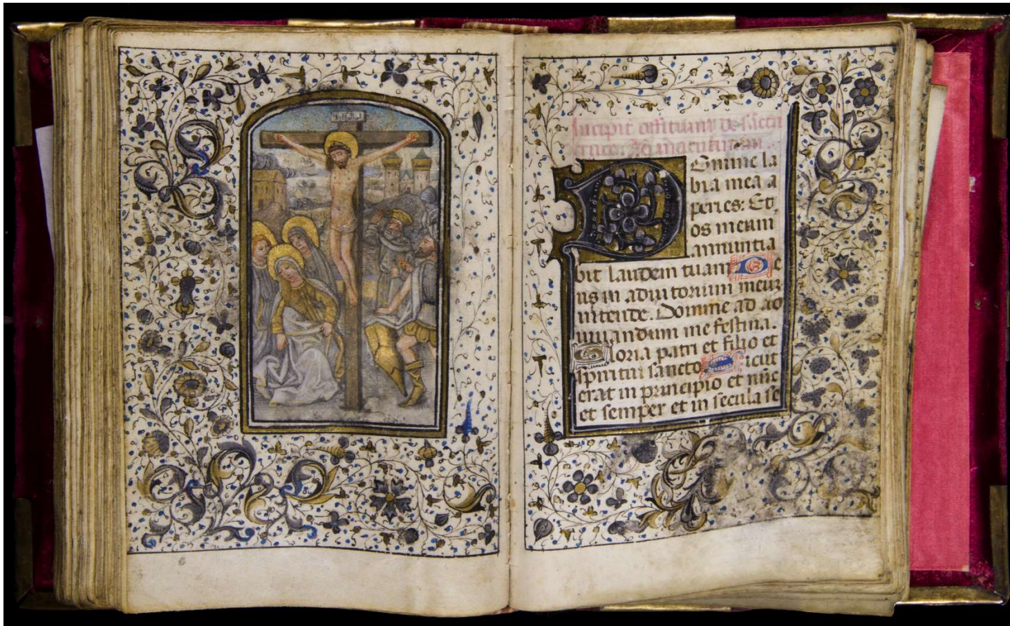
Fig. 5 – fol. 195v-196r, the Crucifixion and incipit of the Hours of the Cross.

Call # Case MS 53.