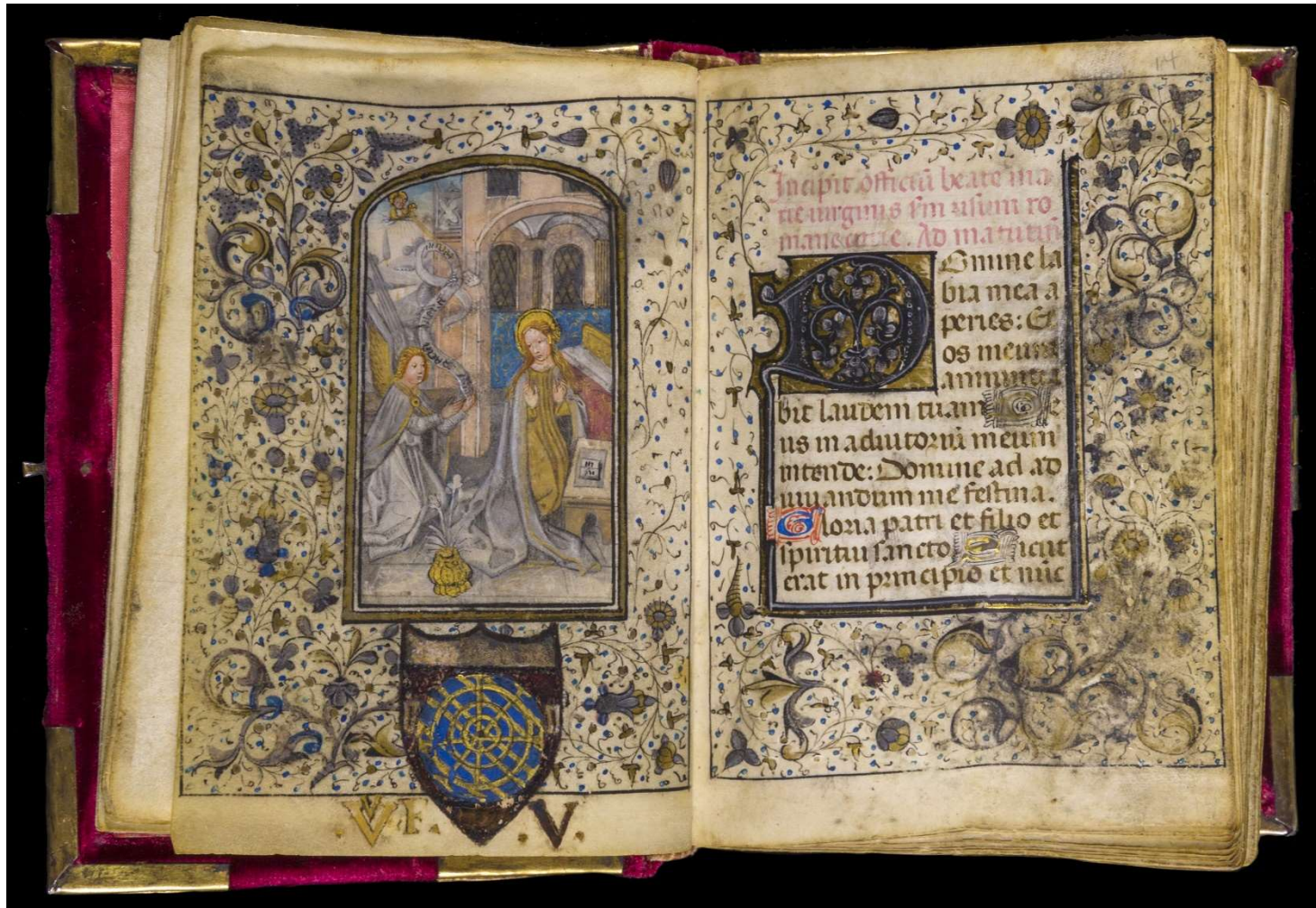
Fig. 1 – fol. 13v-14r, The Annunciation and incipit of Matins of the Hours of the Virgin. Call # Case MS 53.