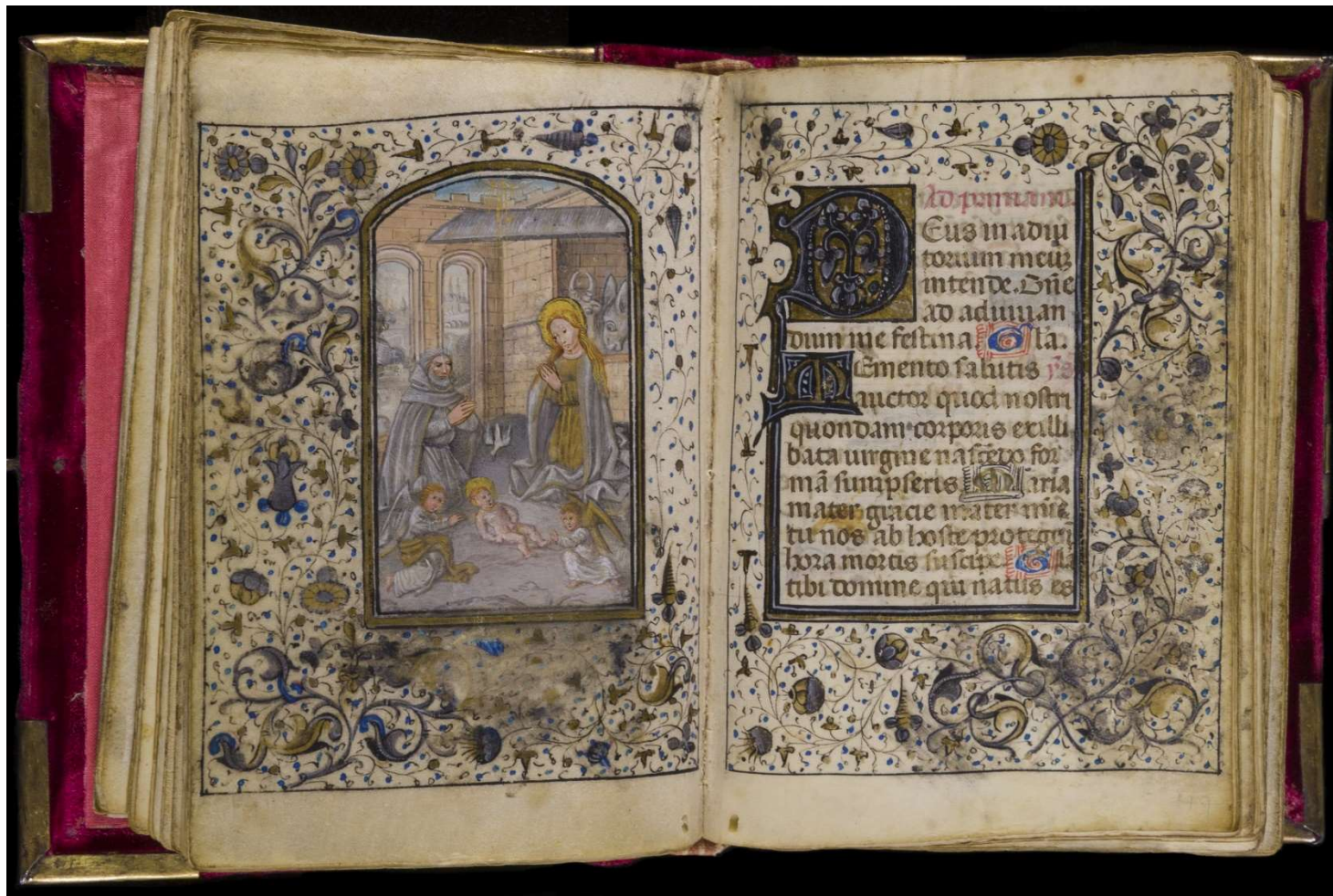
Fig. 2 – fol. 48v-49r, The Nativity and incipit of Prime of the Hours of the Virgin Call # Case MS 53.