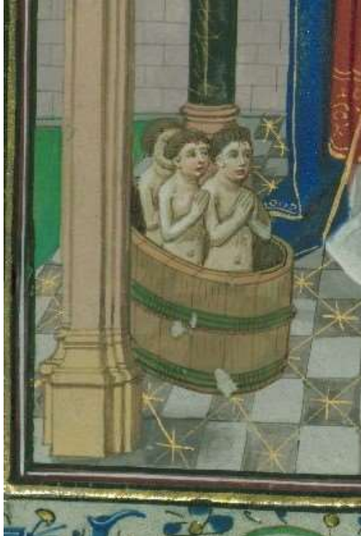
Fig. 8. Walters W 197, fol. 19r, detail.

production of Newberry Library MS 53 the best place to look is probably the collection of the Walters Art Museum in Baltimore. My comparison here will largely focus on a small group of Books of Hours with similar features made during the same time frame (around 1470), with a particular emphasis on any elements that might indicate a relationship in the production of the miniatures.