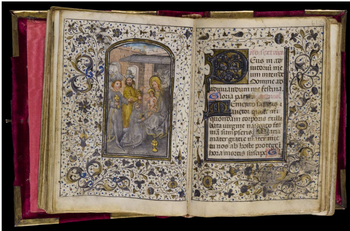
Fig. 3 – fol. 60v-61r, The Adoration of the Magi and incipit of Sext of the Hours of the Virgin. Call # Case MS 53.