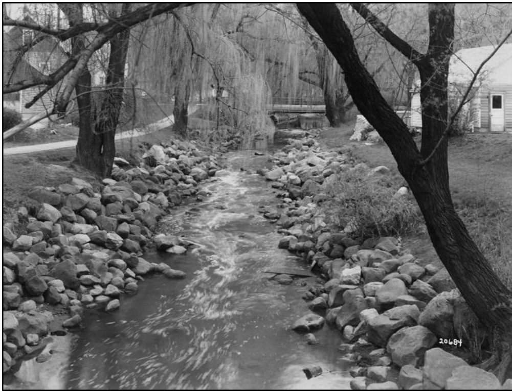
Figure 4. Kinnickinnic River prior to channelization

the Park Commission gave consideration to the potential for individuals to put themselves, knowingly or perhaps unknowingly, into a space of risk, with implicit concern about the potential negative consequences it may create in the future. It would only be a matter of time before concerns over building in the floodplain resurfaced.