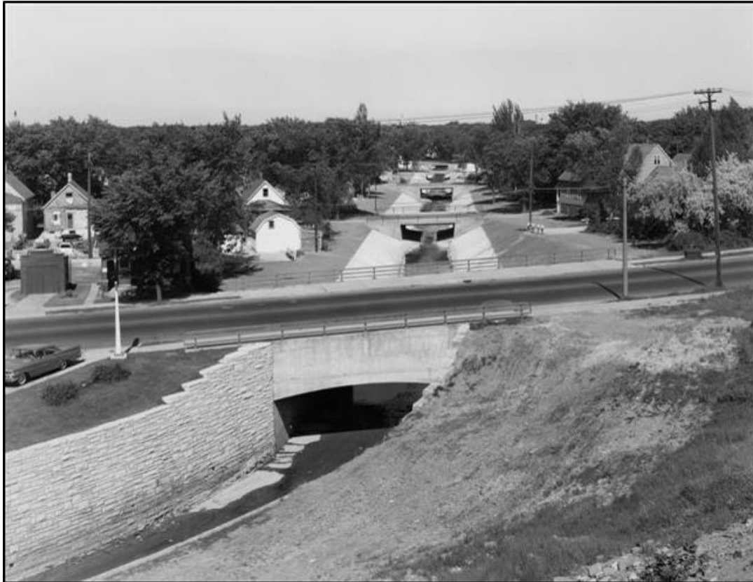
Figure 6. Kinnickinnic River post-channelization, June 15, 1961

constrained by homes and other structures built near the river's edge (Wieland 1976). The Sewerage Commission knew at the time the Kinnickinnic River was being channelized that the concrete channel would become increasingly incapable of adequately transporting significant stormwater flows should the watershed upstream continue to urbanize (Wieland 1976).