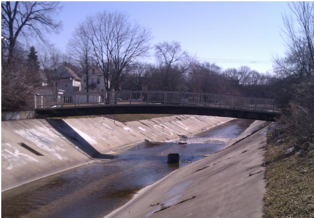
Figure 1. The Kinnickinnic River

river corridor. The concrete channel provides no ecological or aesthetic value. But a recent river rehabilitation project is underway as an attempt to address the multiple problems the Kinnickinnic River generates for residents in its current condition.