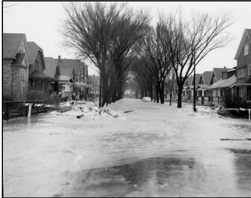
Figure 5. Flooding on South 12 th Street near the Kinnickinnic River, March 30, 1960

Milwaukee County were blocked by floodwaters. Pressure from ice jams in the Root River created a three inch crack in a highway bridge (“Peak Rain Floods City” 1960). Several other ice jams worsened flooding along waterways, prompting firemen to dynamite them to pieces (Photo caption 1960). Flooding knocked out power in many neighborhoods and residents in the worst hit areas had to be evacuated (“Peak Rain Floods City” 1960). The Milwaukee Fire Department was overwhelmed with thousands of telephone calls requesting assistance in pumping flooded basements. But basement pumping was useless until the sewers were able to handle the amount of stormwater falling. The sewerage system was inundated with water flowing in at a rate of 50 million gallons per day over its capacity (“Peak Rain Floods City” 1960).