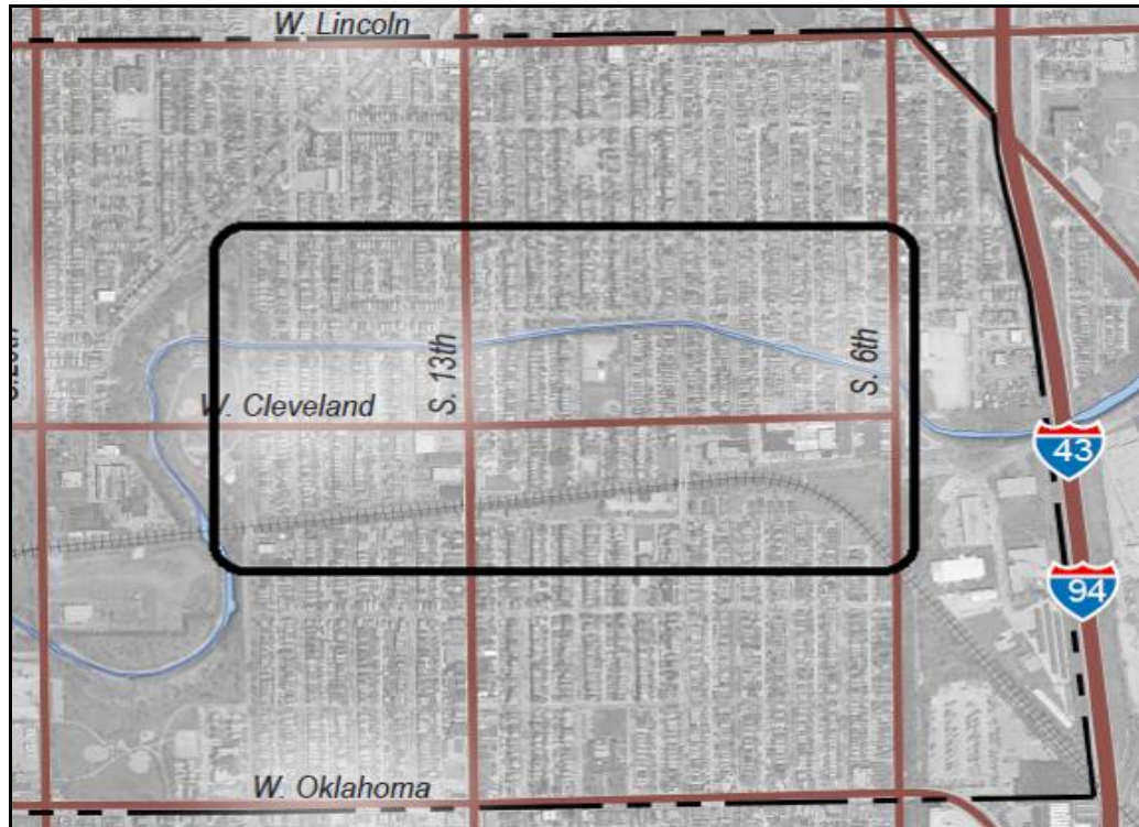
Figure 2. Study area

unique environmental justice concern. I propose a historical and conceptual river engineering and social justice framework in Chapter Three through which I situate my historical and empirical research. I discuss my methods for conducting my research in Chapter Four.