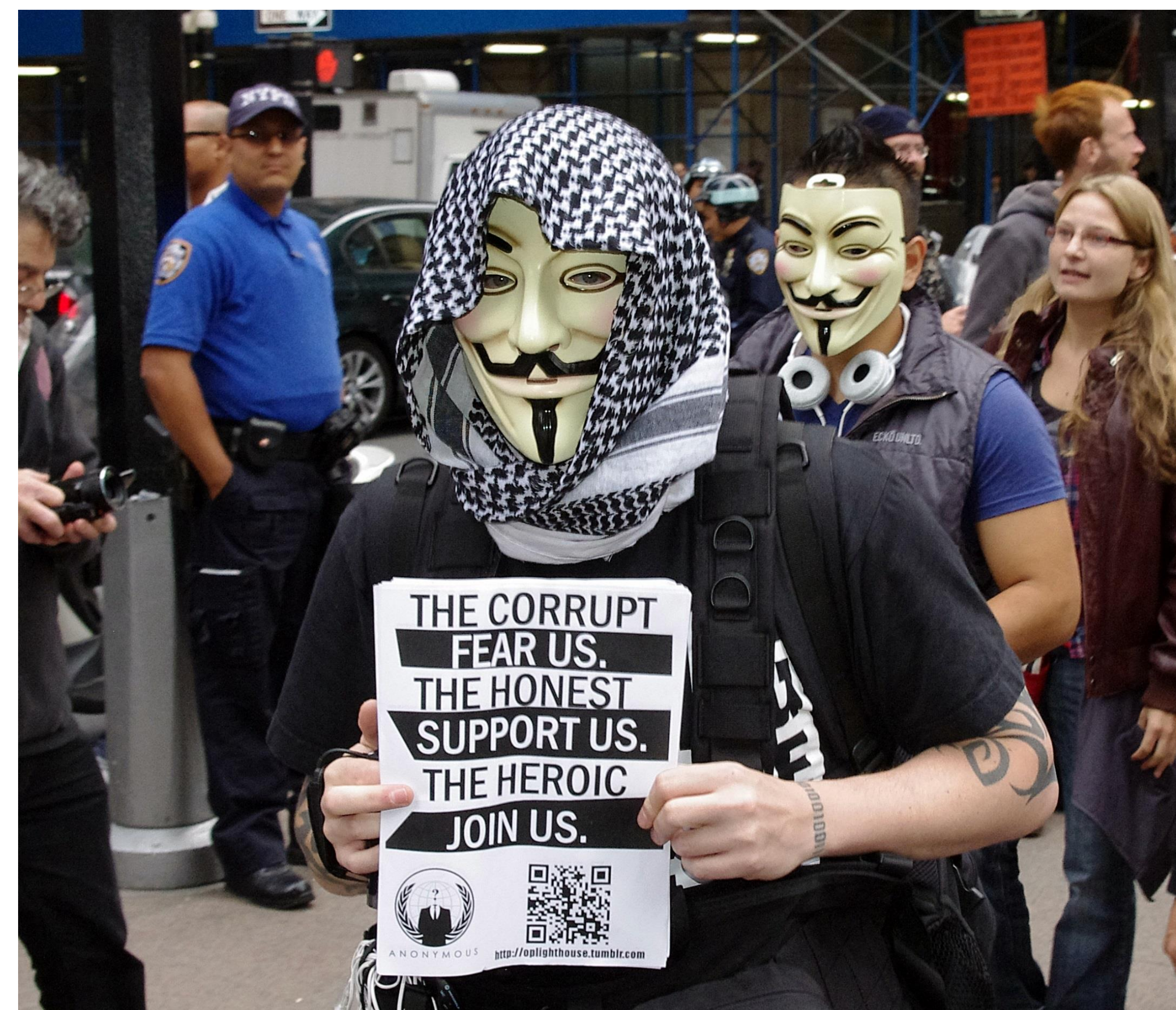
Advocate of Anonymous at Occupy Wall street