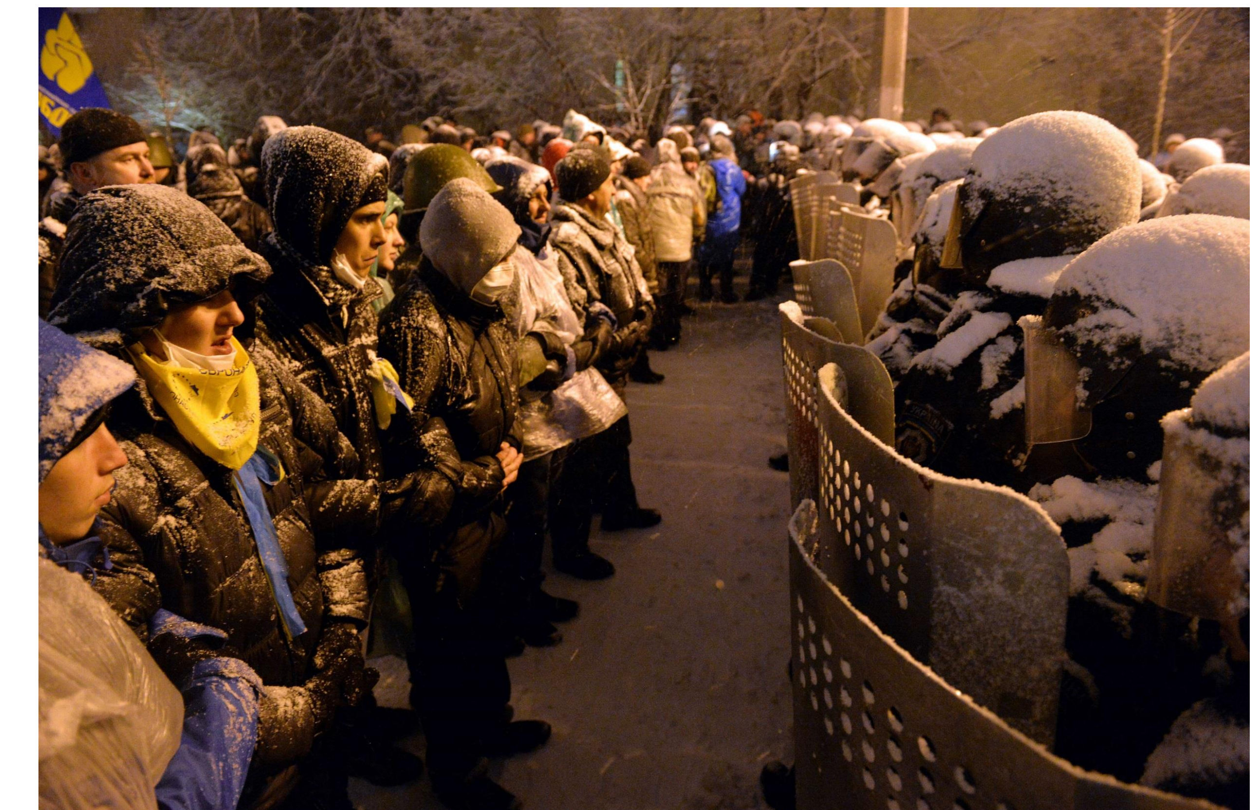
Members of Euromaidan stand off against riot police