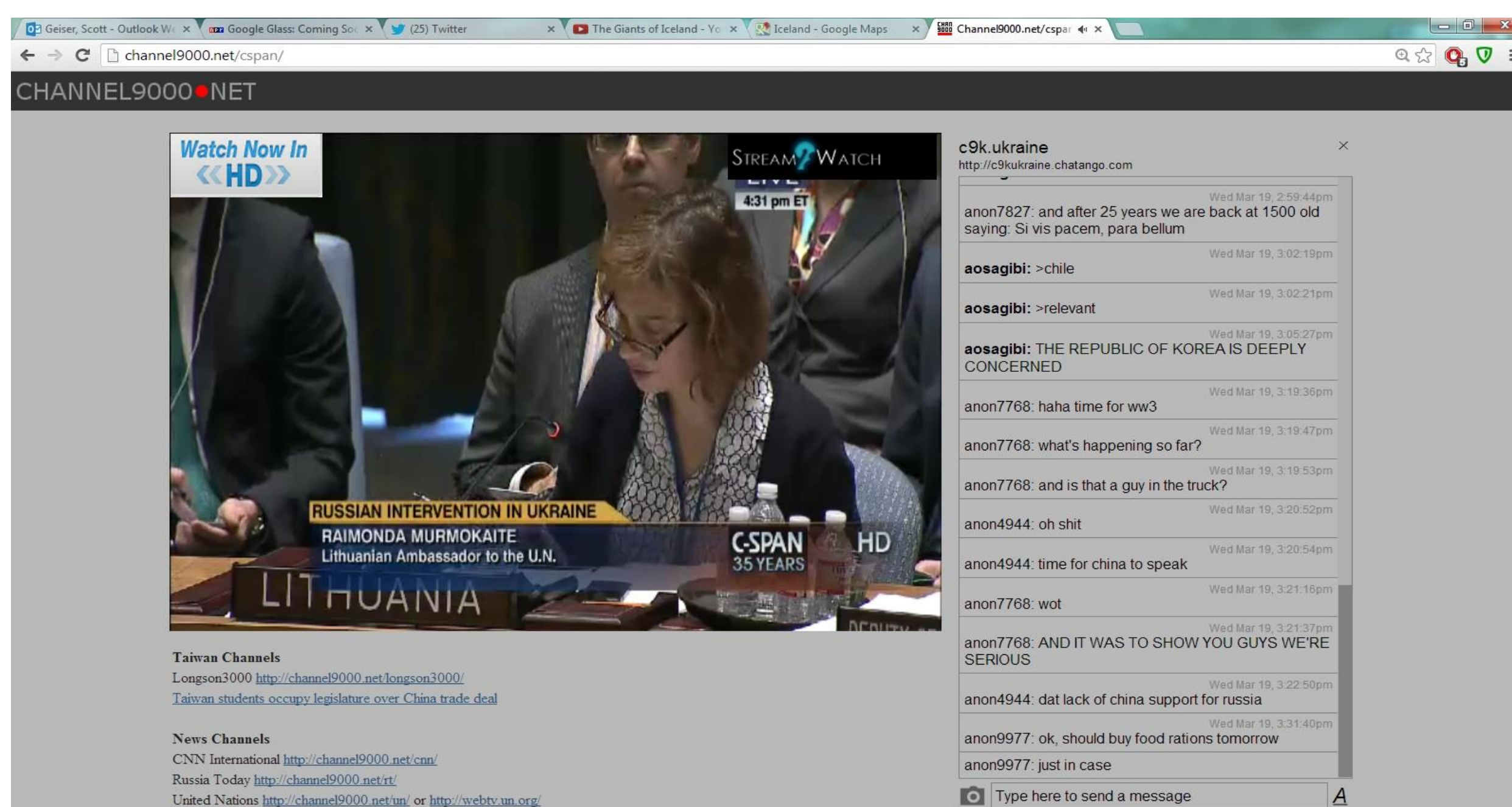
Chat room watching UN meeting on Ukraine