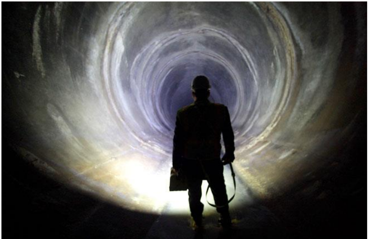
Milwaukee Journal Sentinel