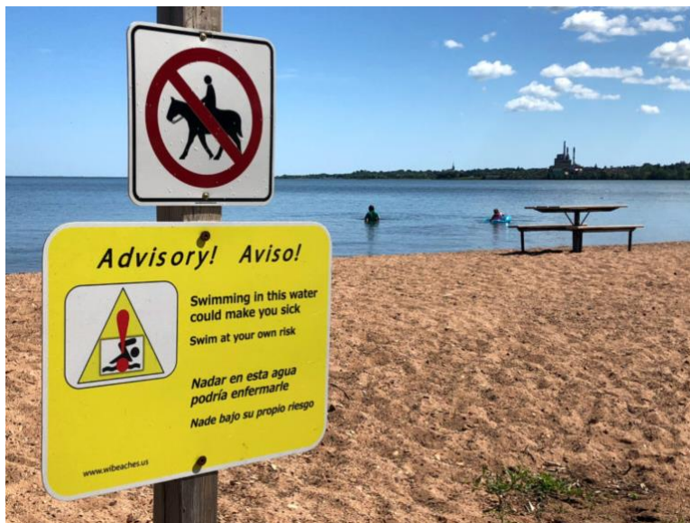
Wisconsin Public Radio

Although it is essential for UWM students to understand what encompasses a combined sewer overflow, this knowledge is not valuable unless there is also awareness of how CSO exposure can take place. With discharge from Milwaukee’s combined sewer system acting as a vector for pathogens of all varieties, contact with the contents of a combined overflow is needed before there can be any threat to personal health (City of Portland). Depending on the nature of one’s lifestyle, the probability of an individual encountering some sewage-borne pathogen can be higher or lower than another’s — something that goes for UWM students as well. This is only reinforced by the United States EPA who, in a recent article, pointed out that drinking water, public spaces like beaches, shellfish, and even inhalation or skin absorption are all avenues for contact between raw sewage and the public. Keeping in mind how UWM students normally