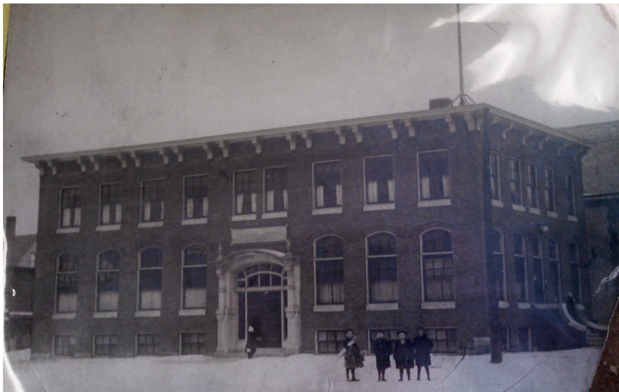
The Settlement House, about 1900.