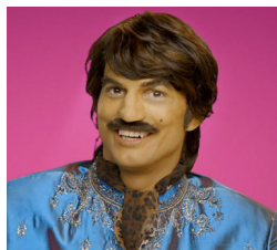
Ashton Kutcher for Pop Chips (2012)