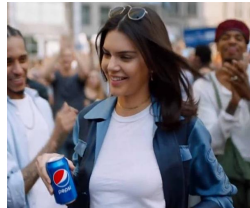
Kendall Jenner for Pepsi (2017)

The three images to the right represent the celebrity influencers we highlighted in our study. Each influencer participated in marketing campaigns that generated controversial messages among the public. The messages portrayed in each scenario stimulated either a favorable or unfavorable response. The celebrities who took part in these campaigns are: Kendall Jenner, Colin Kaepernick, and Ashton Kutcher.