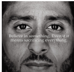
Colin Kaepernick for Nike (2018)