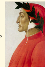
Portrait of Dante by Sandro Botticelli