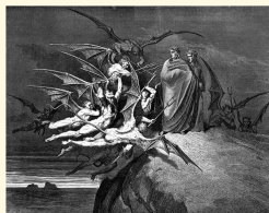
Dante and Virgil confronted by demons in the Fifth Bolgia (Gustave Doré)