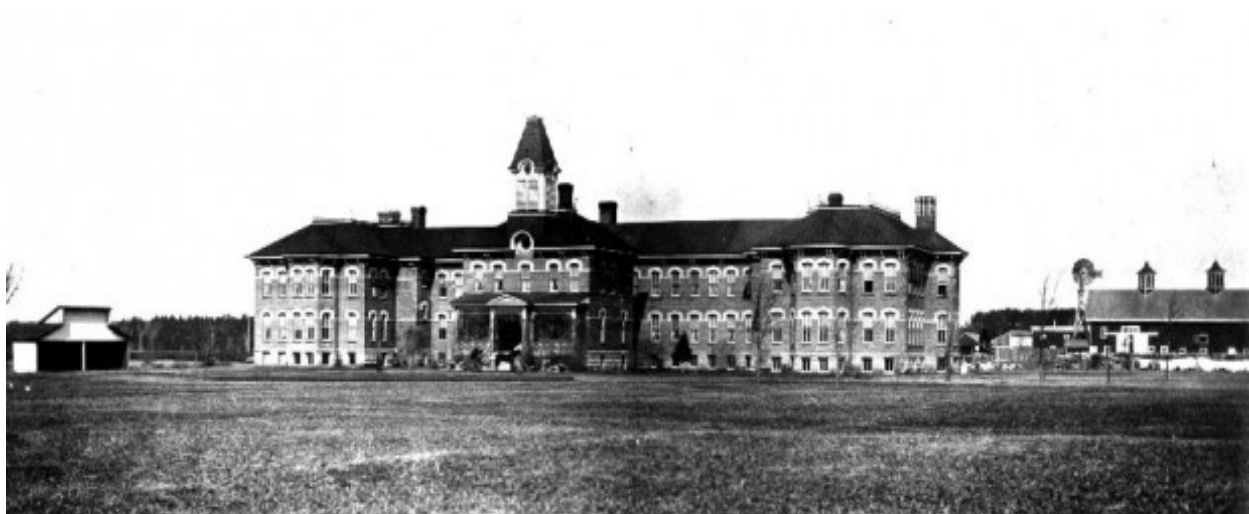
Figure 3: Dunn County Poor Farm and Asylum building. Central structure was home of superintendent and family while wings were occupied by inmates.

While it is most certainly the case that county institutions sought to expand to meet the needs of a growing population of insane and destitute people, there are identifiable ulterior motives to the physical growth and modernization of asylum buildings themselves. Carla Yanni argues that the design of these Kirkbride style buildings enforced the autocratic administration of superintendents and helped to better organize and segment a population of potentially uncooperative laborers. 66 The aging and often dilapidated farm houses that previously were used as the county poor home were ineffective in terms of being able to manage inmates as laborers. 67 The increase in inmate capacity was also important not only for utilitarian reasons of supporting larger populations of individuals being placed in the asylums but also from the perspective that more inmates meant more workers.