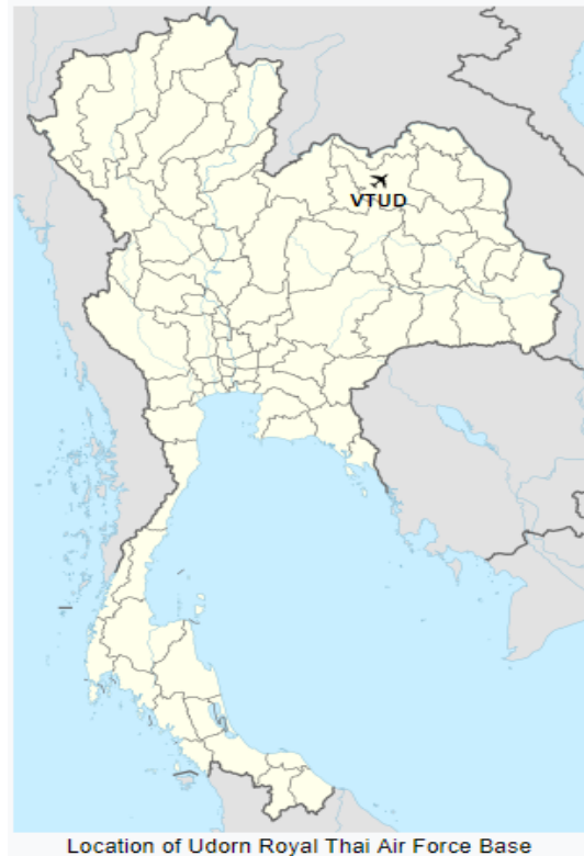
Figure 1: Map of Udorn Air Base in Thailand