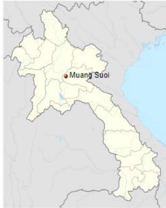
Figure 3: Map of Muong Soui, Laos Source: Wikipedia https://en.wikipedia.org/wiki/Muong_Soui

good to Southern Vietnam. 23 Losing Muong Soui forced GVP to launch Operation Off-Balance which utilized T-28's to try and recapture the lost base. Initially, GVP thought that the Neutralist would assist with this operation, but the results included them abandoning the Hmong people on the ground fighting in Muong Soui. Braving the bad weather, Hmong pilots, which included Lee Lue, flew their T-28's to attack the North Vietnamese Army in order to help the Hmong people isolated in the hills who were abandoned by the Neutralist. The puzzle piece of Lee Lue's death would be inserted under the section "Death of Lee Lue" later in the paper.