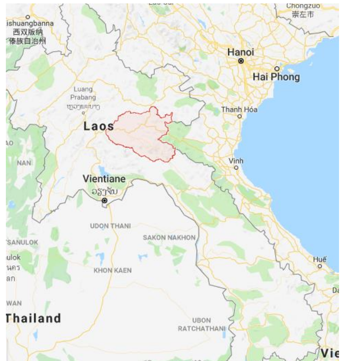
Figure 5: Map of Xieng Khouang Province, Laos shaded in light red