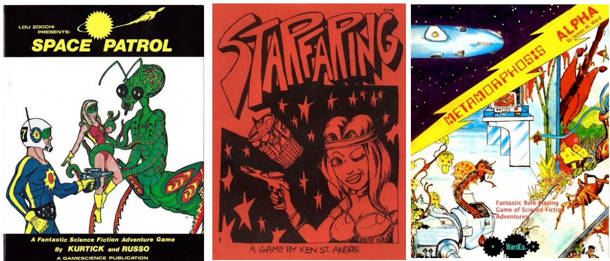
Figures 2,3,4 Space Patrol , Starfaring , and Metamorphosis Alpha TRPGs.

For the 1970s and 80s, Traveller became the standard-bearer for tabletop science fiction roleplaying. Traveller has been continually published and in print since its initial release –by multiple publishers that have released different evolutions of the original game. The last two editions were released in 2019 (Far Future Enterprises’ “5.10 edition”) and 2022 (Mongoose Publishing’s “second edition”). Appelcline posits that, in addition to the fortuitous release of