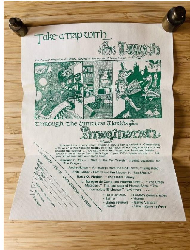
Figure 1 Dragon Magazine Ad

The worlds of Appendix N texts (and how they work), were once merely embodied in novels and short stories. They are now embodied within the games shaping modern culture and media. In addition to the current edition of Dungeons & Dragons (fifth edition, 2014), other modern TRPGs, such as Labyrinth Lord (2002), Lamentations of the Flame Princess (2012), and Dungeon Crawl Classics (2013), all promise to model ludic engagements with Appendix N-style works. These modern TRPGs, encouraged by the OSR community reflect a nostalgia for early