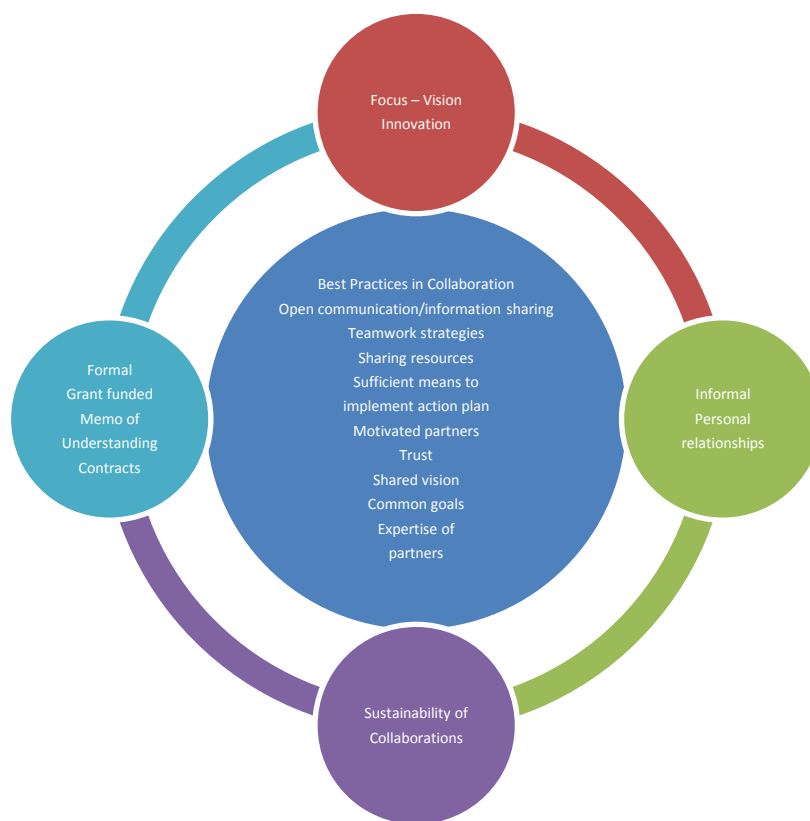
Figure 1/CCR Framework

The guide then lists several reasons why it is important for community stakeholders to collaborate when focusing on problem-solving that centers, in this case, around the idea of utilizing sanctions other than incarceration for lower level offenders. The guide suggests that a community follow the model below depicted in Figure 1, in order to have the best chance to achieve success in implementing a CCR.