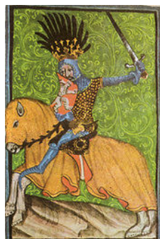
Portrait of King John of Bohemia, leader of the Siege on Medvėgalis