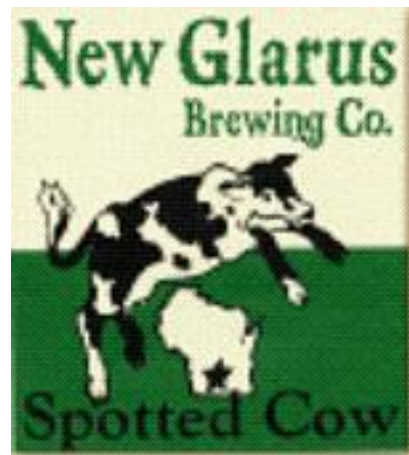
Figure 7. New Glarus Spotted Cow ( newglarusbrewing.com )

The names and images of the products are not the only way a microbrewery can emphasize its local roots. Many microbrewery names are reflective of the area they inhabit. This allows microbreweries to use their regional location to contribute to the development of a sense of place and community identity (Schnell and Reese 2003: 56). It is clear that the name of the New Glarus Brewing Co. contributes to the consumer's community attachment, because when they are drinking it they see the name "New