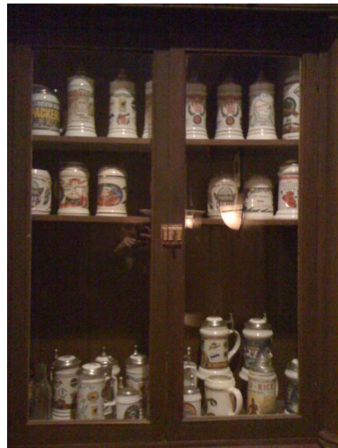
Figure 2. Beer steins displayed at Capital Brewery

A notable part of this trend to use local history is in contrast to major brewers such as Anheuser-Busch and Miller-Coors. Microbrews brew specialty and seasonal beers to fit in with seasons while large beer-makers simply brew the same beers all year