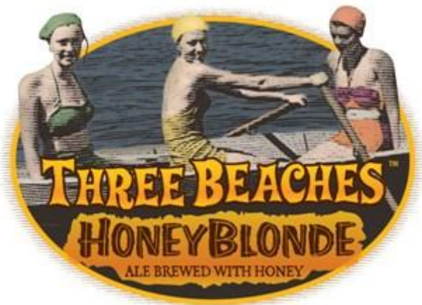
Figure 5. Tyranena Brewing Company's Three Beaches Honey Blonde

associate it with Madison. Also, most if not all of the beer produced by Tyranena Brewery has a regional or local name. Its “Three Beaches Honey Blonde” (Figure 5) is named for the three beaches of Rock Lake, the lake that Lake Mills is situated around. Its “Stone Teepee Pale Ale” is named after a local legend surrounding a mysterious group of pyramids that lie below the surface of Rock Lake. Another example of a microbrewery naming its product after regional experiences is The Great Dane’s “Peck’s Pilsner.” The