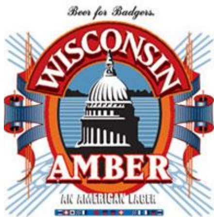
Figure 6. Capital Brewery's Wisconsin Amber ( capitalbrewery.com )

In addition to naming the beers, images play an important role in capturing a local identity. When picking an image to go alongside the local name of a brew, the brewers choose images associated with the location (Schnell and Reese 2003: 55). Images reflect local areas and are drawn from deep-rooted affection of the places where they are from (Schnell 2003: 57). Capital Brewery epitomizes this by placing an image of the Wisconsin State Capitol building on their most successful beer, Wisconsin Amber (Figure 6). New Glarus brewery emphasizes Wisconsin as a prominent dairy state with the logo on their beer, Spotted Cow (Figure 7).