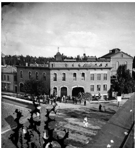
Figure 1. The old Capital Brewery (Wisconsin State Historical Society)

When thinking about the Madison area specifically, it has a history as a major component in the aforementioned Wisconsin beer-drinking culture. When Milwaukee emerged as a dominant American beer-producing city in the late 19th century, recognition and popularity spread to Madison. Most notably recognized is the old Capital Brewery (1854-