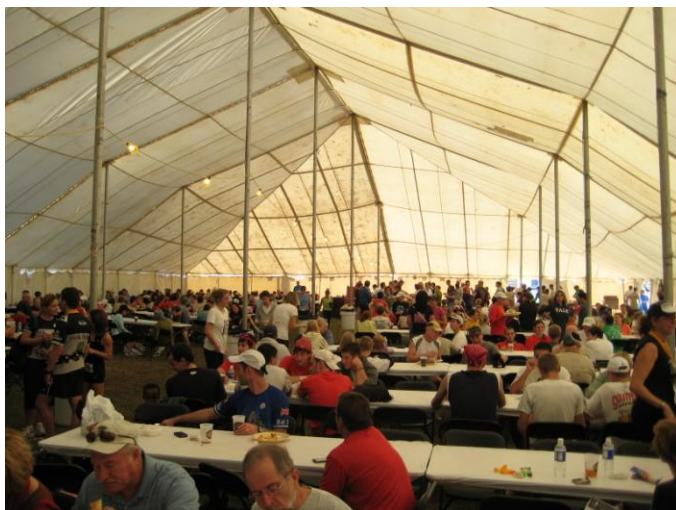
Figure 8. A sample of the 1500+ participants at the Tyranena beer run, in the beer tent.

Tyranena Brewery offers the type of community organizing opposite of the Great Dane. Tyranena does not do outside monetary sponsorships but hosts all of their events internally. The Tyranena Oktoberfest bike ride is a fundraiser for the charity "Tomorrow's Hope." Twenty-thousand dollars was donated this year. The Tyranena Beer Run raises money for the Lake Mills Food Pantry, the Jefferson county Animal Shelter and Christmas neighbors. It attracts over 1,500 participants and annual donations range upwards of 14,000 dollars and 18,000 pounds of food (Figure 8). Every June Tyranena will sponsor a dog wash for the Humane Society hosted at their brewery in Lake Mills, WI.