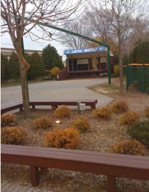
Figure 9. Capital Brewery's Bier Garten

Capital Brewery also brings people to its brewery for events held at their Bier Garten (Beer Garden, Figure 9). Their events serve more as a gathering point than a charitable event. During summer months, live music is played every Friday with local beer on tap at the outside bar. The inviting atmosphere at these events means a great gathering point for friends and families. Capital Brewery has also been asked to have a strong presence at weddings and