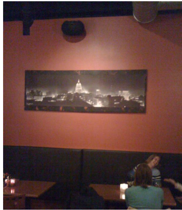
Figure 3. A panorama of the Madison city skyline hangs in the Ale Asylum brewery

Additionally, many are painted with the images or colors reminiscent of the area to develop an ambiance reflective of the surrounding region. This allows local community members to not only relate to the brewery and beer, but to take pride in the culture and history of where they live.