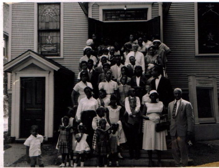
Figure 1. Faith Church of God circa 1960, 1621 Albert Street Racine, WI