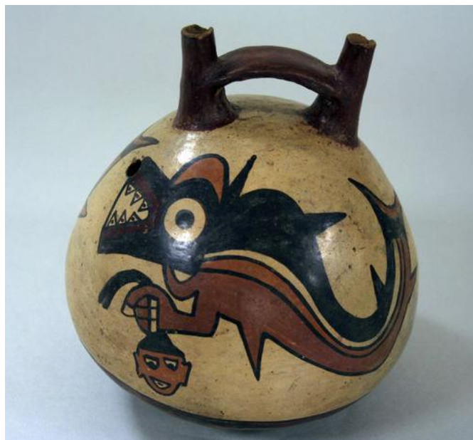
Figure 6: Nasca Killer Whale on Double Spout Vessel. (Metropolitan Museum of Art:64.228.70).

The Killer Whale Motif in Figure 6 appears on a double-spout and bridge vessel against a white background. This icon depicts the spirit and movement of the animal with an “S” shaped