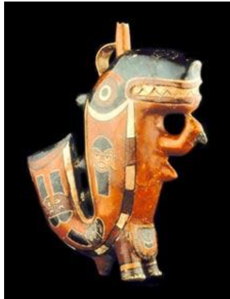
Figure 7: Nasca Apogee Epoch Killer Whale Vessel. ( Larco Herrera Museum).

curved body. Its eye and fangs are emphasized, and a human arm holds a trophy head by the hair. Again, this motif is facing towards the left similar to most other Killer Whale icons. This vessel was a gift to the Metropolitan Museum of Art in 1964 by Nathan Cummings and unfortunately does not have provenience data associated with it. The dimensions of the bottle are 6 ¾ inches in height with a diameter of 6 ¼ inches.