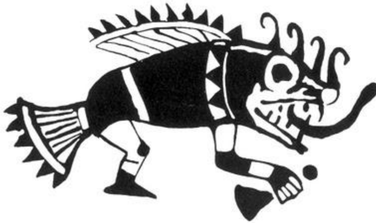
Figure 11: One Example of a Demon Fish. (Donnan and McClelland 1999: Figure 4.2).

The motif pictured in Figure 11, the so-called Demon Fish, was taken off a Moche stirrup spouted vessel that had been dated from the Moche III Phase. The Demon Fish, who appeared during the Moche III phase and continued into Moche V, is often seen in Moche fineline painting holding a tumi knife in an anthropomorphic hand (Donnan and McClelland 1999:67). During Moche Phase IV, the Demon Fish was the most prevalent anthropomorphic being depicted alone, or in combat with other supernatural creatures (Donnan and McClelland 1999:112).