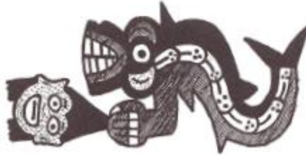
Figure 3: An example of a KW-2 Motif. (Proulx 2006: Figure 5.46)

Proulx describes as “Traditional Mythical Killer Whale Holding a Weapon and/ or Trophy Head.” He refers to these under the category of KW-2 (see Figure 3).