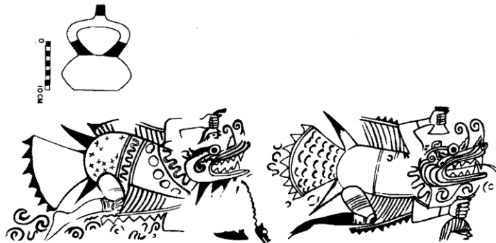
Figure 8: Moche Fish Monsters, possibly Bonito. (Shimada 1994: Figure 9.7).

The tradition of supernatural head-takers seems to have been borrowed by the Moche from their Cupisnique predecessors. The Moche decapitators - the spider, bird of prey, monster, fish, and human - are the same in the Cupisnique style, suggesting a continuing tradition of belief (Benson and Cook 2001:23). Alana Cordy-Collins suggests that each temporal region may have had their own patron decapitator; regions could be split into valleys, settlements, or groups. She also claimed “there is only one single example of a Fish Decapitator” (Cordy Collins 1992). She did not mention in her article what her qualifications for a Moche Fish Decapitator were, however, by the other three possible Fish Decapitators pictured below we can be certain that more have been discovered since the date at which she published her article in 1992.