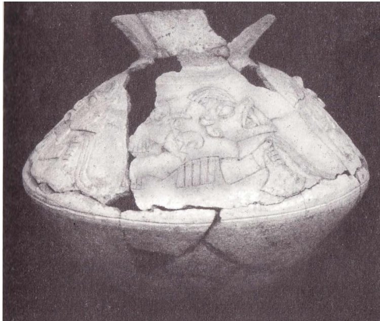
Figure 10: Moche Fish Decapitator found at the Dos Cabezas Site. (Benson and Cook 2001: Figure 2.3).

The motif pictured in Figure 10 was discovered in an excavation in 1994 through the Dos Cabezas Project in the Jequetepeque Valley. What is really fascinating about this bowl was that it was discovered in what seemed to have been a fishermen's barrio. Local informants from the area claim that prior to the 1994 excavation, one other Supernatural Fish Decapitator had been located at the site (Benson and Cook 2001:23,26). The eyes and fangs are clearly depicted in this motif. The Decapitator holds a tumi knife in his anthropomorphic hand and swims towards the right. The motif lacks the "S" shaped curve seen in other motifs, however possesses unique decorative shapes in its body, such as triangles.