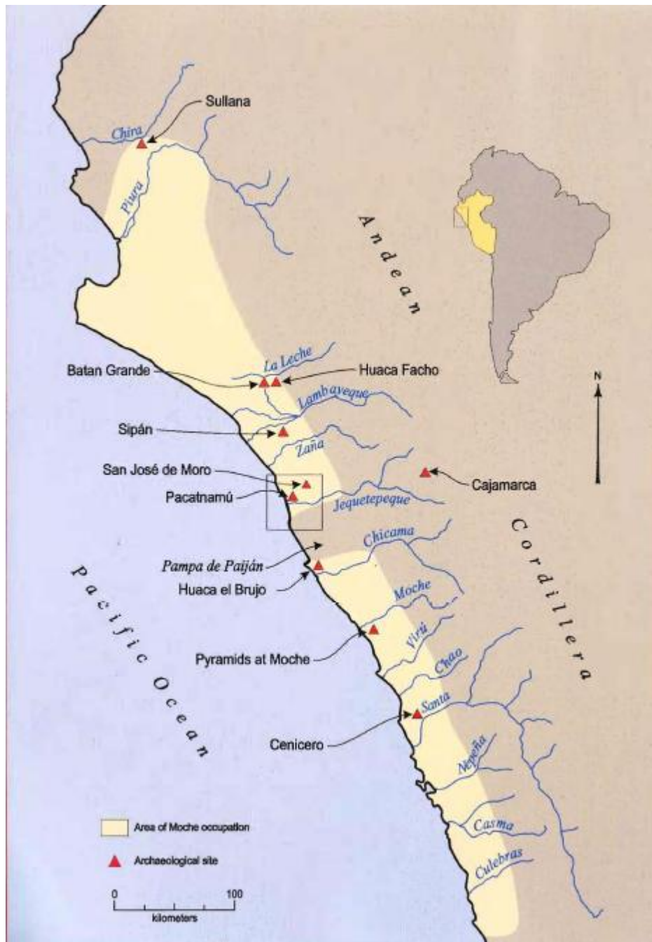
Figure 2: Map of Moche influence in Peru and Major Archaeological Sites. (Donnan and McClelland 2007: Figure 1.1)