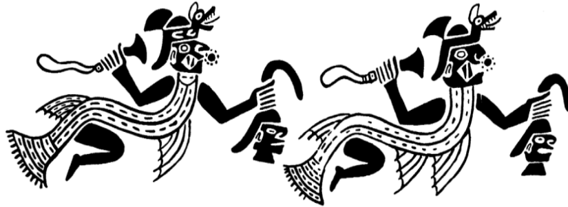
Figure 9: Moche Fish Decapitators. (Cordy-Collins 1992: Figure 12).

These fineline fish have more detail than is usually seen in the Nasca depictions. Numerous dots, lines, and zigzags were used to give the fish emotion and movement.