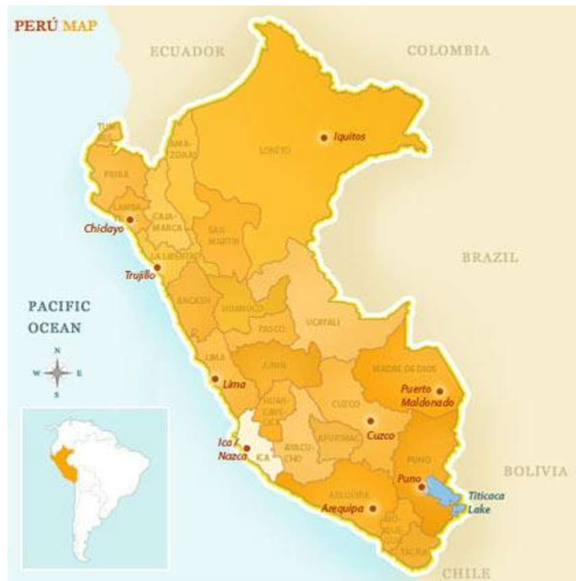
Figure 1: Map showing the location of the Ica and Nasca Valleys in Peru. (Peru Travel 2011).

and the nearby Ica Valley (See Figure 1), the civilization thrived from approximately 200 B.C. until A.D. 600 (Proulx and Silverman 2002:1). While early explorers found little interest in Nasca sites because of their lack of monumental architecture compared to that of other societies such as the Tiwanaku or Moche, Max Uhle's interest in Peruvian pottery and later activities on the southern coast allowed for the spread of knowledge of the Nasca civilization (Proulx and Silverman 2002:3). Since then, expeditions led by well-known archaeologists such as Julio Tello and Alfred Kroeber have uncovered numerous secrets once lost in time