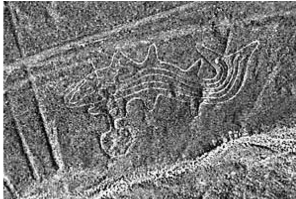
Figure 4. The Nasca Killer Whale. (Nasca Geoglyphs 2011).

The Nasca Killer Whale geoglyph located near the Ingenio Valley (Figure 4 and 5), is the largest representation of the Killer Whale motif from the Nasca society that is included in this study. This motif possesses two dorsal and ventral fins in addition to its tail. Although there is not much detail in this motif, as it was made from a series of lines drawn in the sand, a trophy head shape is still identifiable. This motif, like many other Killer Whale motifs, possesses the “S” shape in its body that depicts movement through water.