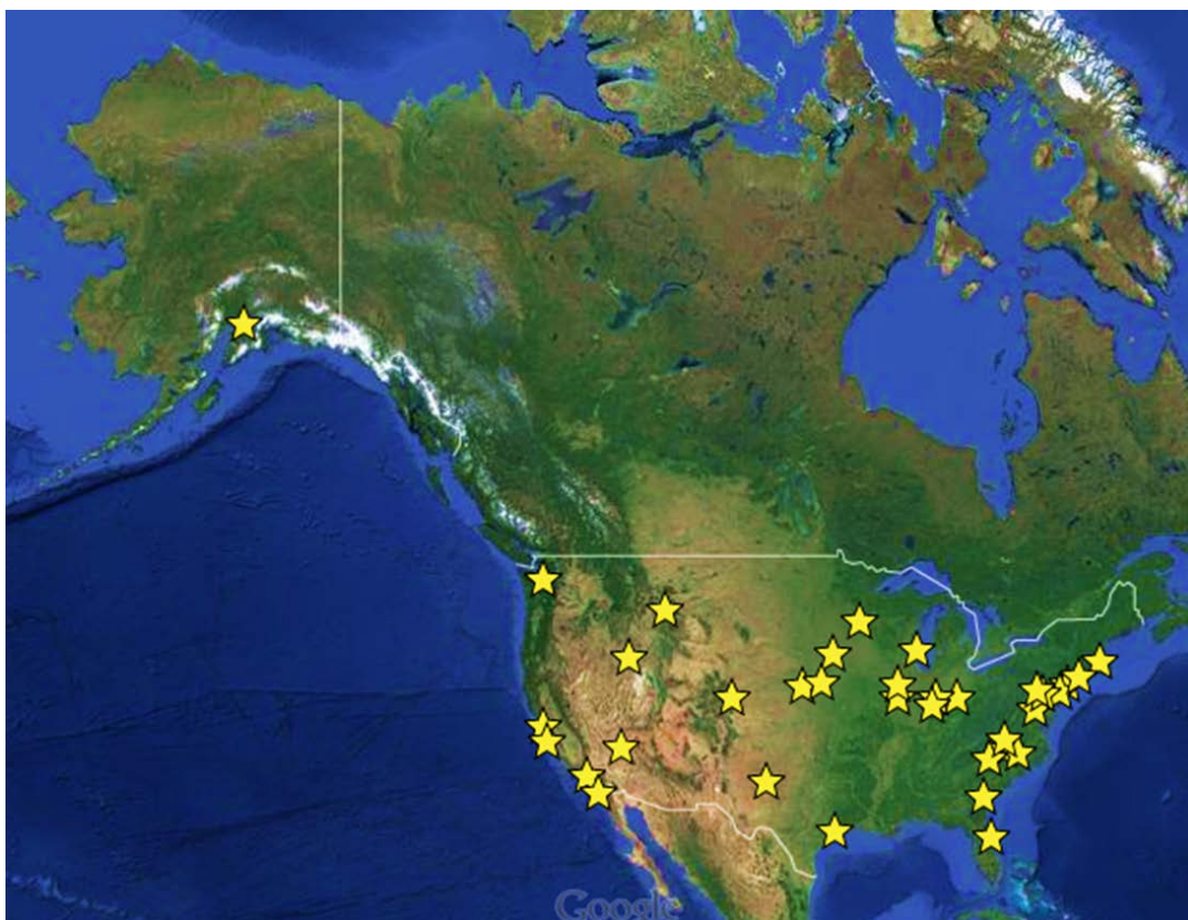
Figure 2: Map of museums with reported antievolution activities.

Most notable for this project are the responses to the fourth question: “Have you personally ever experienced any antievolution comments or objections by visitors at the museum?” Of the 169 participants in this survey, 111 individuals answered this question. 52 individuals (46.8%) responded affirmatively that they had experienced antievolution activities in their museum, while the remaining 59 (53.2%) had not had personal experiences. Figure 2 is a map of all of the geographical locations of museums which reported affirmative responses with respect to antievolution activities in their museums.