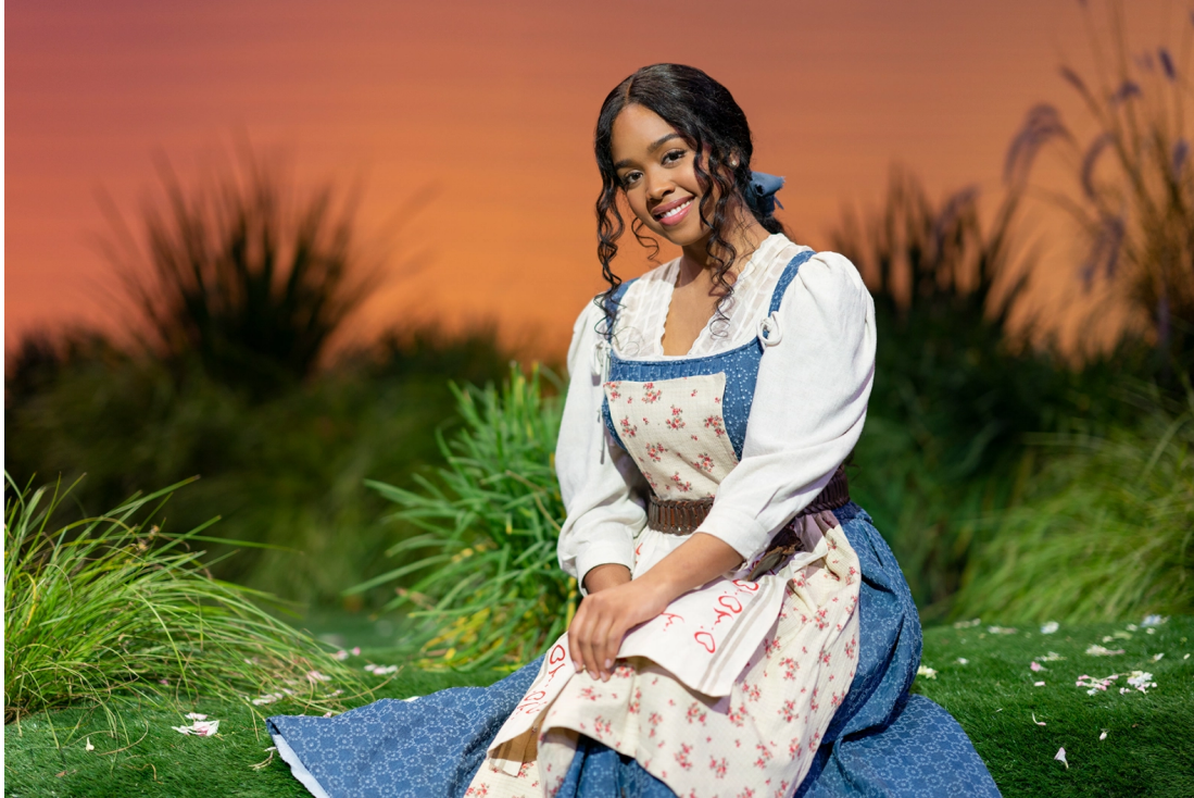
Figure 2. H.E.R. performing in Beauty and the Beast: A 30th Celebration (2022).

Until recently ( \pm five years), American popular genres have not considered the works of Filipinx Americans (let alone Asian Americans) as being part of the mainstream. However, these communities have produced artists active in popular genres as early as the late-nineteenth century. While there are now Filipinx Americans or racially mixed Filipinx Americans within mainstream popular musical genres, they either have not been forthcoming about their identity or do not have a strong association with their heritage. 4 There are a few exceptions to this, but these individuals are treated as tokens or exceptions within the industry. In other words, the industry did not encourage other artists of a similar ethnic background and talent to pursue the industry in the same way as those already successful in it.