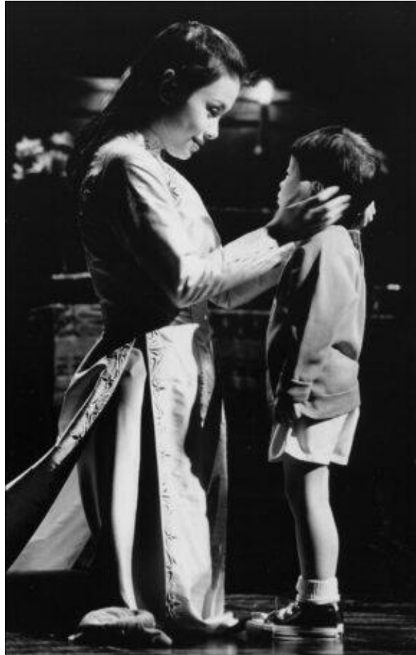
Figure 4. Miss Saigon, Lea Salonga as Kim (1991).

Kim decides that Tam needs to have a better life in America with his father, and if she could not be a part of that, then she would sacrifice herself to make that happen, thus fulfilling her ultimate sacrifice to her son with her self-inflicted death.