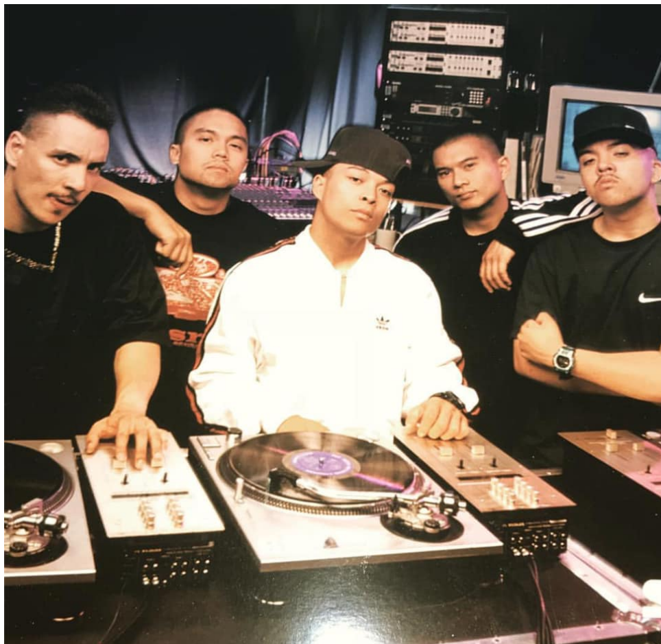
Figure 12. Invisbl Skratch Piklz (ca. 2000).

When Filipinx Americans began MCing as a way to express their post-colonial consciousness, they developed conversations that expressed different aspects of their frustrations with the socio-political issues associated with their community, their multi-colonial history, and the hybridity of being Filipinx and American. Some topics that Filipinx American MCs interact with through their rapping express these frustrations. These include the special relationship between the US and the Philippines and its impact on Filipinx being recruited to the military (mainly the Naval branch); the intergenerational trauma stemming from a multi-colonial history; the status of being an immigrant family with a working-class background; the stereotypical and racist attributes associated with their skin color; and so on.