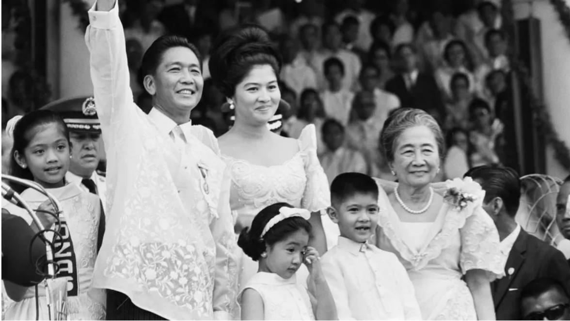
Figure 10. Marcos Family (1965).

For Clamor, who grew up during the martial law era, this song is a reminder of all the misfortunes that occurred under the Marcos regime. The “constitutional authoritarianism” of Marcos’s martial law shifted from formal mass arrests to extrajudicial killings within the first five years. All forms of pro-democracy efforts were suppressed, and police and military brutality reigned during this period. 116 Even the US government, which initially supported Marcos’s first presidential campaign, stopped supporting him in an effort to protect their military bases. 117 However, Clamor’s rendition of this song attempts to provide a positive meaning and association that pays tribute to the time period when this kundiman was written.