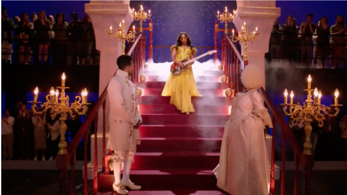
Figure 1. H.E.R. performing in Beauty and the Beast: A 30th Celebration (2022).

opening scene, H.E.R. is seen wearing a blue dress with a white apron. On that apron as a decorative border is the Baybayin script for “Belle,” which she asked the costume designer if she could have included. 2