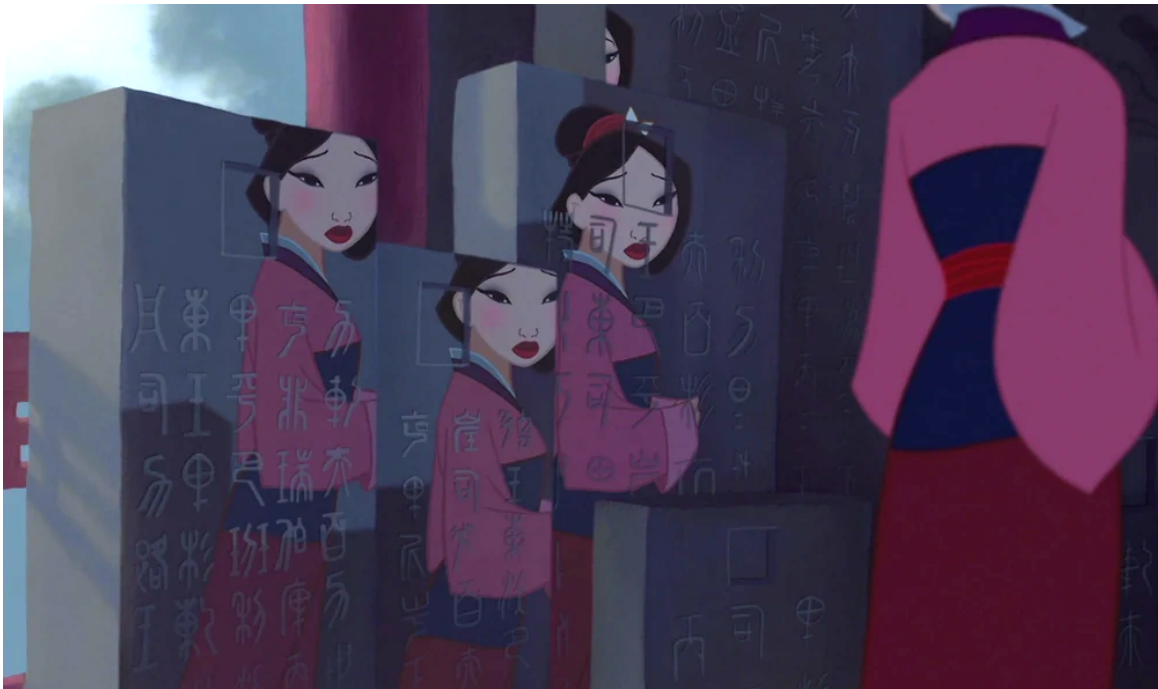
Figure 5. Disney's Mulan (1998). © Walt Disney Studios.

goes out into war to fight the Huns. Later on in the movie, she reveals that she is a woman, continues to fight against the Huns, saves China, and is honored by the Emperor and her family for her courageous efforts. This Americanized version of Mulan changes the title character's motivation to be more focused on her own happiness rather than on fighting for the approval of her parents. This Mulan is a self-regarded heroine that seeks to be truly recognized and distinguished for herself rather than through a man. 80 This is explained through her song, "Reflection," after she had failed to make a good impression with the village's matchmaker.