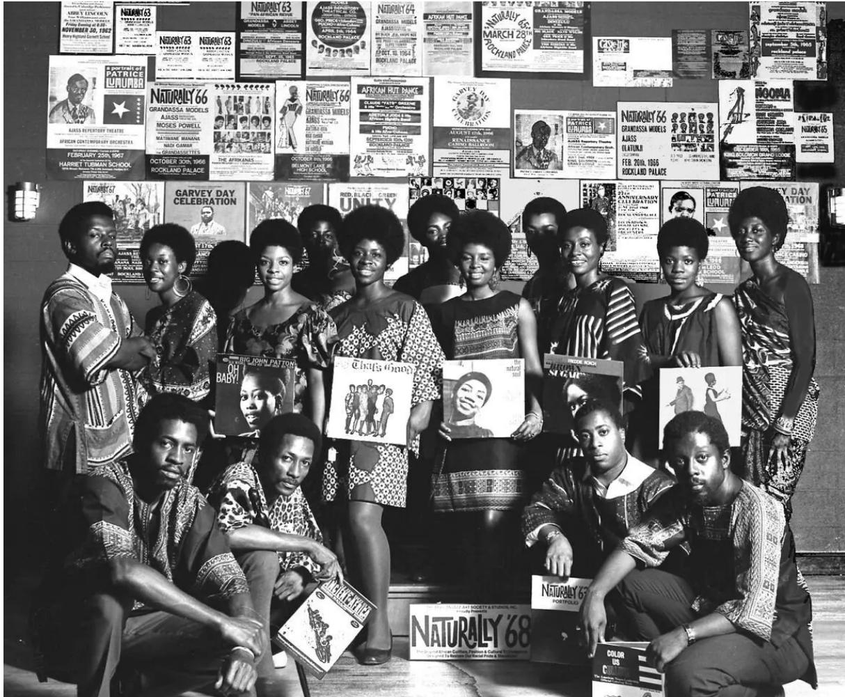
Figure 7. Models from the Grandassa Models agency, part of the “Black Power!” exhibition at the Schomburg Center for Research in Black Culture (1968). © Kwame Brathwaite.

The Black Arts movement had a strong influence on the Asian American community and its musicians; this was especially seen when Asian American jazz musicians started interacting with the free jazz movement. 90 Coincidentally, African American artists also looked to Asian culture and instruments for inspiration in their work. 91 Asian Americans were inspired by what they learned and saw from the political viewpoint and performative practices of the African American community. This inspiration would produce several musician-composers to make a