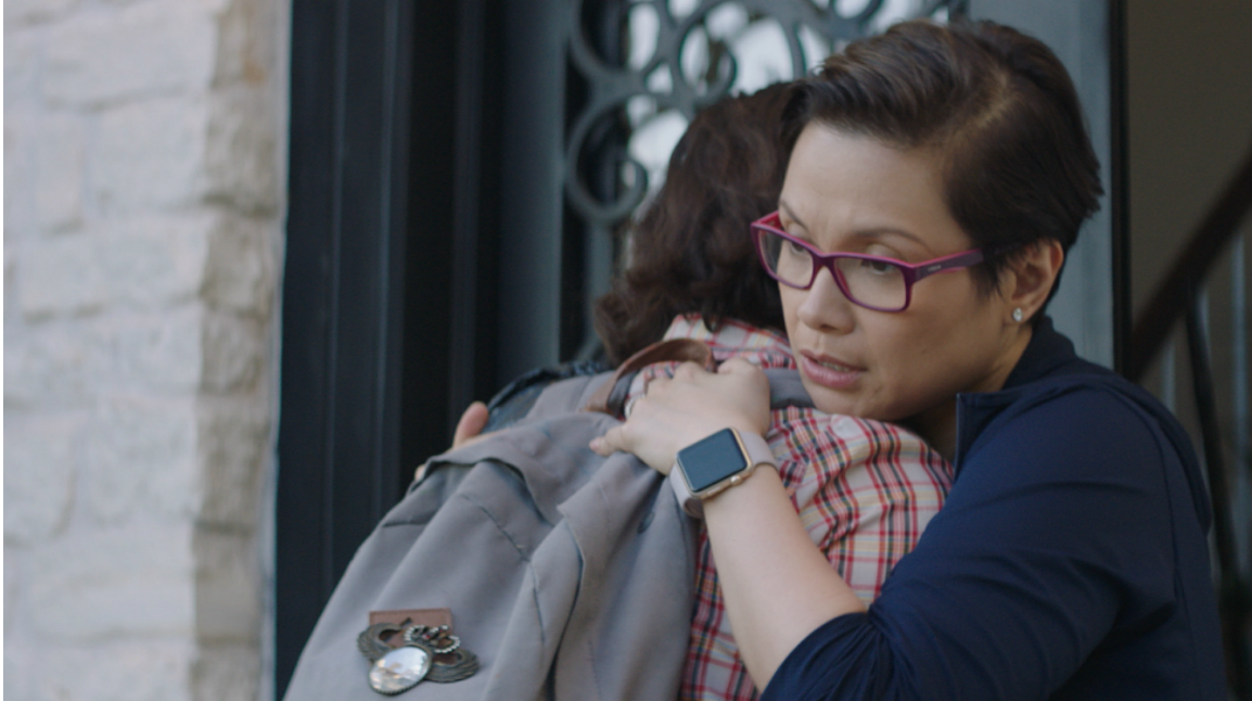
Figure 6. Yellow Rose (2019). © August Thurmer.

Even with such a fantastic and talented cast of Asian actors and actresses, Hollywood did not do much to increase Asian representation on the screen for another two decades until Crazy Rich Asians (2018) was released. The 1990s and 2000s were a time in which people of color were tokenized. 82 Tokenism is the symbolic practice that recruits a small group of people from underrepresented backgrounds in order to appear that there is racial or gender equality within an institution. 83 Studios in Hollywood argued that once there was a movie that showed some kind of representation, there was no need to feature Asian characters/stories anymore. However, once Crazy Rich Asians came out, other films and television shows with Asian leads began to appear. This increased the diversity of Asian stories that could be told. Asian American activists began to push to showcase stories of their communities rather than portraying only those of the “crazy” and “rich.” 84 This resulted in Lea Salonga joining the cast of Yellow Rose (2019), the story of an