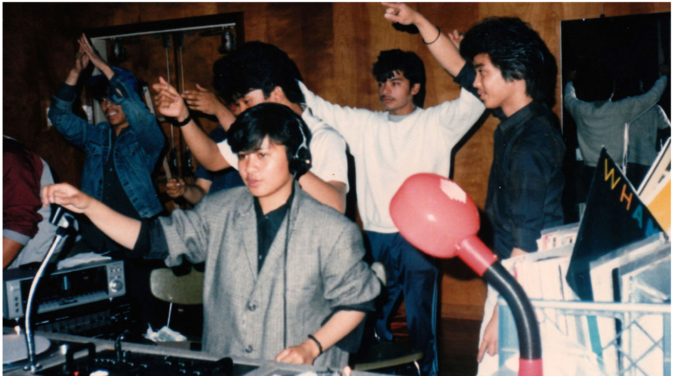
Figure 11. Filipinx Bay Area DJ scene (ca. 1980s).

at the time, and they were widely known as the Filipino American mobile disc jockey scene . Though mobile DJing on the West Coast was better associated with the Filipinx American community, it was not exclusive to them. According to Oliver Wang, there were other communities of color that participated in mobile crews, such as Latinx Americans, African Americans, and Chinese Americans, however, the extensive support of family and community is what propelled Filipino hip-hop to thrive. 134