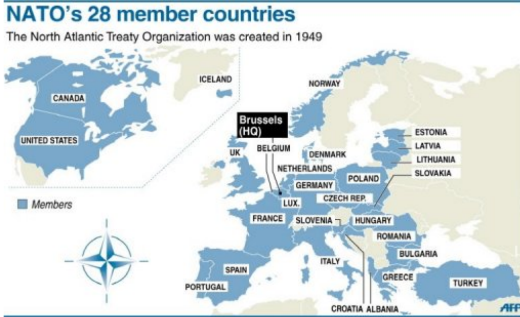
Figure 3. NATO's 28 member countries as of today.