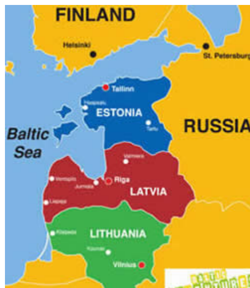
Figure 1. Map of Estonia, Latvia, and Lithuania.

“Our Alliance has made a solemn pledge of protection, and anyone who would choose Lithuania as an enemy has also made an enemy of the United States of America. In the face of aggression, the brave people of Lithuania, Latvia, and Estonia will never again stand alone.” 1 President George W. Bush spoke these words in December of 2002 to a crowd of thankful citizens from Vilnius, Lithuania. It had just been announced that Lithuania, Latvia, and Estonia, along with four other countries, would be invited to join NATO. This brought hope to millions of Baltic residents. The Baltic diaspora in the United States was thankful that all of their work was paying off, that their efforts were bringing security to their former homelands. This had not been an easy road and there had been plenty of roadblocks during the admittance process, including dealing with their former occupiers, the Soviet Union.