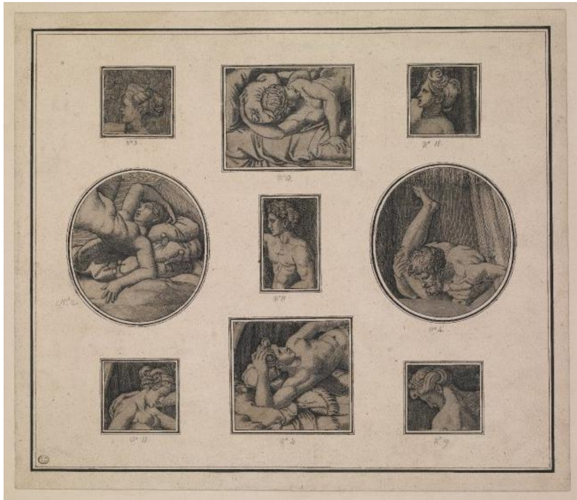
Figure 12. Marcantonio Raimondi, I Modi , Surviving fragments from an early edition of engravings after drawings by Giulio Romano (ca. 1524, London, British Museum).