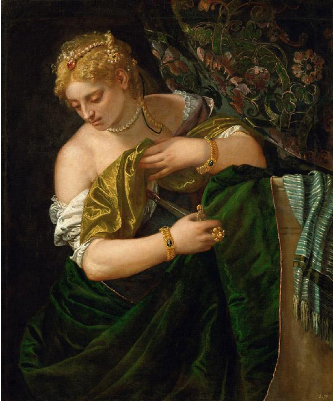
Figure 7. Paolo Veronese, Lucretia (ca. 1580-83, Vienna, Kunsthistorisches Museum).