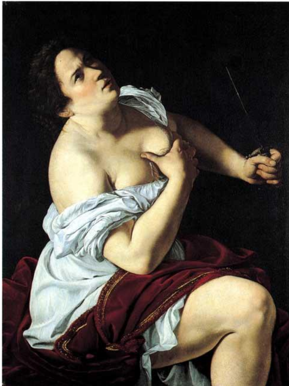
Figure 2. Artemisia Gentileschi, Lucretia (ca. 1621, Genoa, Palazzo Cattaneo-Adorno).