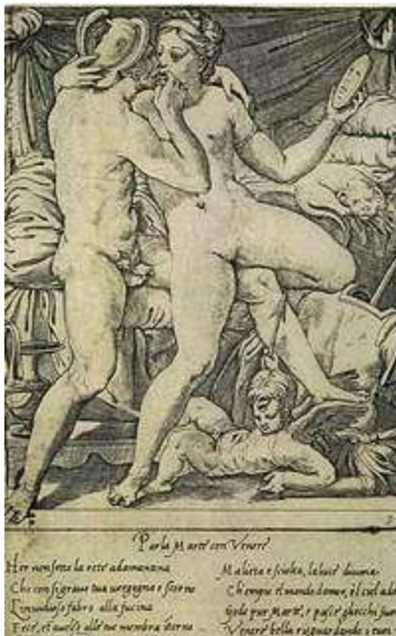
Figure 15. Jacopo Caraglio, Mars and Venus (ca. 1527, Cambridge, The Fitzwilliam Museum).