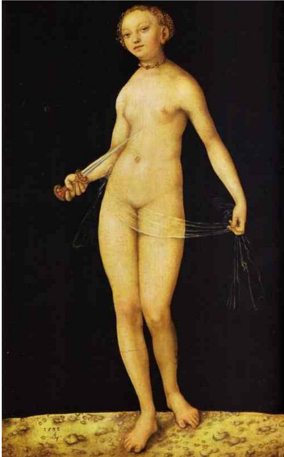
Figure 6. Lucas Cranach the Elder. The Suicide of Lucretia (ca. 1533, Berlin, Staatliche Museen zu Berlin, Gemaldegalerie).