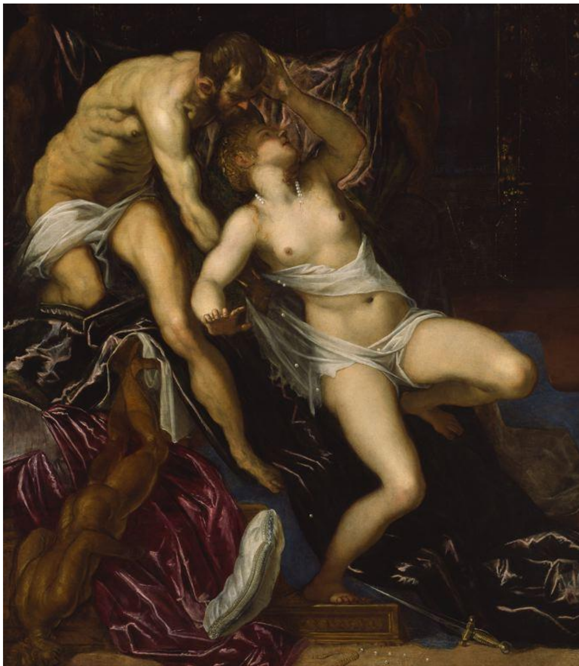
Figure 1. Tintoretto (Jacopo Comin Robusti) Tarquin and Lucretia (ca. 1578-80, Chicago, Art Institute of Chicago).