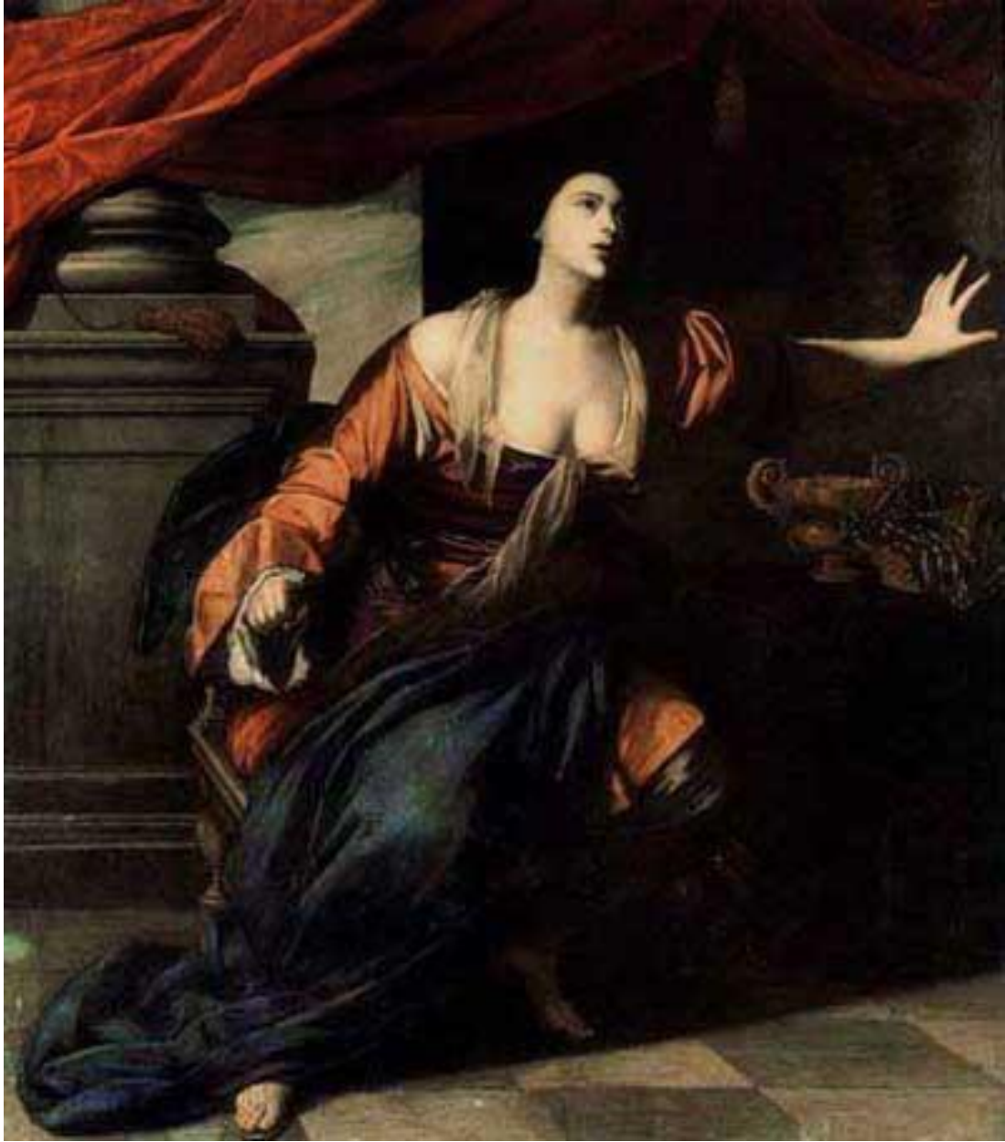
Figure 17. Artemisia Gentileschi, Lucretia (ca. 1642-43, Naples, Museo di Capodimonte).