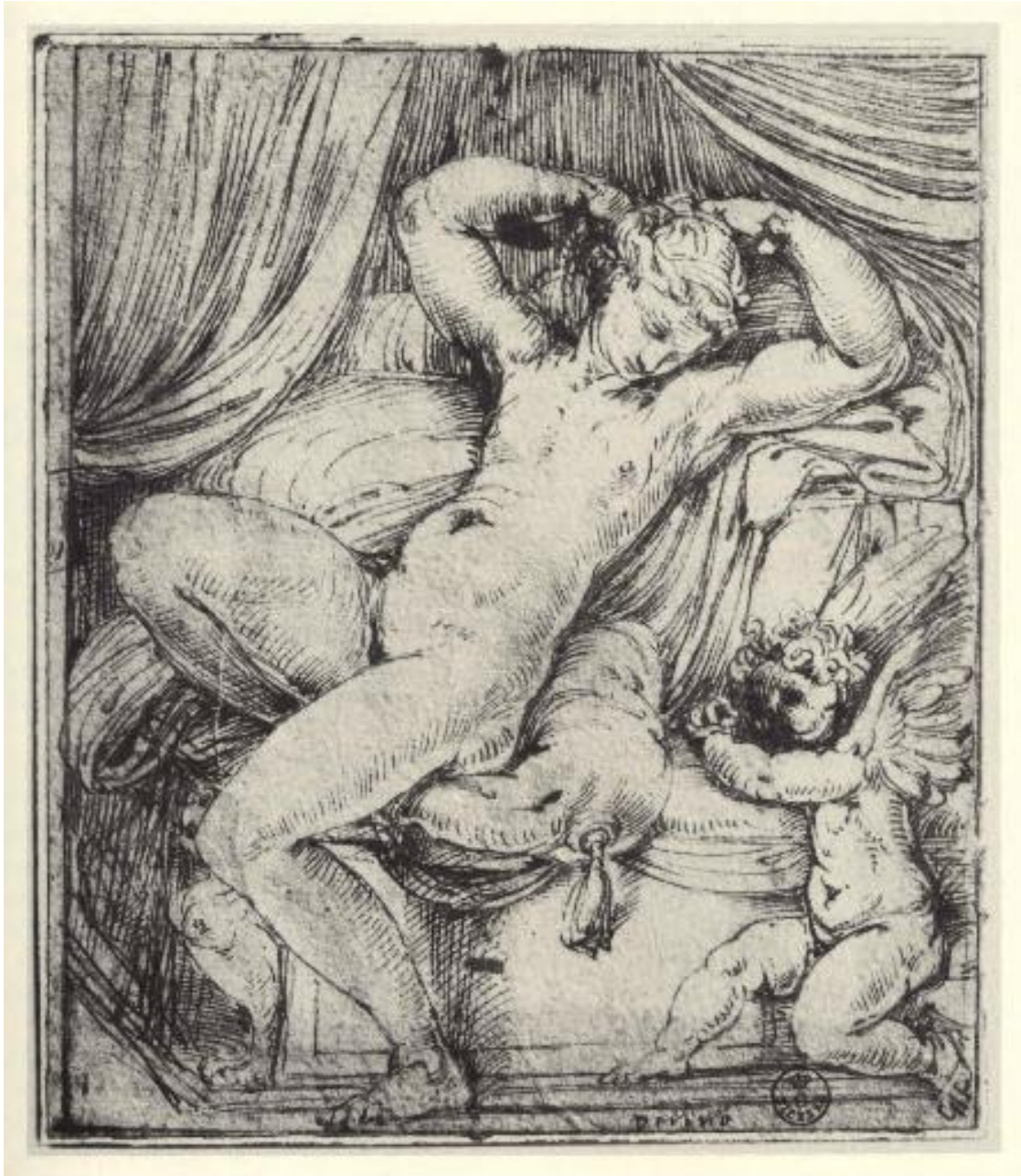
Figure 14. Jacopo Caraglio. Venus and Cupid engraving from the series, The Loves of the Gods after illustrations by Perino del Vaga and Rosso Fiorentino, (ca. 1527, Cambridge, The Fitzwilliam Museum).