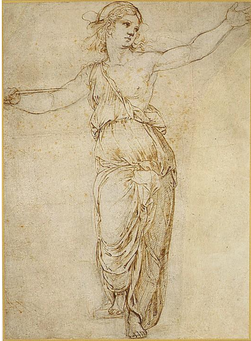
Figure 5. Raphael (Raffaello Sanzio), Lucretia (ca.1583-20, New York, The Metropolitan Museum of Art).