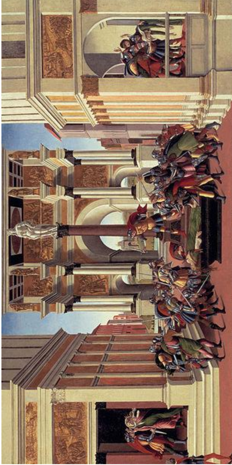
Figure 3. Sandro Botticelli, Tragedy of Lucretia (ca. 1500-01, Boston, Elizabeth Stuart Gardner Museum).