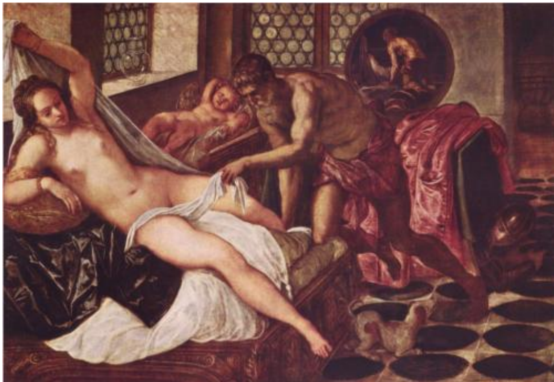
Figure 16. Tintoretto (Jacopo Comin Robusti), Mars and Venus Surprised by Vulcan (ca. 1553, Munich, Alte Pinakothek).