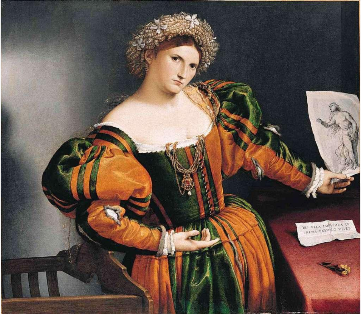
Figure 8. Lorenzo Lotto, Portrait of a Lady as Lucretia (ca. 1534, London, National Gallery).