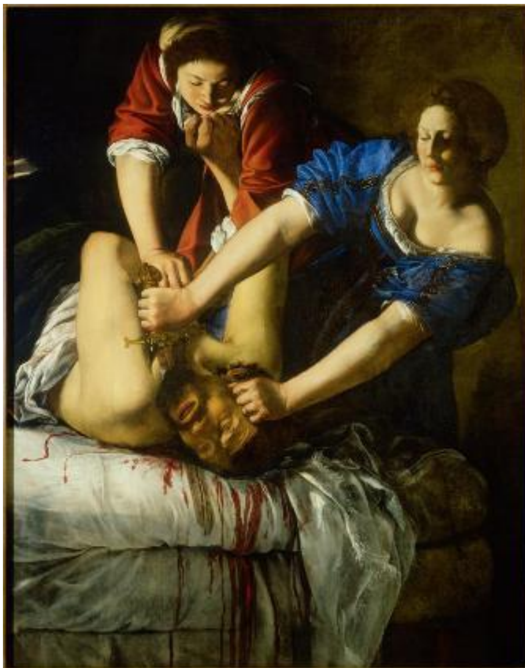
Figure 18. Artemisia Gentileschi, Judith Decapitating Holofernes (ca. 1612-1613, Naples, Museo di Capodimonte).