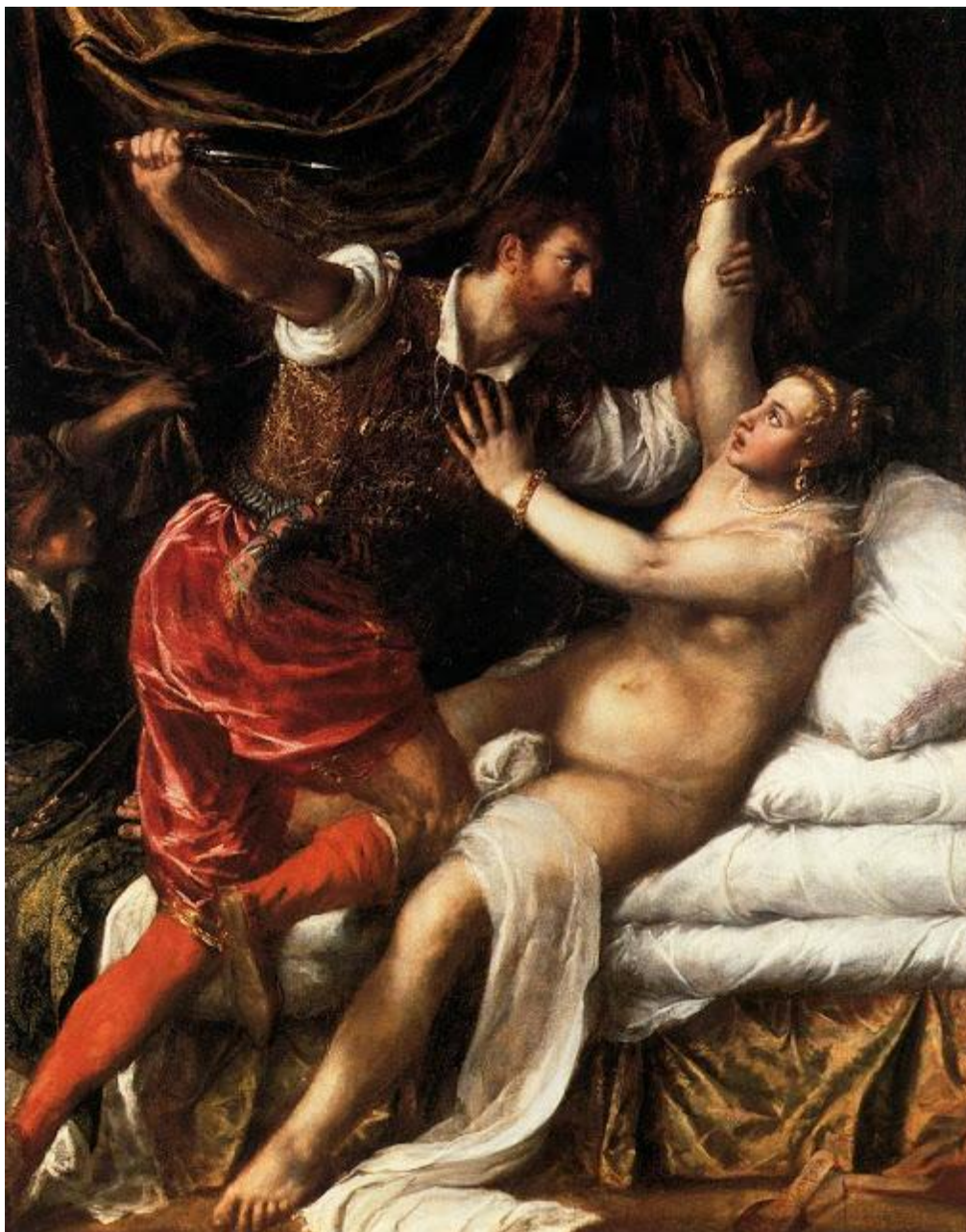
Figure 9. Titian (Tiziano Vecello), Tarquin and Lucretia (ca. 1568-1571, Cambridge, Fitzwilliam Museum).