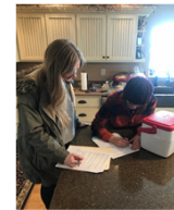
Figure 5: Filling out a questionnaire with a homeowner during a sampling visit.