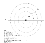
Figure 4: Map on questionnaire used to determine possible sources of contamination with source codes and distances