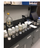
Figure 6: Nitrate testing at ECCCHD via ion selective electrode (ISE)