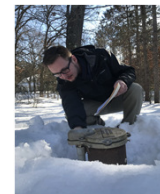
Figure 3: Inspecting a homeowner's well for potential disrepair that could lead to water contamination.