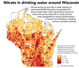
Figure 1: Map of nitrate in drinking water in WI from Private Drinking Water Quality in Rural Wisconsin, Journal of Health, 2013.