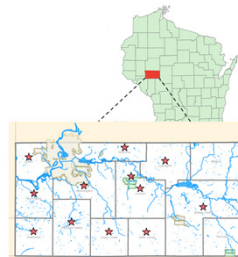
Figure 2: Eau Claire County, WI and selected sampling townships