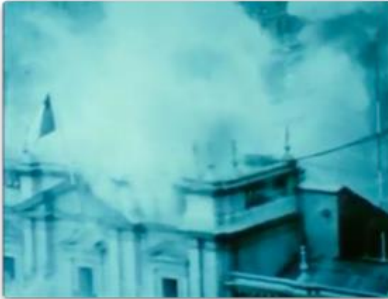
Figure 6: Fighter jet. Bombing of La Moneda Presidential Palace. Chile, la memoria obstinada (1997)

Both films revisit the actual occurrence of fighter jets flying over Santiago although both films are not the originating source of the images, they attempt to recall the moment in history for the spectator through two different methods. The inclusion of this scene in Machuca attempts to create a virtual potential in the mind of the spectator, while in Chile, la memoria obstinada the scene reiterates the moment by using original footage.