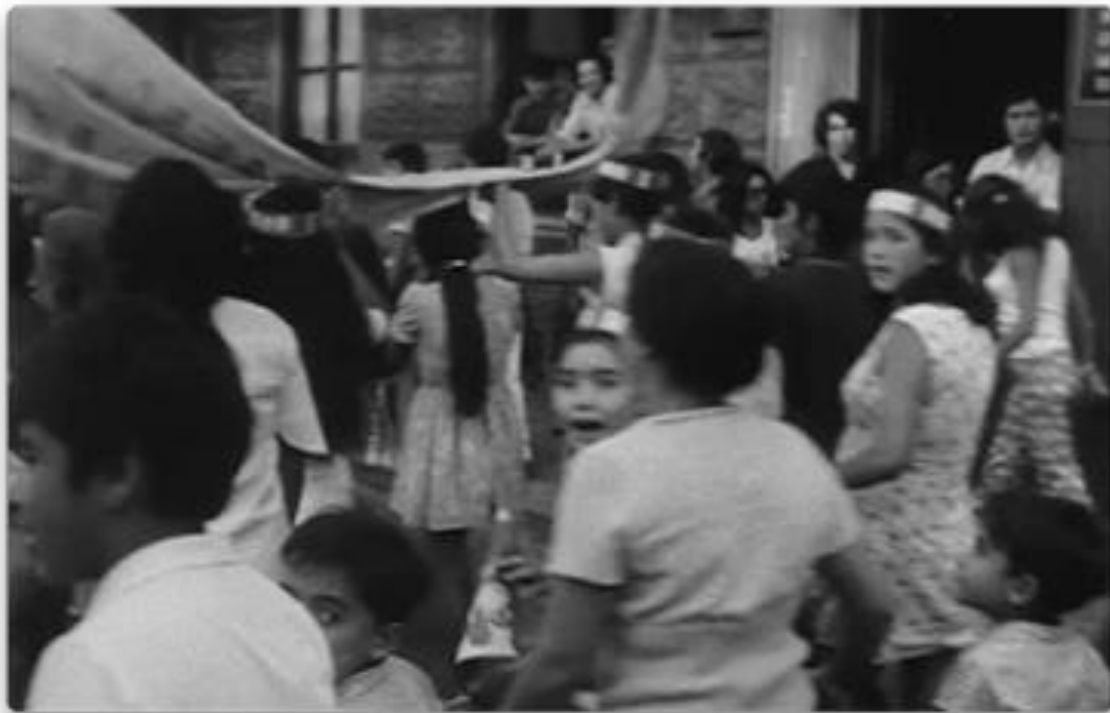
Figure 8. Protestors at the demonstration. La batalla de Chile (1975-1979)

The significant return of the past is the way in which the first demonstration scene is reconstructed on screen for the spectator. Footage from the actual events leading up to the