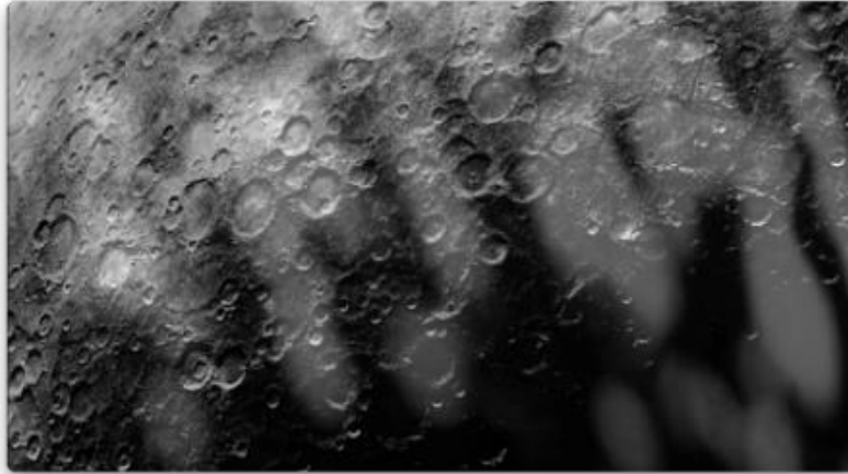
Figure 11: Craters superimposed on shadows like ones created by leaves. Nostalgia de la luz (2012)

body, the women would also like to use a kind of earth telescope to detect the presence of calcium in the sand through telescopic spectrophotometry.