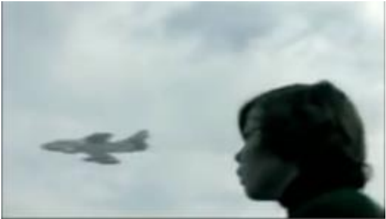
Figure 3: Gonzalo with fighter jet overhead. Machuca (2005)

poor shantytowns for those who opposed the incoming government. Gonzalo safely watches from a distance while Pedro and his family are violently harassed by soldiers and Silvana is shot. Asserting new perspectives that are not typically included in the documentary footage are ways in which the film asks the spectator to reinterpret the moment for the children on screen, and in doing so, for his or herself. Without the historical traces of the images of the jets and La Moneda bombing, the impact would be less than evident in the scene included in Machuca .