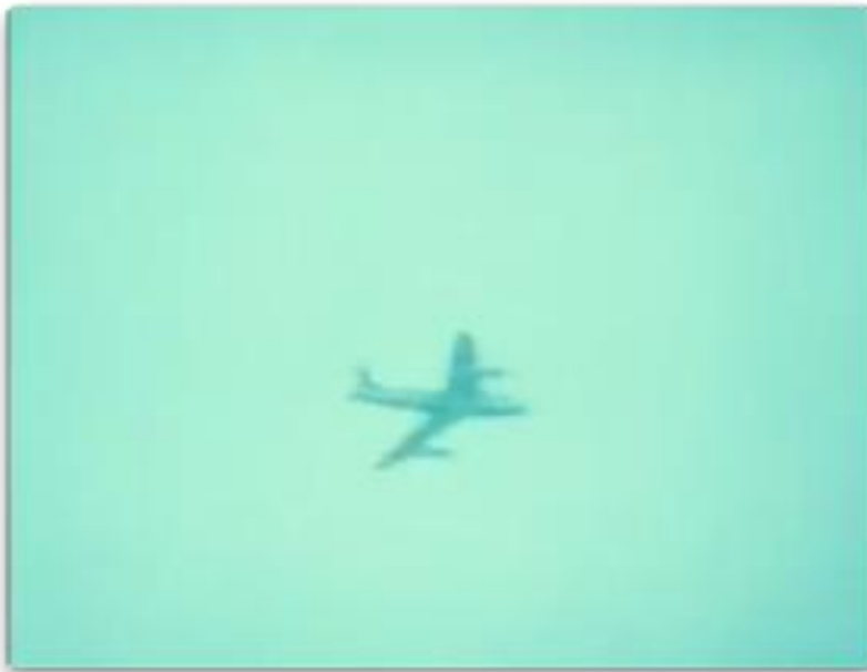
Figure 5: Fighter jet en route to La Moneda Presidential Palace. Chile, la memoria obstinada (1997)