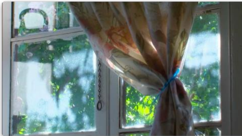
Figure 12: Light pouring through leaves into kitchen. Nostalgia de la luz (2012)

Guzmán's narration links the objects with the filmic wonder on screen as he explains that the telescope recalls a childhood memory and fascination that draws the spectator deeper into his tale and attempts to produce an identification with his affinity for the telescope—and in many ways with the activity of searching and the importance of the telescope as its primary tool in astronomy. The scraping of metal against metal, the locking and shifting of parts and the displacement of air that creates a hissing sound which is transformed into the sound of birds in