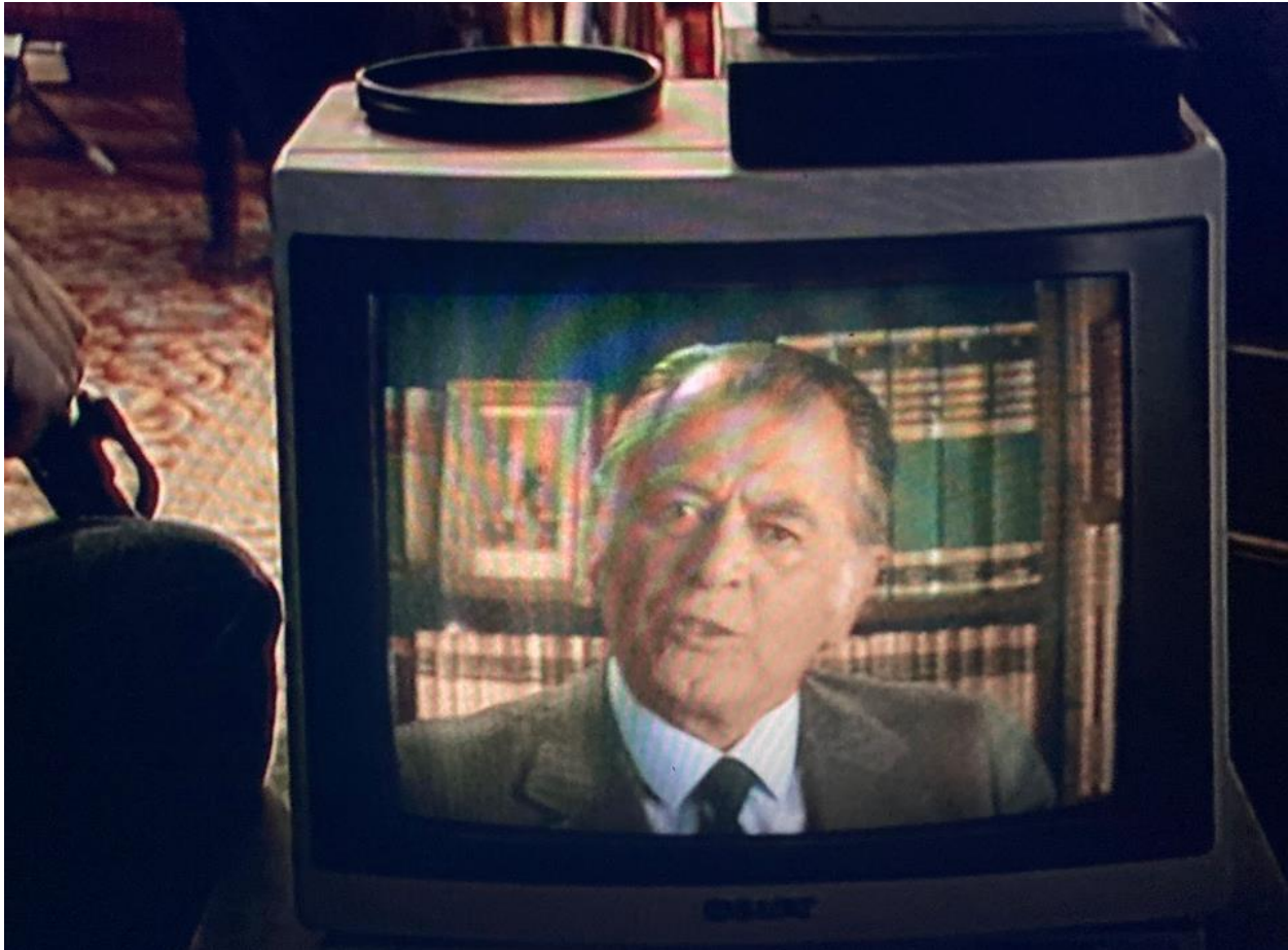
Figure 16: Patricio Aylwin in archival footage included in NO (2013).

Blending archival footage into the film also emphasizes the truths and truth claims present within the film and encourages criticism about the progress visible in current Chile. This blending takes advantage of LaCapra's statement that "[s]omething of the past always remains, if only as a haunting presence or symptomatic revenant" where "the historical past is the scene of losses that may be reactivated, reconfigured, and transformed in the present or future" (49). In the case of NO , empathic unsettlement is brought about through the mixing of past and present as questions of progress and the desired outcomes from the No campaign's victory are put on the stand. In the late 1980s, the No Campaign promised that "la alegría, ya viene/happiness