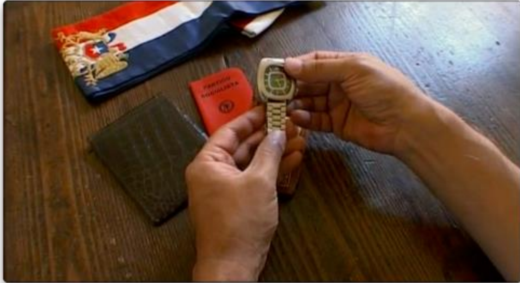
Figure 1: Salvador Allende's belongings. Salvador Allende (2004)