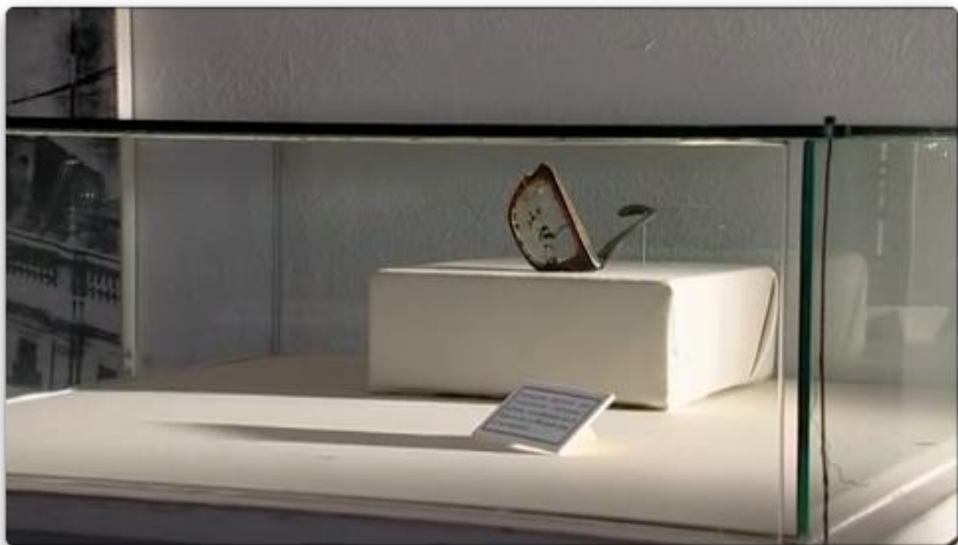
Figure 2: Salvador Allende's eye-glasses. Salvador Allende (2004)

These belongings assert and indicate Allende's violent death. The camera draws nearer to the eye-glasses, as if breaking past the glass barrier of the museum case. The spectator's relationship to the eye-glasses is at once intimate. The details of the fractured lens fill the entire screen and serve to not only depict more vividly the broken pieces but also to ask the spectator