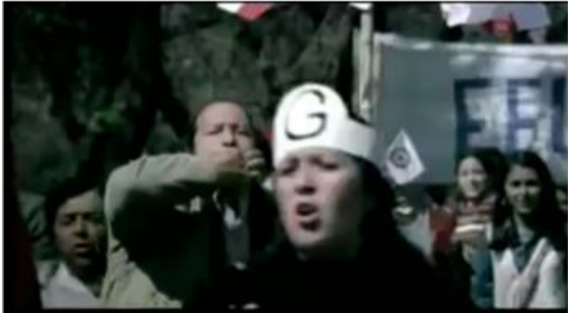
Figure 7: Female protester in during demonstrations in Santiago. Machuca (2005)