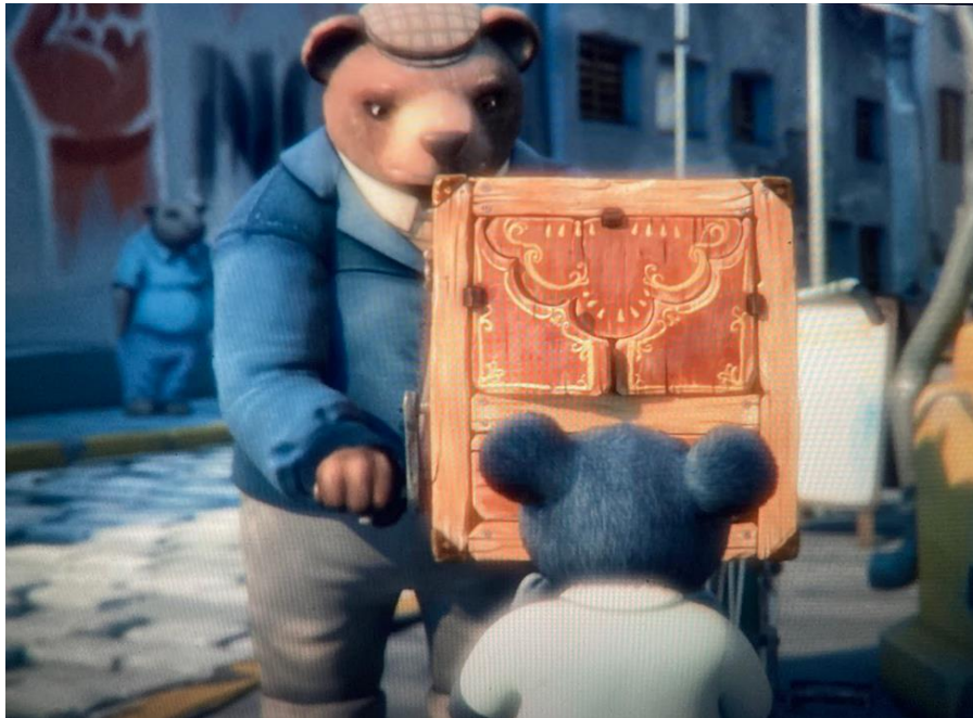
Figure 18: The Bear is on the street ready to show the contents of the diorama. Historia de un oso (2014)

starts ringing his bell in the hope that others will want to come and see the story in the diorama.