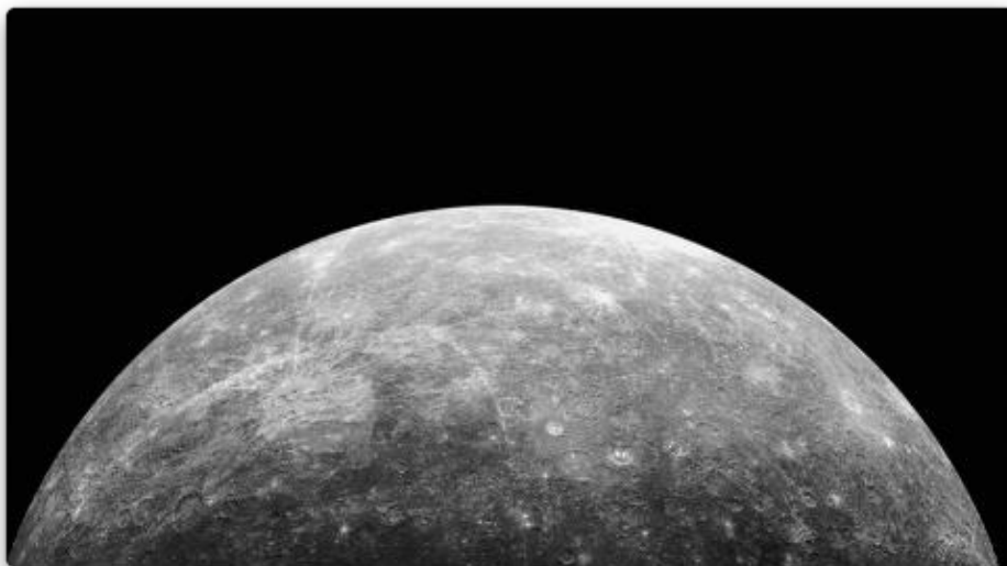
Figure 10: An image of the moon. Nostalgia de la luz (2012)