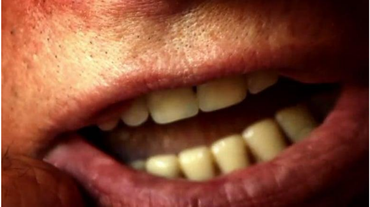
Figure 17: Close up of Otilia Carillo's mouth. La muerte de Pinochet (2015)

The persistence of the past is not only audible in the voices of the testimonies but also visible on the skin, the mouths, in the eyes and generally the bodies of the characters. The film opens with a set of independent images image: of feet in sandals with a piece of green crepe paper, of formal shoes on an ornate rug, of a hand on an arm rest, of lips and another hand on an arm rest but this time next to a radio. The images do not form the totality of a single person but rather gives the spectator a glimpse into different people to whom the appendages belong. The feet in sandals are distinctly female while the formal shoes appear to belong to a male person and so does the first hand on the arm rest. An extreme close up of skin covers the entire screen, followed by an extreme close up of lips. An assumption could be made that these body parts belong to one person, but one doubts their shared body as the context in the shots that follow display differing rooms with possibly different bodies. In the next shot, there is a hand on an arm rest next to a radio. At first it is unclear if this is the same hand as the first one and it is