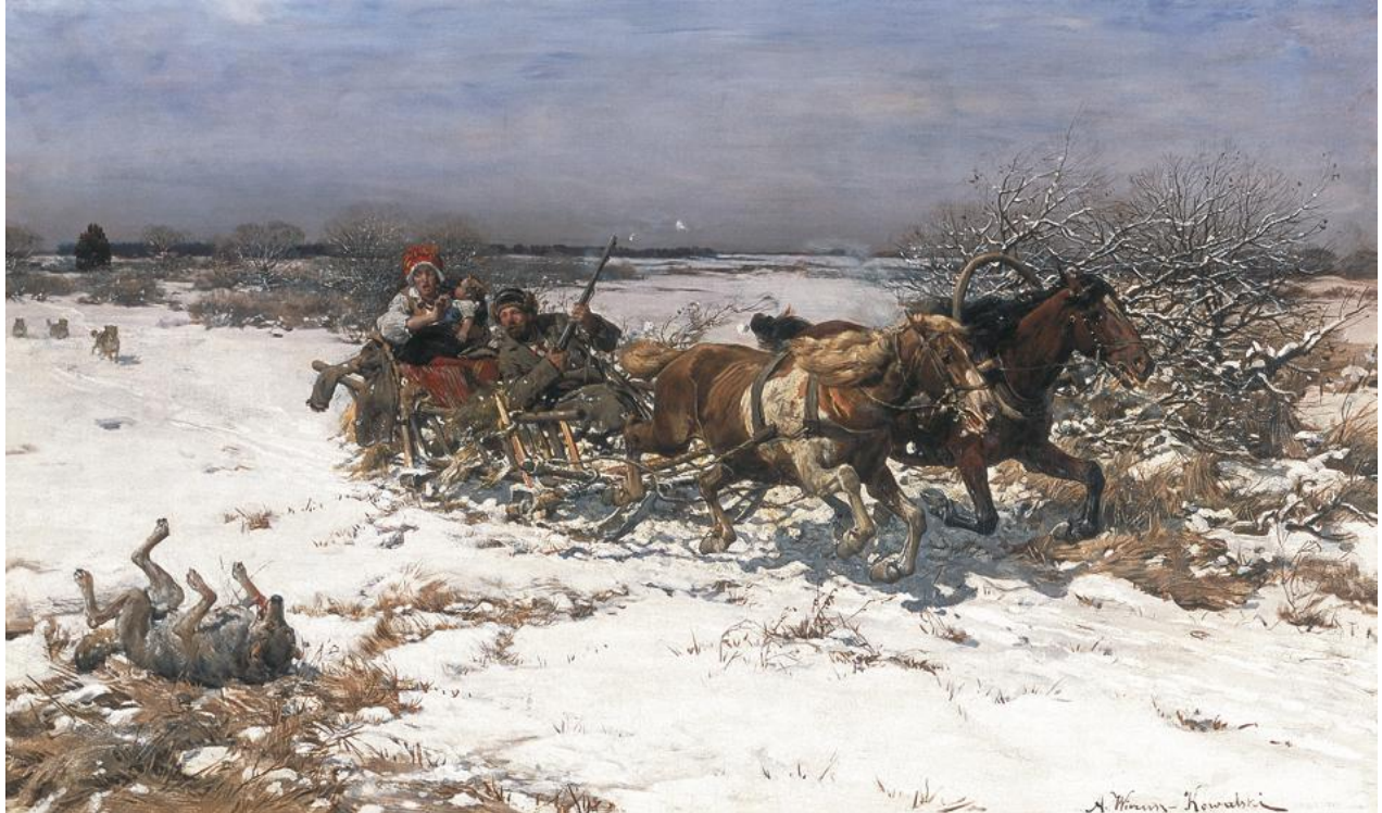
Fig. 2 Alfred Wierusz Kowalski, Attack of Wolves , c. 1885-90, Oil on canvas, 20.1 x 33.5 in., Private collection.

between social classes becomes open to critique (fig. 2). From comparisons such as these, it becomes clear that social class was important to Wierusz-Kowalski.