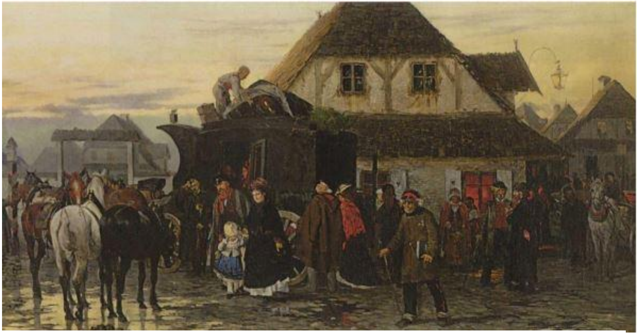
Fig. 8 Alfred Wierusz-Kowalski, Polish Outpost , 1873-74, Oil on canvas, 22.4 x 43.3 in., National Museum, Warsaw.