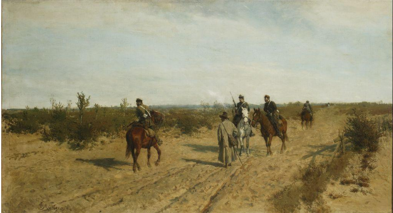
Fig. 7 Maksymilian Gierymski, The Patrol of Polish Insurgents , 1872, Oil on canvas, National Museum in Warsaw.