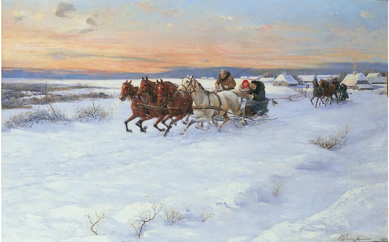
Fig. 6 Alfred Wierusz-Kowalski, Sledge Ride , 1903, Oil on panel, 26.6 x 41.7 in., Private collection.

Munich was the next stop for the young artist. There, in 1873, he was accepted at the Munich Academy of Fine Arts. During this period, his works were characterized by peaceful scenes of sled rides or hunting scenes painted en plein aire , and he studied under well-known Hungarian artist Alexander von Wagner (1838-1919). 20 Wierusz-Kowalski also became familiar with the work of Polish painter Maksymilian Gierymski (1846-1874), a realist painter known for battle scenes and landscapes. Wierusz-Kowalski used Gierymski's The Patrol of Polish Insurgents (1872) as inspiration for his own Polish Outpost (1873-74) (fig. 7, fig. 8). 21 However, he modified Gierymski's approach by unifying his composition with shadows and creating more harmony between the background and foreground. 22 Scholar Eliza Ptaszyńska argues that certain features of Wierusz-Kowalski's works can be attributed to Gierymski, including a freer approach