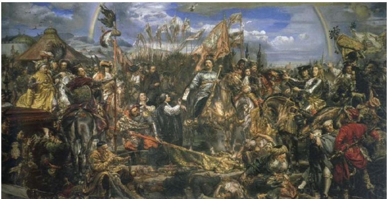
Fig. 10 Jan Matejko, John Sobieski, Vanquisher of the Turks, the Gates of Vienna , c. 1883, Oil on canvas, 180 x 360 in., Sala del Sobieski (Vatican City).