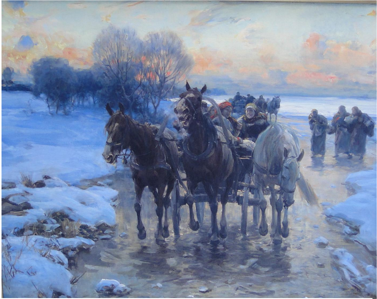
Fig. 4 Alfred Wierusz-Kowalski, Returning Home at Sunset , c. 1900, Oil on canvas, 18.5 x 24 in., Milwaukee County Department of Parks, Recreation, and Culture. EL40.1983.

path used by the caravan is scattered with rocks. A group of leafless trees stands in the distance.