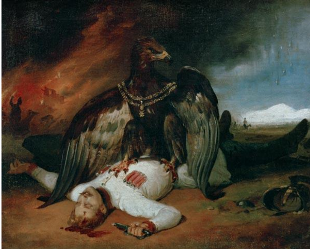
Fig. 1 Horace Vernet, Le Promethee Polonais (The Polish Prometheus) , Oil on canvas, 13.8 x 17.7 in, 1831, Société Historique et Littéraire Polonaise, Paris.

semi-military people with roots in Poland, to upper class school children, or from peasants being attacked by wolves to military men hanging about town, there is always a clear indication of social class. None of Wierusz-Kowalski's known works portray an individual whose class is in question. This iconographic clarity is a consequence of the political situation in Poland, where there was a severe separation between the gentry, nobility, and peasantry. A peaceful image of wealthy schoolgirls in the sun-lit woods might not appear to assert a political message on its own. Yet, when it is placed next to a work by the same artist in which a lower-class family frantically tries to shoot down wolves that are attacking their sled, the drastic differences