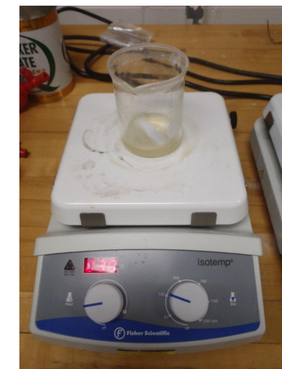
Manually encapsulate AITC in TA \beta CD (left) Encapsulating AITC in TA \beta CD by stirring (right)