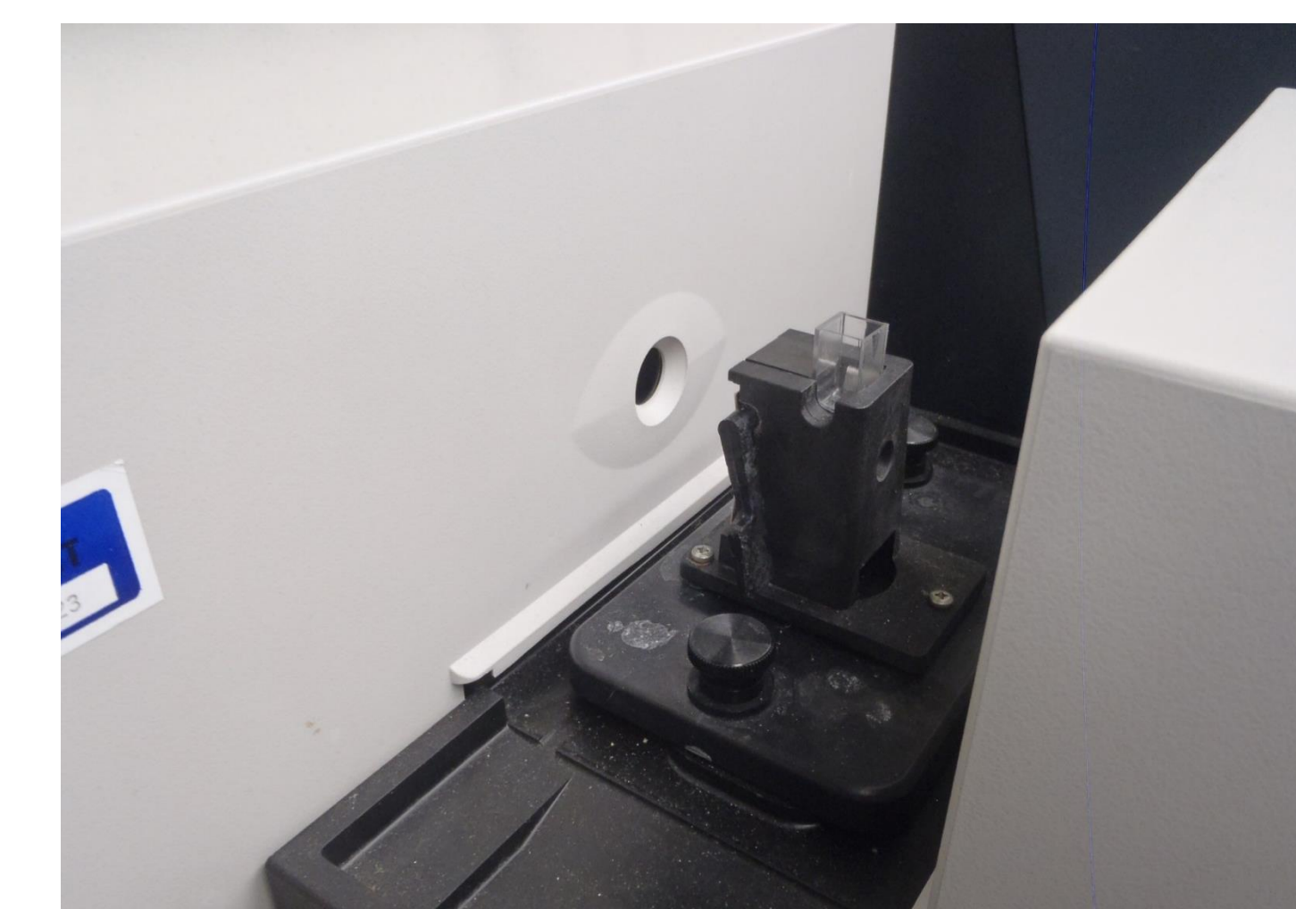
Sonicated samples (left) Testing a sample in the UV spectrometer (right)