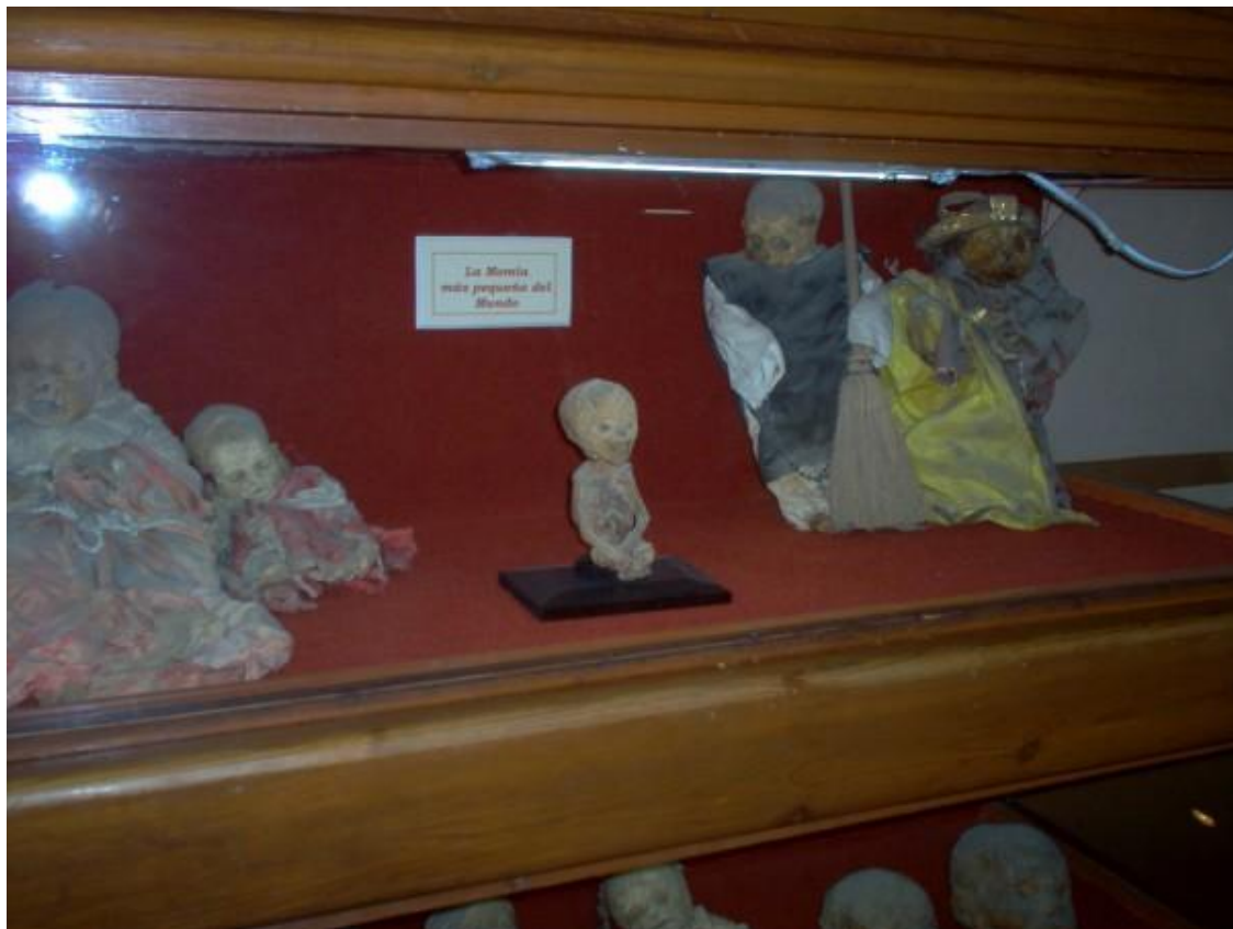
(Figure 1.1: “Angelitos, Santitos, and Smallest Mummy in the World” as seen in 2005 Museo de las Momias de Guanajuato, taken by Amanda Balistreri)

television shows like The Mummy Road Show , a National Geographic Channel documentary series (2001).