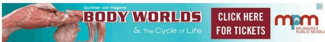
(Figure 4.6: BODY WORLDS Online Advertisement Showing Cropped Image-2014)

At the Milwaukee Public Museum, seeing human remains in an exhibit hall is part of the overall experience rather than the main attraction; this is reflected in the images used in marketing materials. In contrast, all the marketing strategies that I have seen for the Museo de las Momias de Guanajuato and BODY WORLDS & the Cycle of Life contain at least one image of a specimen, or specimens, from their collection. They choose images that people can easily recognize such as a mummy wearing a suit, in the case of the former, or a human plastinate riding a horse, in the case of the latter. An interesting point to mention in regards to the images is the removal of genitalia or the presence of breasts from images that will be used as advertisements. During BODY WORLDS & the Cycle of Life , some of the images were simply cropped in a way that would exclude these parts of the body as seen in Figure 4.6.