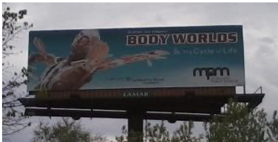
(Figure 4.5: BODY WORLDS & the Cycle of Life Billboard- 2014)

hold special events and programs. These techniques are not only used to promote the existence of a particular collection or exhibition, but also help draw attention to the institution and drive attendance. Billboards focus on creating memorable visual cues and taglines that catch the attention of passersby. Their large size and strategic placement along busy roads makes them difficult to ignore.