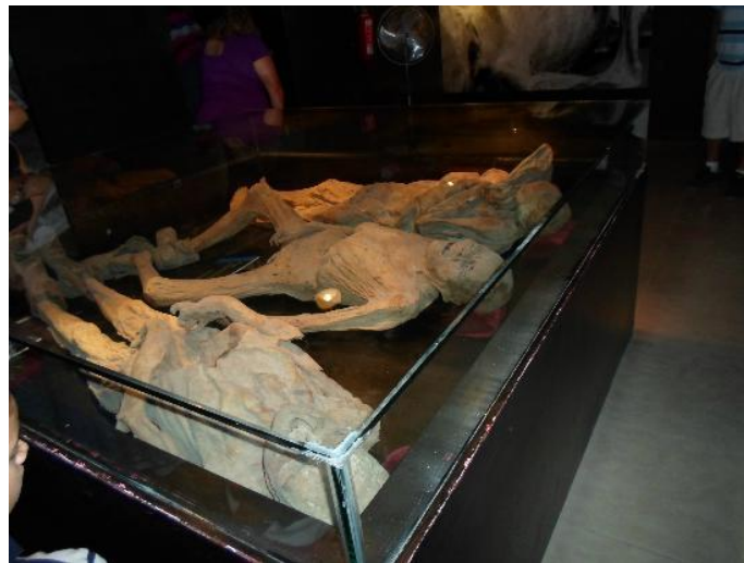
(Figure 4.3: Walk around cases Museo de las Momias)

renovation is that visitors are now able to view some of the mummies from at least two different sides of the case. There is a light on the ceiling of each case that shines directly onto the mummy. Likewise, when there are multiple mummies sharing a single case or set of cases, each has a light that illuminates it. Because the actual museum is located within the side of hill, there is little to no natural light that enters the space, so all of the light within the exhibition halls is artificial.