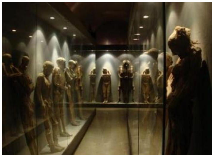
(Figure 4.1: Standing Mummies Museo de las Momias, TripAdvisor LLC)

other about two or three cases high and two wide. While walking through the different rooms, I recall feeling both awestruck and wary. It was the first time I encountered preserved human remains in such close proximity. The infant mummies, or “angelitos,” were also displayed in horizontal glass boxes each containing at least five individuals. Some cases also displayed disembodied parts. Most of the infants were posed upright and leaning on each other with a few lying horizontally. The sole individual within this area to have a constructed mount to support it was “La Momia más pequeña del Mundo,” the smallest mummy in the world. Accordingly, it was also the only individual to have an associated label (see Figure 1.1). Other areas utilized glass cases, like those described above, to contain standing mummies (Figure 4.1). As the primary method currently used at the Museum, many of these mummies seem to loom over visitors as the walk by, making for a particularly emotive experience.