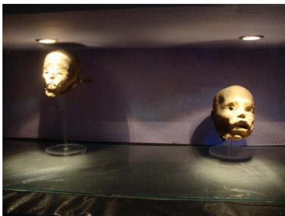
(Figure 4.2: Infant Mummies Museo de las Momias, TripAdvisor LLC)

The majority of adult individuals in the exhibit are displayed standing upright and appear to be leaning on the wall behind them. It is difficult to see the mounts used to support each of the mummies, or if there are any, giving the impression that they are standing on their own accord. Other individuals are displayed lying horizontally in cases only a few feet off the ground, making it possible for people to stand over them. Many of the disembodied heads within the collection are presented on a pillow or using a mount that appears to be inserted into the foramen magnum (Figure 4.2); this is true of both adult and infant mummies.