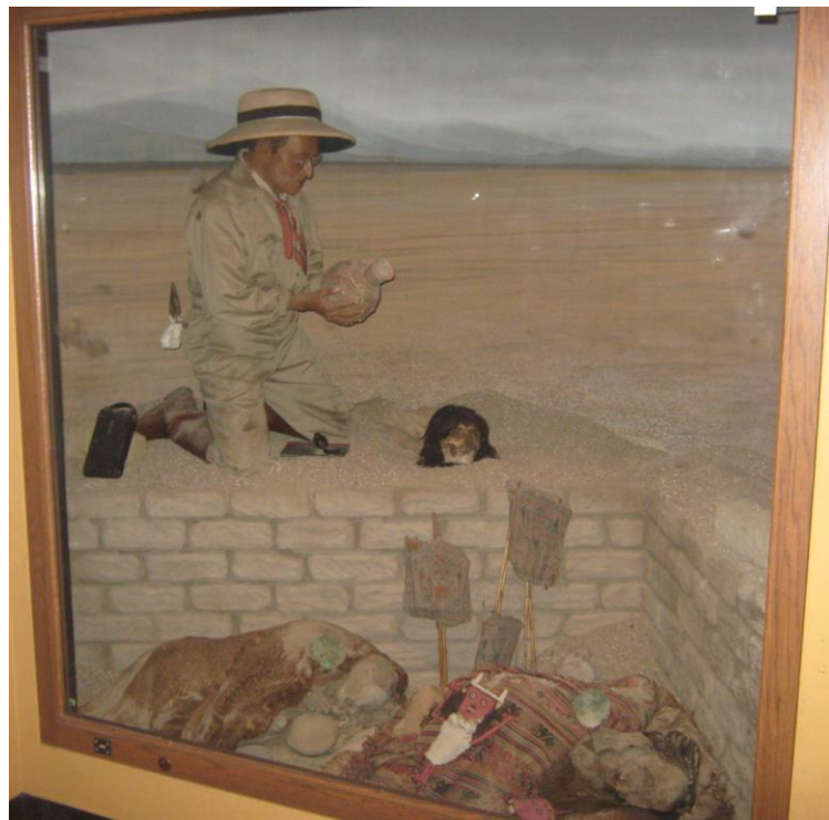
(Figure 4.4: Peruvian Grave- Milwaukee Public Museum,)

with a figure of the Peruvian archaeologist Dr. Julio Tello kneeling over it while holding a ceramic vessel. The mummies are wrapped in blankets and are surrounded by ceramic and metal artifacts to recreate a grave similar to one that archaeologists might find in the field. In addition to the two complete mummies, there is also a disembodied head placed near the knees of the working Dr. Tello. The sole label within the exhibit briefly explains the adobe-brick lined gravesite, that the mummies on display were naturally preserved, and introduces Dr. Julio C. Tello.