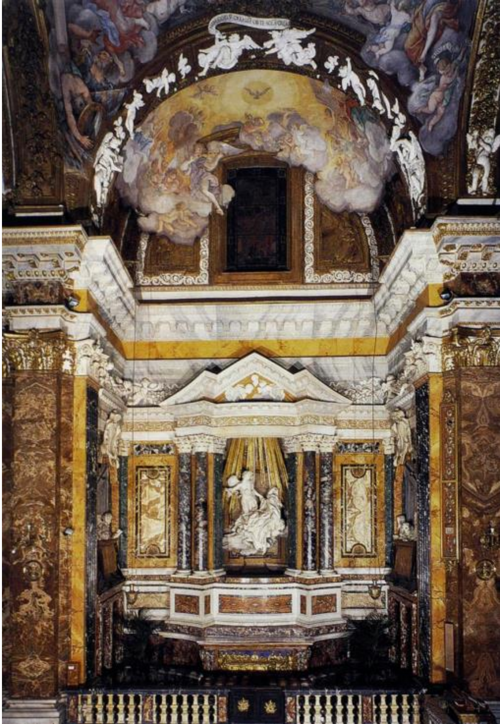
Fig. 2 The Cornaro Chapel Gian Lorenzo Bernini 1652