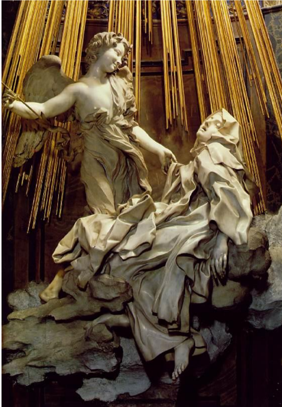
Fig. 1 The Ecstasy of Saint Teresa Gian Lorenzo Bernini 1645-165