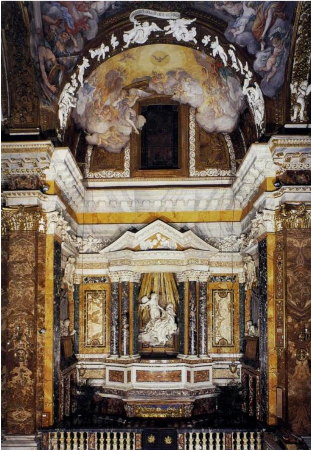
The Cornaro Chapel Gian Lorenzo Bernini 1652