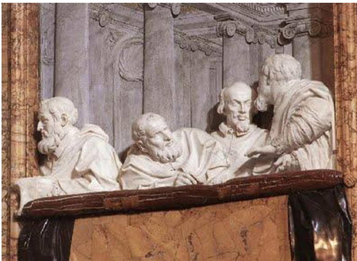
Fig. 15 Right Side of Cornaro Chapel Gian Lorenzo Bernini 1645-1652