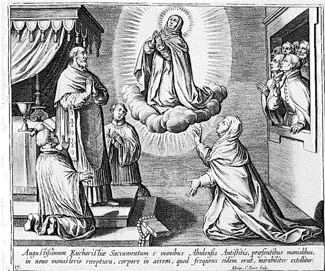
Fig. 17, Levitations of St. Teresa Adriaen Collaert and Cornelis Galle 1613