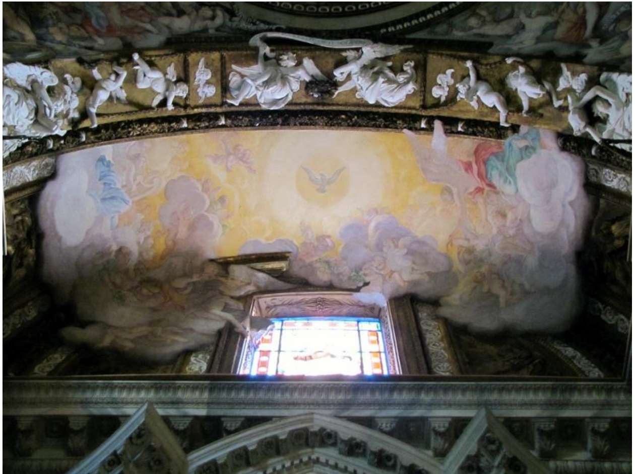
Fig. 11 Ceiling of Cornaro Chapel Gian Lorenzo Bernini 1645-1652