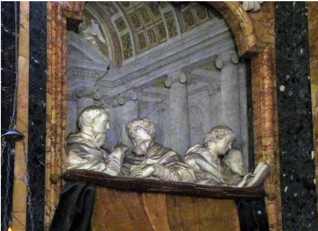
Fig. 16 Left Side of Cornaro Chapel Gian Lorenzo Bernini 1645-1652