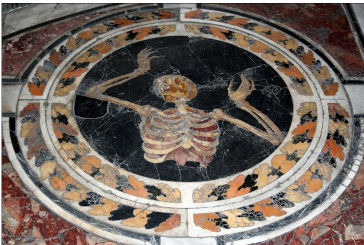
Fig. 10 Left Side of Mortuary Pavement in Cornaro Chapel Gian Lorenzo Bernini 1645-1652