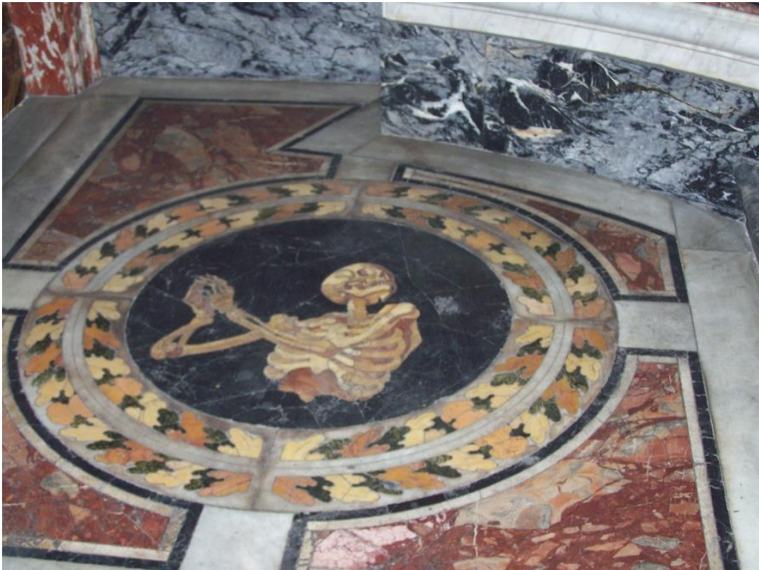
Fig. 9 Right Side of Mortuary Pavement in the Cornaro Chapel Gian Lorenzo Bernini 1645-1652