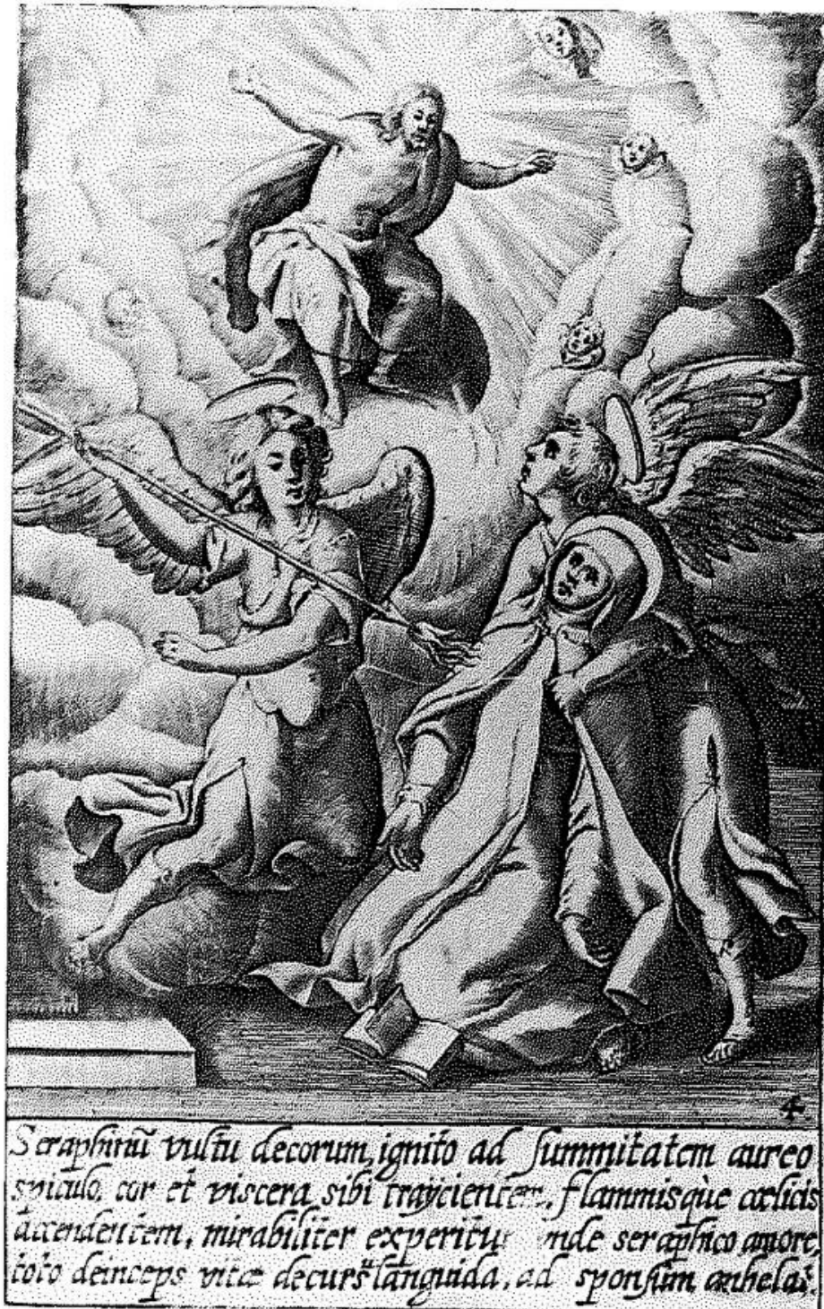
Fig. 7 The Transverberation of St. Teresa