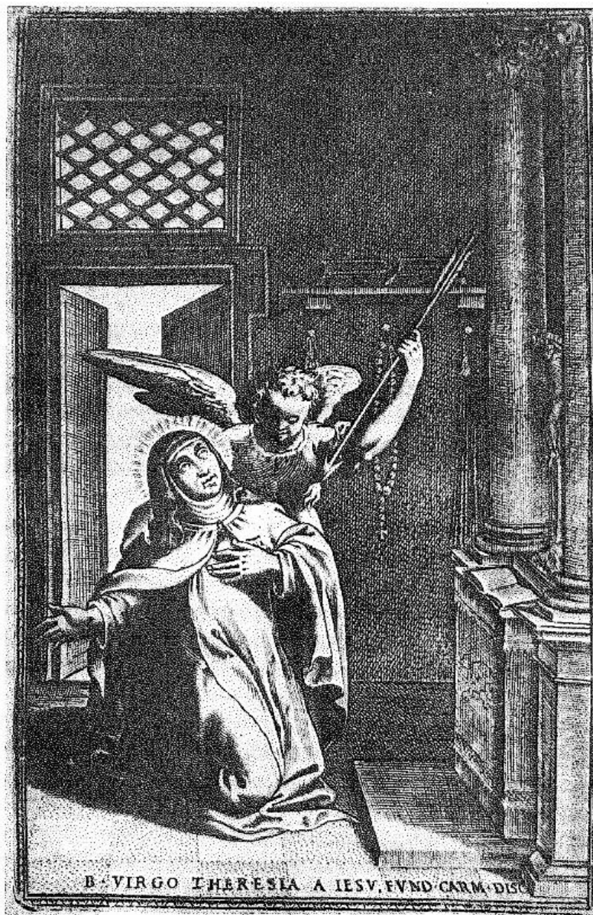
Fig. 5 Transverberation of St. Teresa Juan de Jesús María 1609