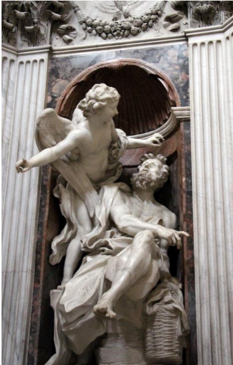
Fig. 14 Habakkuk and the Angel Gian Lorenzo Bernini 1655-61