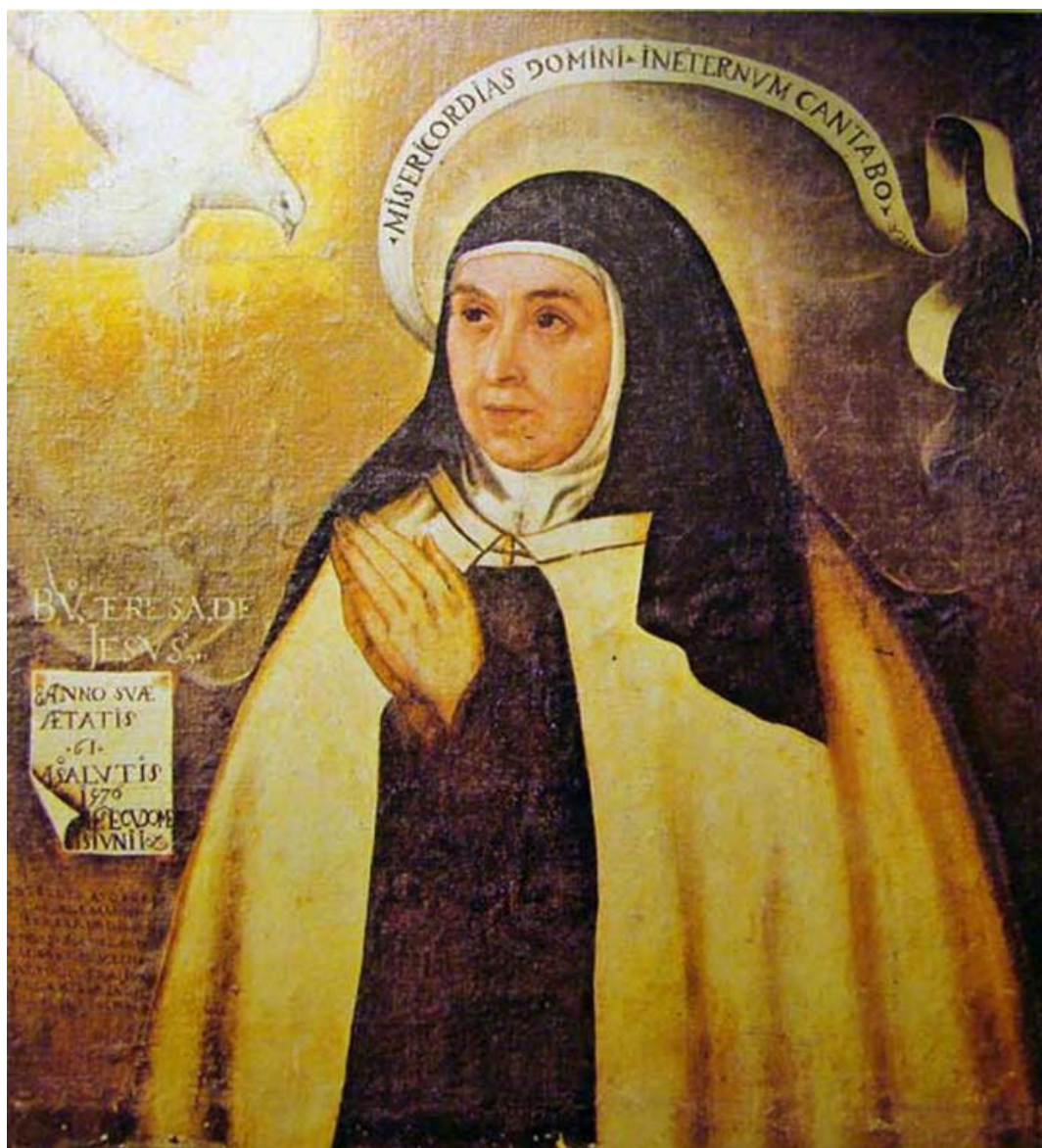
Fig. 3 Teresa de Jesús Juan de la Miseria 1576