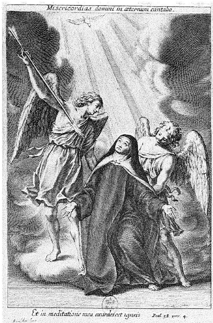
Fig. 6 Transverberation of St. Teresa Gilles Rousselet, after Charles Le Brun 1643