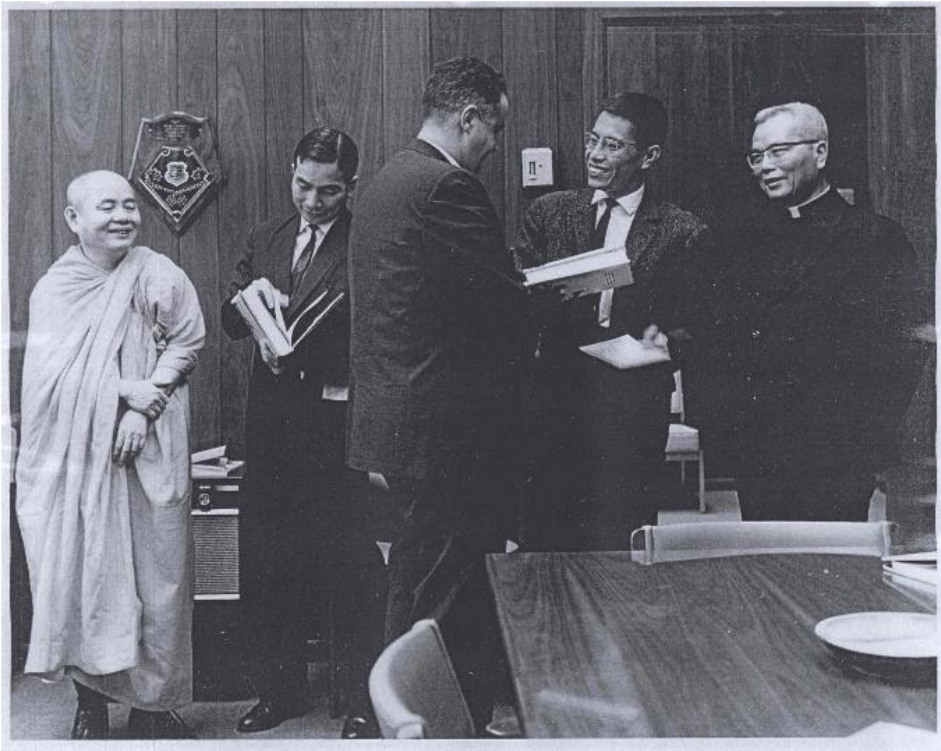
WSU-SP hosted numerous seminars and tours. Pictured here in Stevens Point, Lee Sherman Dreyfus gives Vietnamese rectors (university presidents) The Wisconsin Story