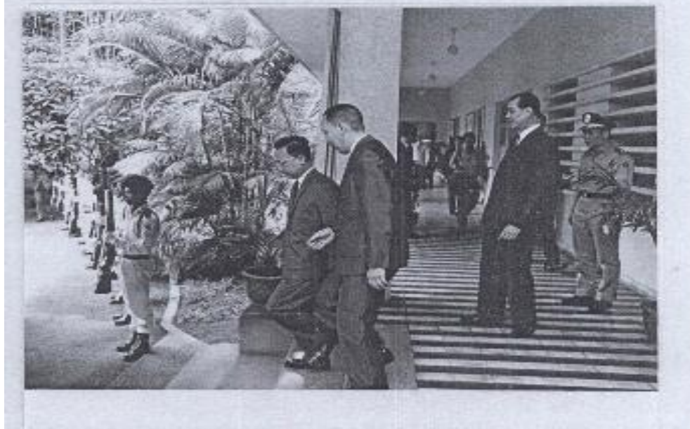
RVN Memorial Service for Wisconsin Team, the mutual commitment found a new common-ground.