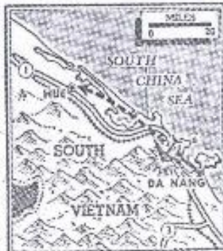
(NEWS Man by Staff AP/ed) Map locates plane crash.

On leave from Ball State, he returned to Germany to serve as education adviser to the U.S.