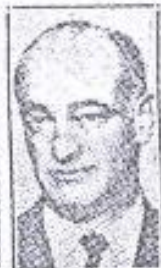
Vincent F. Courroy Victims of plane crash