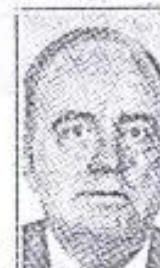
Robert LaFollette Among the dead