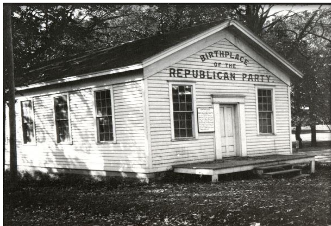
Figure 2. Republican Party Birthplace, Circa 1913.