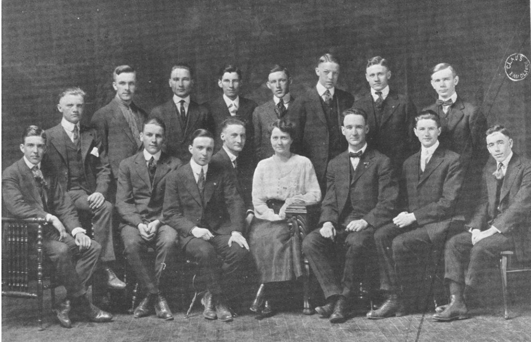
Figure 2. Men's Glee Club, 1917. Source: University of Wisconsin – Eau Claire, "The Periscope, 1917."