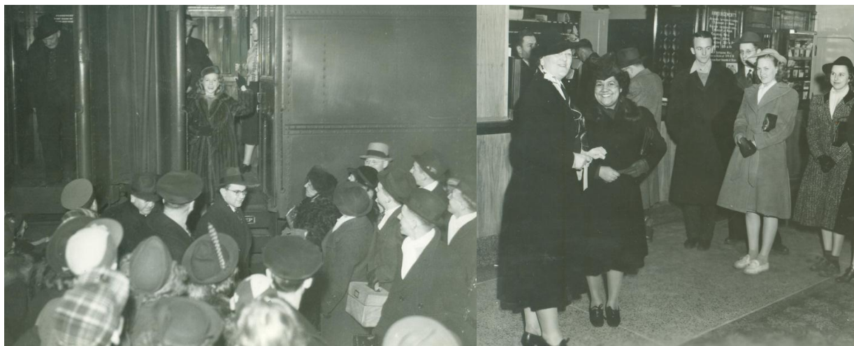
Figure 6. Jessica Dragonette Arriving in Eau Claire, 1939.

ultimately devastated the A Cappella Choir the most and in 1943, after fifteen years of outstanding service to the Eau Claire campus, the group would hold its last concert.