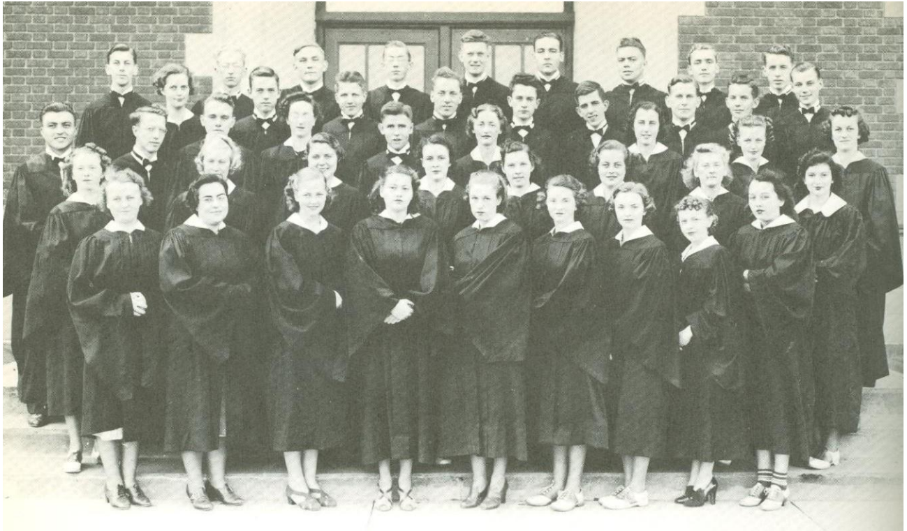
Figure 5. A Cappella Choir, 1939.

hospital.” 116 In 1936 they again attended music conventions in Chicago and Minneapolis 117 but perhaps the greatest honor for the group occurred in 1939 when the A Cappella Choir performed before Mrs. Eleanor Roosevelt in the White House in Washington D.C. 118