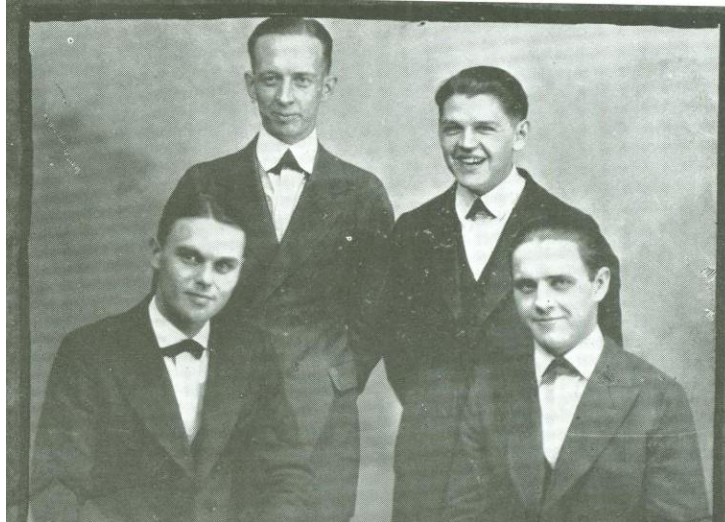
Figure 3. The Male Quartet, 1921. Source: University of Wisconsin – Eau Claire, “The Periscope, 1921,” 54.