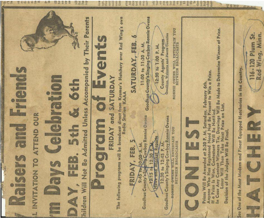
Two-page advertisement for Kramer's Hatchery Days at which Owens performed. [1950]