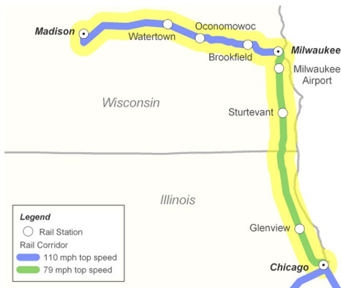
Figure 3 - Proposed route for the High Speed Rail with estimated speeds

With the proposed expansion of the Amtrak Hiawatha Service to Madison and conversion to high speed rail, people could’ve been able to travel from Madison, Milwaukee, and Chicago, at faster times than driving and flying. The planned extension of the service was the basis for extending the route to Minnesota. Passengers would’ve been able to make connections between Milwaukee airport, Chicago, and other services operated by Amtrak. All current stops would be kept with new