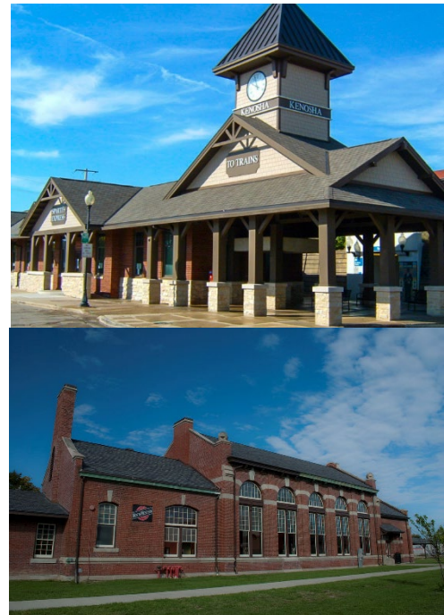
Figure 1 – Existing C&NW Stations in Kenosha (top) & Racine (bottom) to be utilized

The Kenosha-Racine-Milwaukee Commuter Link or KRM, was a proposal for a commuter rail line from Milwaukee, Racine, and Kenosha that would've utilized existing train depots from the former C&NW North Line such as the Milwaukee intermodal station, Cudahy depot, South Milwaukee passenger station, Racine Depot, and Kenosha Station. New stations were intended for the South side of Milwaukee, Oak Creek, Caledonia, and Somers. The planned service would not operate on tracks owned by the state, but rather tracks owned by Union Pacific and Canadian Pacific Railway lines. According to the commission, "14 weekday trains would operate in each direction at top speeds of 59 mph