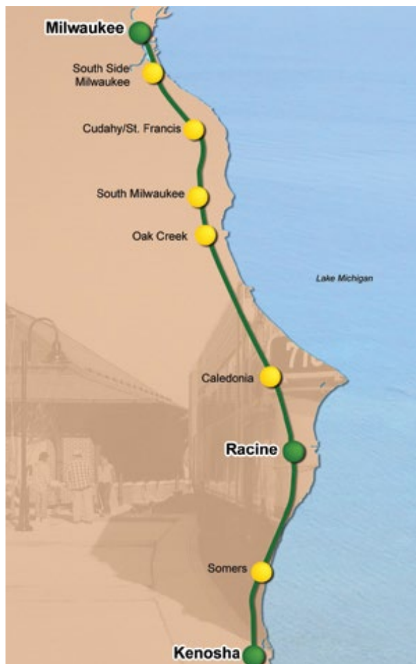
Figure 2 - KRM Commuter Link Stations Map

with an average speed of 38 mph” (SEWRPC). Planners envisioned trains making connections with local transit systems such as MCTS, Belle Urban System, and Kenosha Area Transit at their respective stations. Special dedicated service was planned to shuttle people to the airport from the Cudahy/St. Francis station, and the Downtown Business District from the intermodal station in conjunction with the Hop/Milwaukee Streetcar. Trains would’ve also been scheduled to meet Metra trains at either the Kenosha station (current terminus of the Metra UP-North line) or this formerly proposed service would be extended beyond Kenosha and