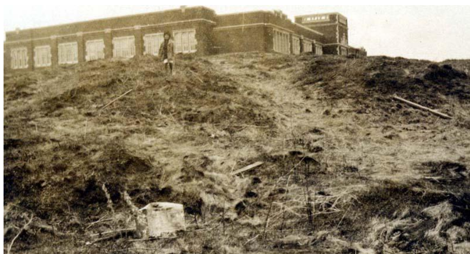
Figure 1: Schofield Hall, circa 1916.

where the department has been, and where it is going.