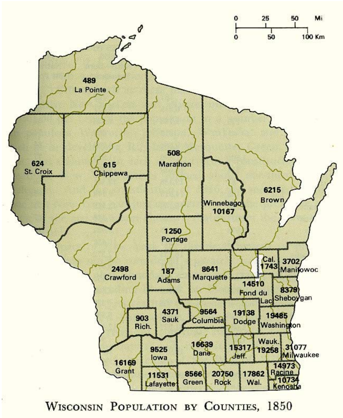
Map # 3: Wisconsin Population by Counties, 1850