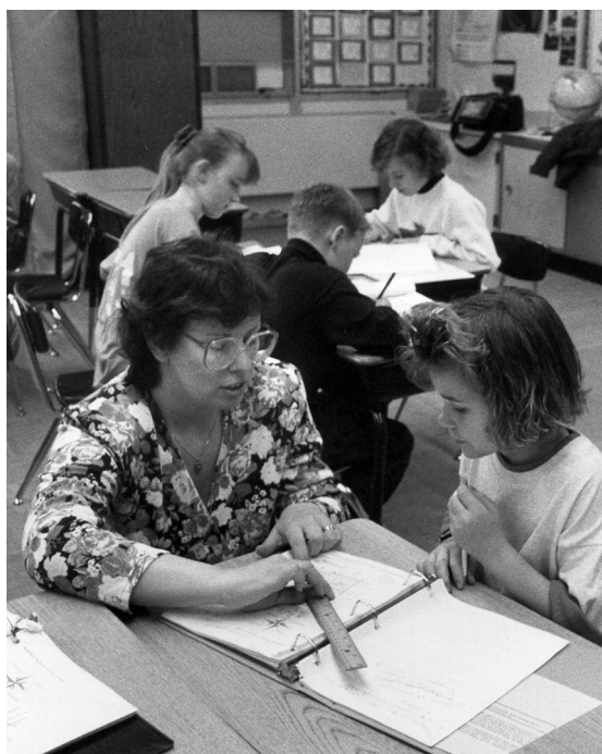
Using formative assessments gives teachers more time to adjust their instructional plans.

Fundamental changes in teachers' instruction can result from showing them the value of conducting formative assessments. Formative assessment occurs when teachers give students immediate, contextualized feedback during the learning process, so that they can learn better. It is diagnostic and can be informal. Summative assessment, on the other hand, usually occurs at the end of a course. Most standardized tests are summative.