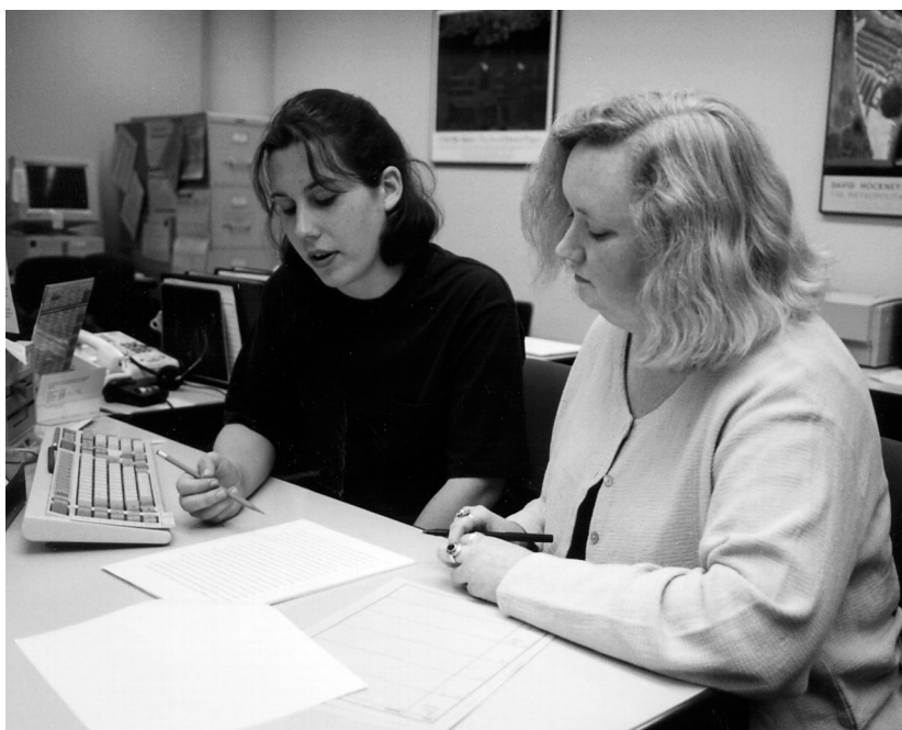
Learning to write effective argumentative essays takes place not only in writing instruction but in the entire classroom context.