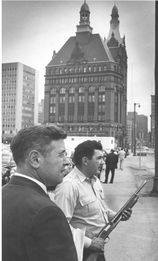
Figure Six: Milwaukee Mayor Henry Maier, guarded by an undercover police officer during the riots

In the months that followed, it was discovered that the riot was not premeditated nor an attempt by the blacks to exert a militaristic force over the city. However there was no question that part of the riot had to do with the frustration that so many blacks had living in the inner city and the discrimination they had experienced all over Milwaukee. The riots had a large impact on the city of Milwaukee, it made fellow residents and members of the city council realize that if steps were not taken to rectify the current racist situation, things would only get worse. After the riot was analyzed by the National Advisory Commission on Civil Disorders a year after the event, it was concluded that much of the riot had been due to the frustration of those in the black community and a