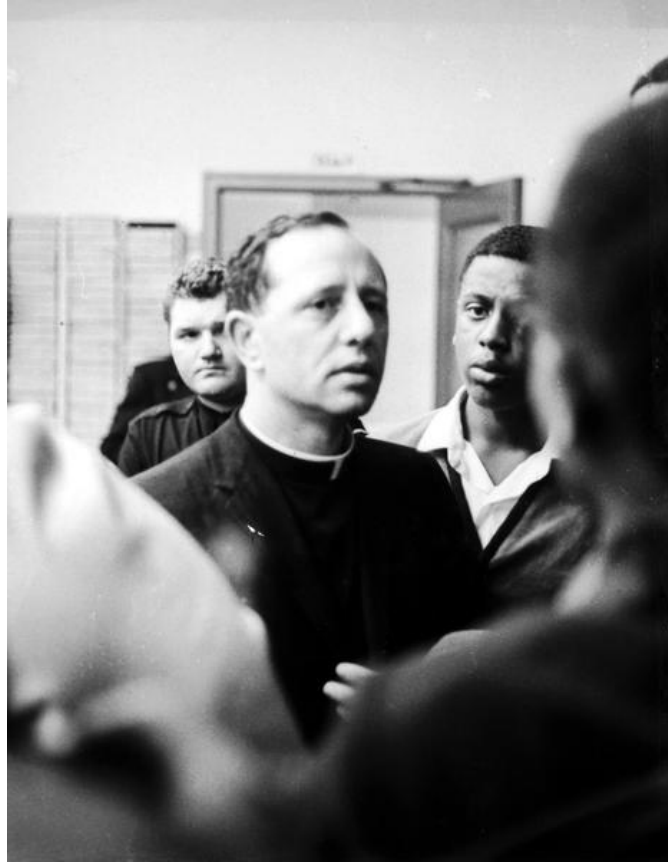
Figure Three: Father James Groppi

Civil Rights Movement in Milwaukee, hoping to help other whites relate to what blacks were doing to try to gain equality with whites.