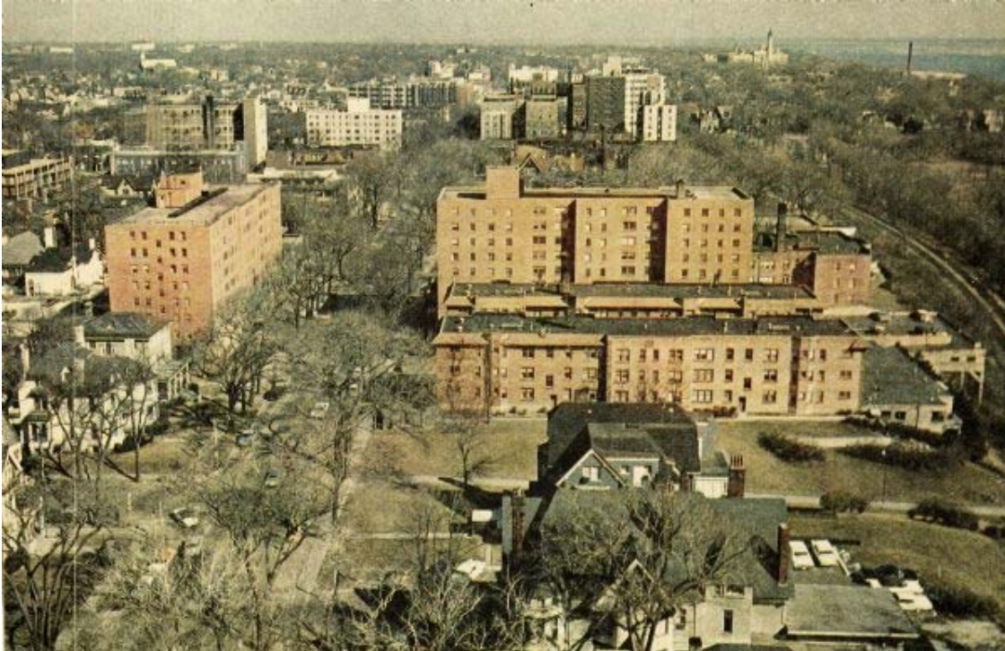
Figure One: View of some of the slums on the North Side of Milwaukee during the sixties

nothing to improve the living situations of these people goes to show just how unwilling city officials were to work with the newly forming black community in Milwaukee.