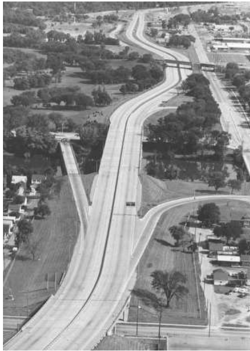
Figure Five: An example of the effect that the curfew had on local commuters

touched off by a shooting near Third Street, close to a popular nightclub. The official report was that it had started when a fire had broken out followed closely by a shoot out, both of which occurred two blocks east of Third Street on West Center Street. 56 This began a chain reaction as police began to rush to the scene of the shooting, as the police arrived they began interfering with other activities going on in the black neighborhood, leading the blacks to get upset at the police. The riot itself was contained within a few blocks and was under control within the next five hours, however, the damage had been done. Though the damage was primarily to local shops and liquor stores, it was reported that three people had already been killed; at least one of them a cop, and over a hundred arrests had been made. This was more than enough for Mayor Maier to call the Governor and ask him to send in the National Guard, leading to a lockdown in the city of Milwaukee that had never been seen before, and has never been seen since.