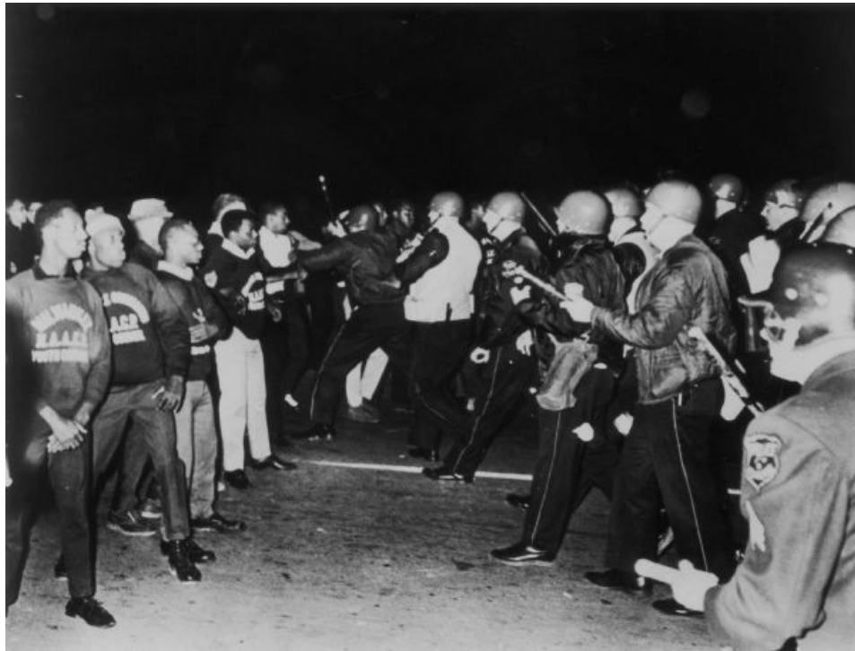
Figure Four: Milwaukee Police engage Youth Council members

plight of the black poor. They do not understand black people. A demonstration line to most policemen is synonymous with a riot.” 51 Groppi urged that the police force try to cut back its racist arrest practices to help ease the rising tide of racial hatred.