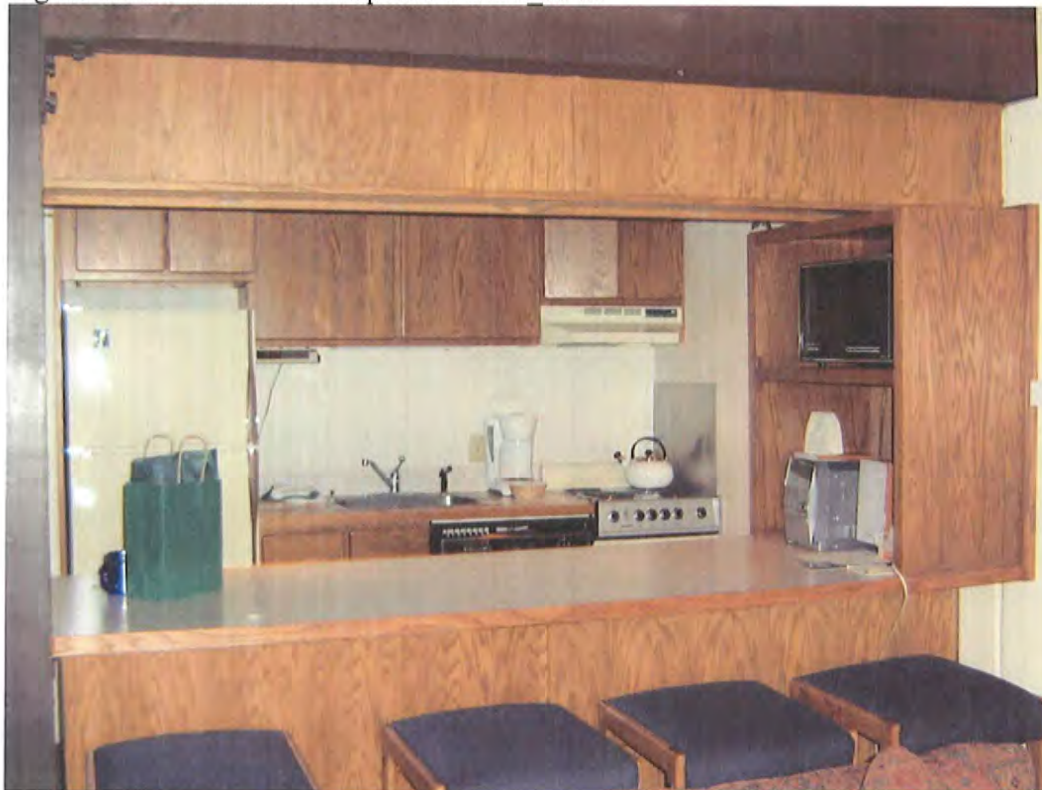
Figure 4. Condominium unit photo 3 IMG_0908

In question 16, 50% of the population rated the unit as fair, 29.6% good and 16.7 % as poor. The mean produce a score of 2.22 out of 5 points on the Likert scale, which was between fair and good. The result was interesting since percentage rating was the same in question 13 where the 50% rated the unit as fair. Also, in question 13 9.7% of the population said the unit was good versus 29.6% which suggests that esthetics and what they say does influence how they perceive quality.