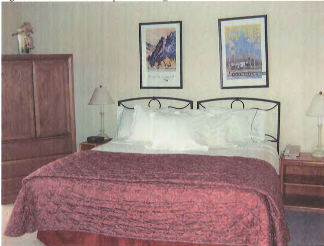
Figure 8. Condominium unit photo 6 IMG_0960

In question 20, 46.3% of the population rated the overall quality of the unit as good versus 27.8% as fair, 20.4% as very good and the rest being 5.6% as fair. The mean produced a score of 2.81 out of 5 points on the Likert scale that was on the high end of fair.