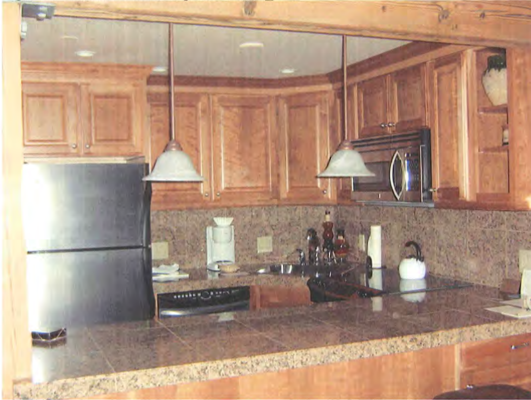
Figure 5. Condominium unit photo 4 IMG_0943

Question 17, produced a very surprising response as 48.1% of the population agreed that the overall quality of the unit was excellent versus 42.6% agreeing that the unit was very good and 9.3% that said good. The mean produced a score of 4.39 out of 5 points on the Likert scale that is between very good and a low excellent and suggests they really identified a unit that speaks quality especially in reference to the esthetics.