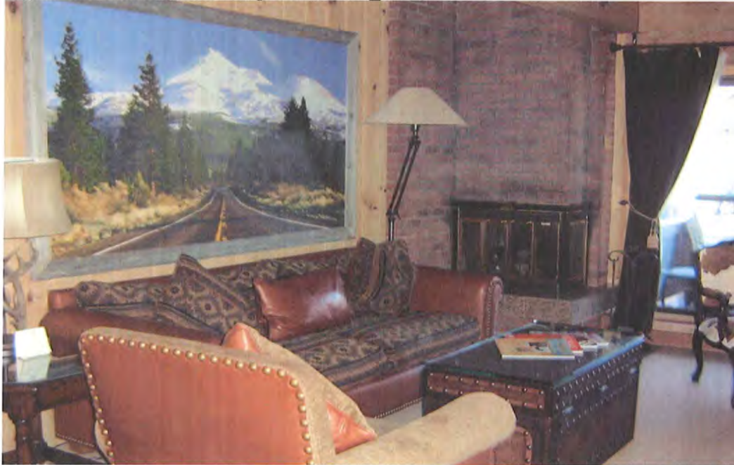
Figure 2. Condominium unit photo 2 IMG_0944

In question 14, 50% of the population rated that overall quality of the unit very good versus 31.5% that said good. The mean was 3.57 out of 5 points on the Likert scale and shows that the population viewed this unit as better quality versus the one in question 13. This demonstrates that the population can see a differentiation between the two units.