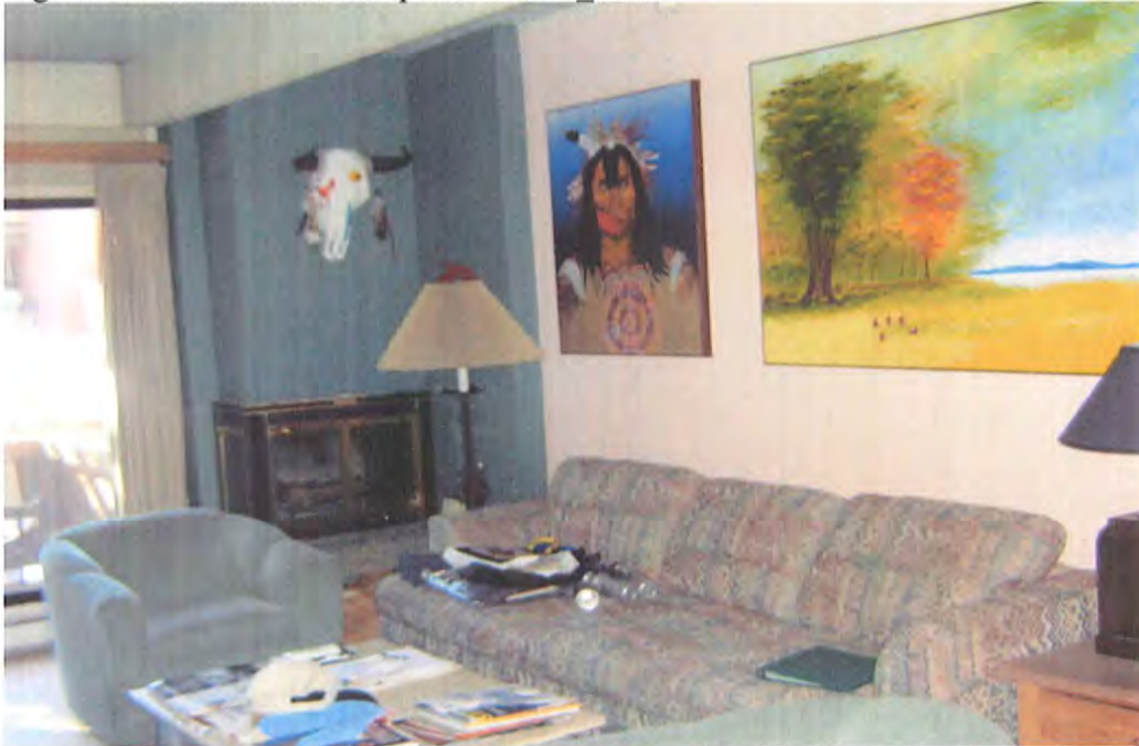
Figure 1. Condominium unit photo 1 IMG_0952

Question 13, a Likert scale based question addressed the issue of how the population rated the overall quality of a condominium unit based on a photo that shown. It was indentified that 50% of the population rated the condominium as fair versus 40.7% that rated it poor with 9.7% that rated it good. The survey produced a mean of 1.69 of 5 points on the Likert scale, which was between a rating of poor and fair.