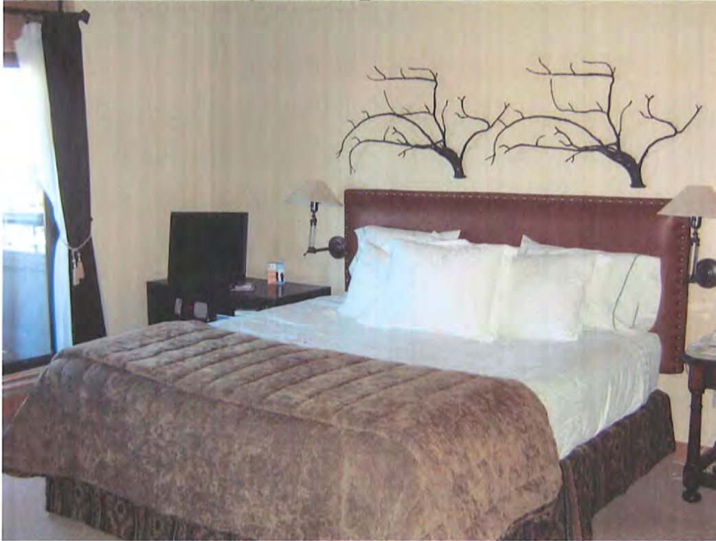
Figure 7. Condominium unit photo 5 IMG_0945

In question 19 the population again was asked use the Likert scale to rate the overall quality of the unit from the photo presented. 61% rated the unit as very good versus 29.6% that agreed it was good with the rest population mostly rating it as fair. The mean produced a score of 3.57 out of 5 points on the Likert scale.