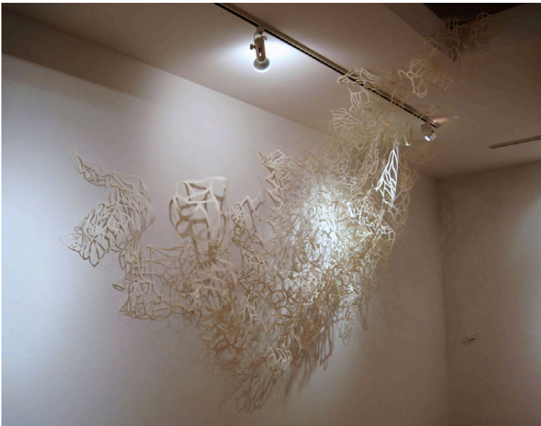
Fragility Sustained , 2012, paper, (dimensions unknown)