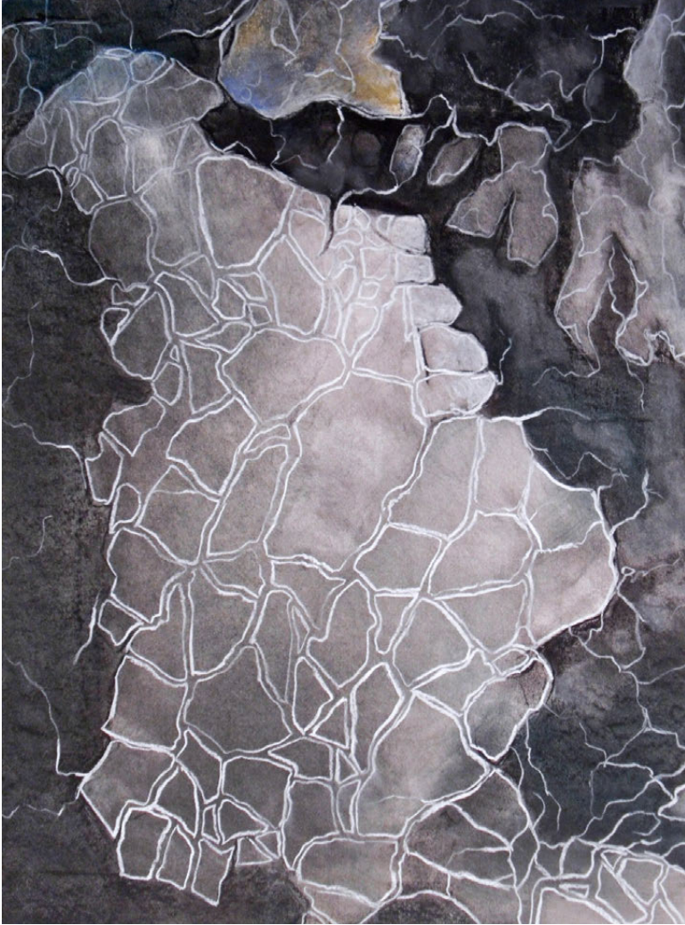
Cohesion , 2011, Watercolor, pastel, 18" x 24"