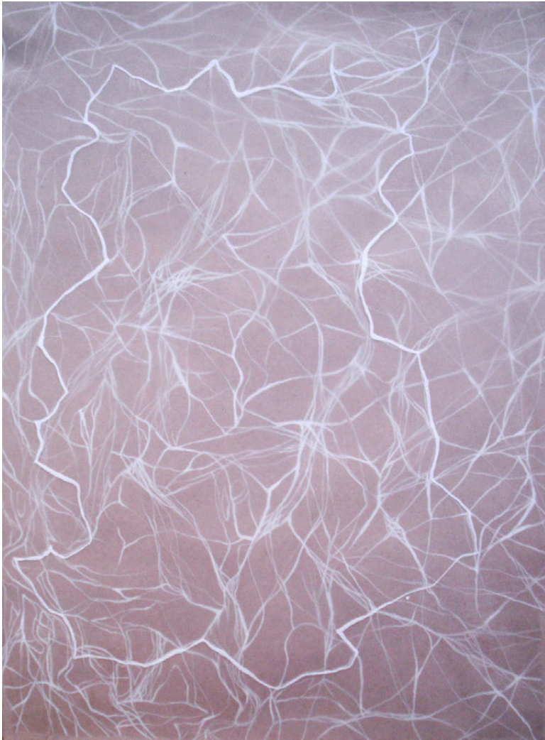
Endless , 2012, mylar, colored pencil, 12" x 18"