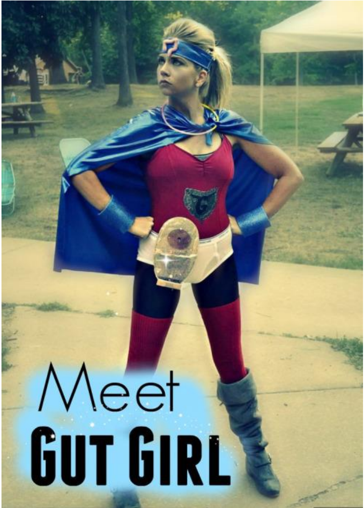
Figure 4. Gut Girl, the IBD superhero is pictured here displaying her superhero armor fully equipped with an ostomy pouch.

Taken together, these cases demonstrate certain intra-actions, particularly involving positive experiences with the ostomy, in which the ostomy and self become cyborg self.