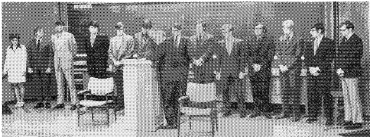
Coif Initiation, 1971