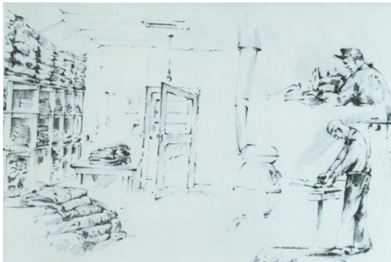
Figure 2: PW Illustration of Prisoners Working Laundry Duty (1945 or 1946)