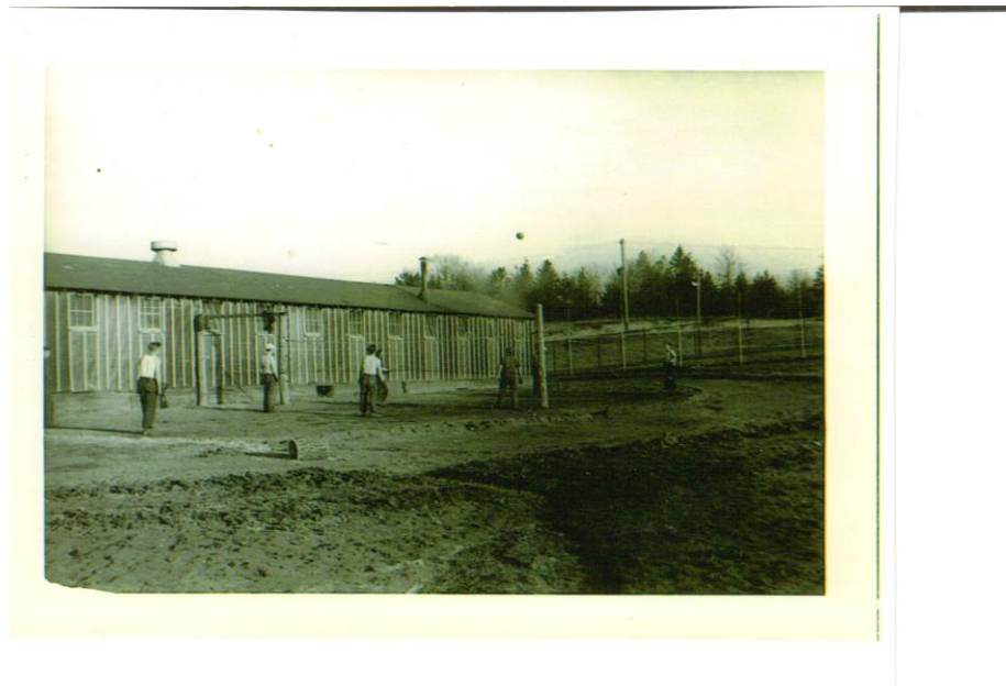
Figure 10: German PWs Playing Volleyball (April 1944)