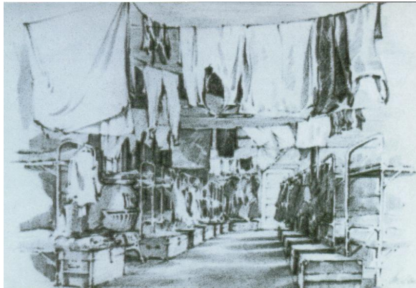
Figure 4: PW Illustration of Barracks at Camp McCoy (1945 or 1946)

feet by 190 feet and the recreation area measured 560 feet by 650 feet by 400 feet by 620 feet. 80 Barracks bunks were double decked and each prisoner had their own steel framed bed. 81 In 1945 the German barracks consisted of a two story former military police housing building, equipped with central heating, well lit, and well ventilated. 82 While space for personal items and clothing was substandard, barrack arrangements followed according to Army Regulations for American troops. 83