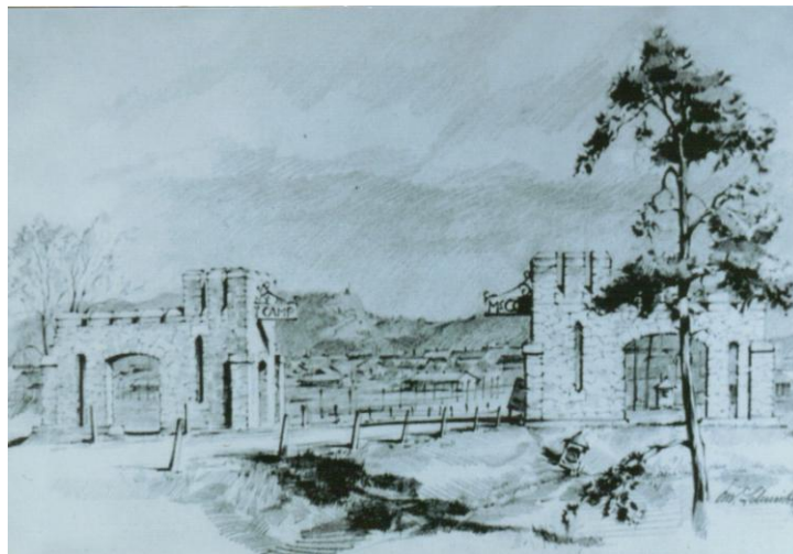
Figure 5: PW Illustrations of Camp McCoy (1945 or 1946)