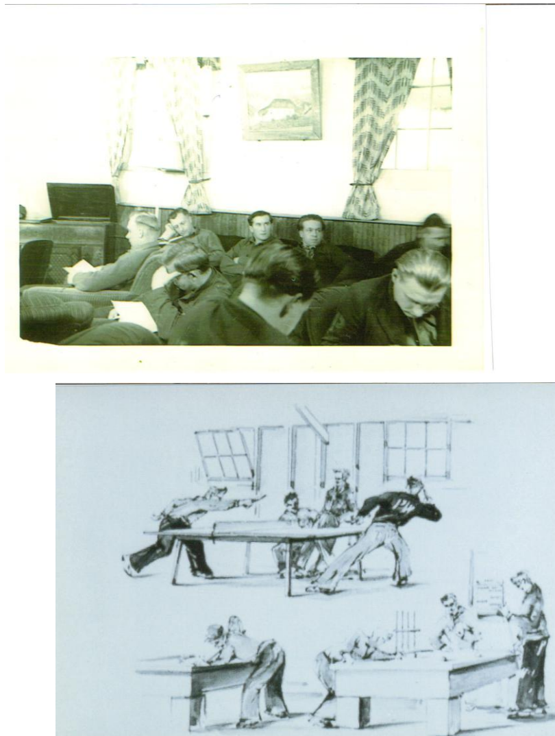
Figure 9: German Day Room, Camp McCoy (April 1944) and PW Illustration of Recreational Activities