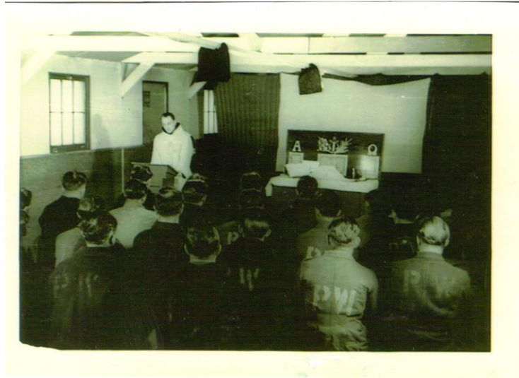
Figure 6: Church Service for PWs at Camp McCoy (April 1944)