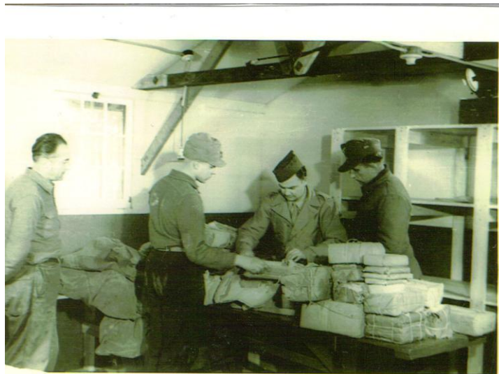
Figure 15: Camp McCoy Mail Room (April 1944)