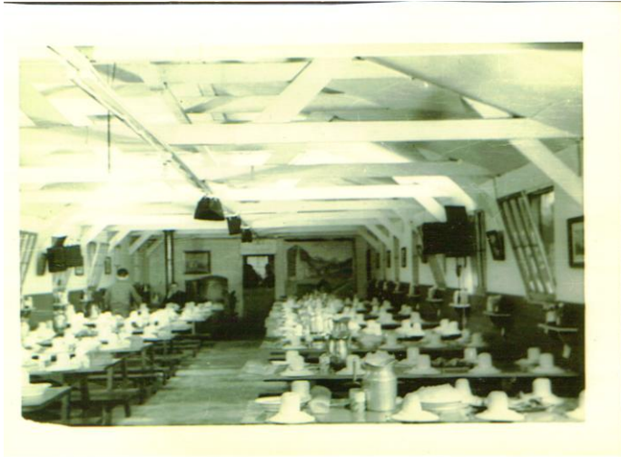
Figure 8: German Mess Halls Before and During a Meal (April 1944)