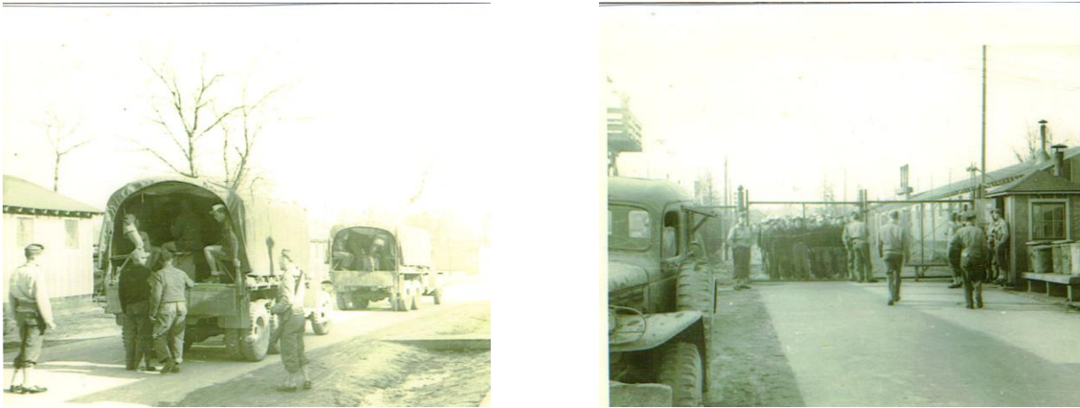
Figure 1: German Prisoners Going to Work