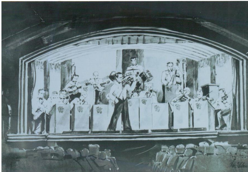
Figure 12: PW Illustration of Prisoner Orchestra (1945 or 1946)

Prisoners also formed their own acting troupes, which preformed autumn through spring, and music groups that gave concerts throughout the year. 128 The recreation room had a piano and a few violins and thanks to donations from the YMCA prisoners even formed an orchestra and a harmonica band. Some of the prisoners had organized into a male chorus as well. 129 On Christmas Eve, 1944, the German Company Christmas party featured musical numbers by many of the prisoners. 130