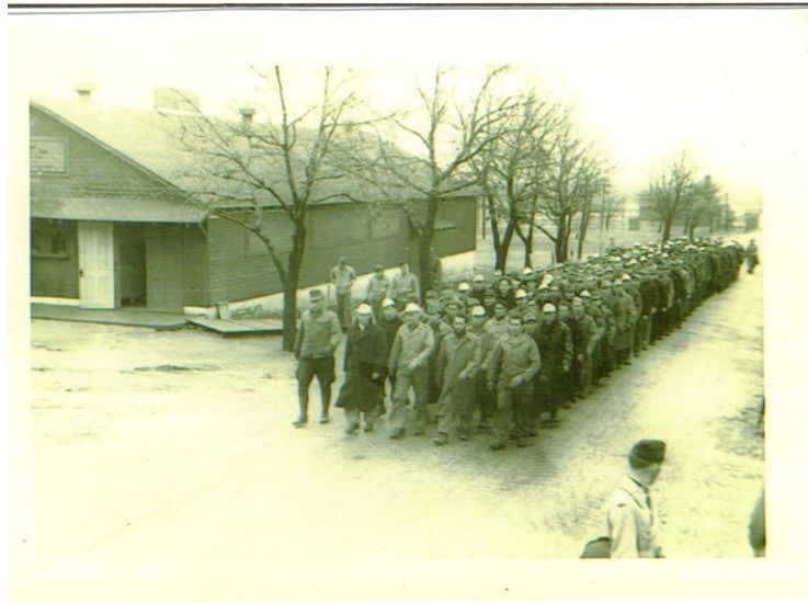
Figure 11: German PWs going to Movies, (April 1944)