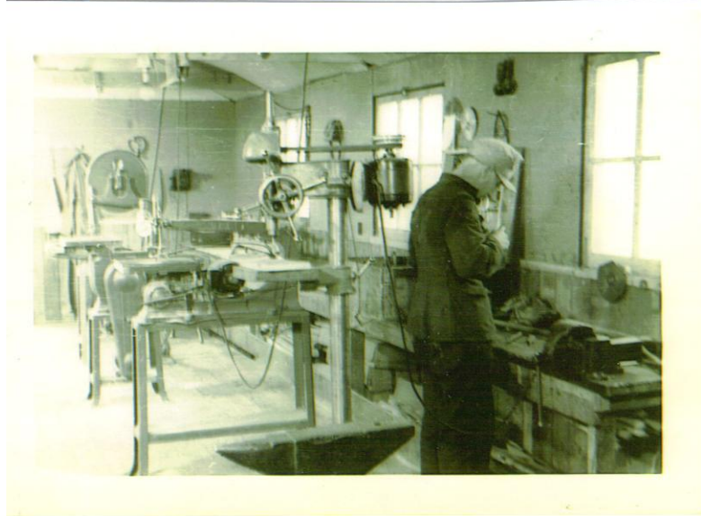
Figure: 14: German PW in Workshop (April 1944)