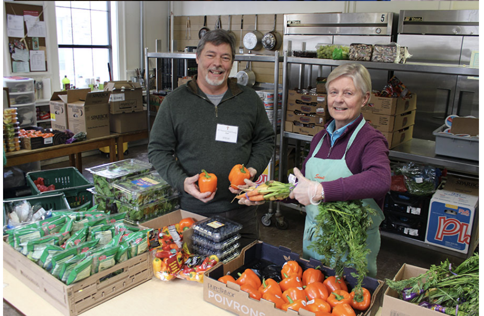
Top Photo: A volunteer holding a Stockbox donation