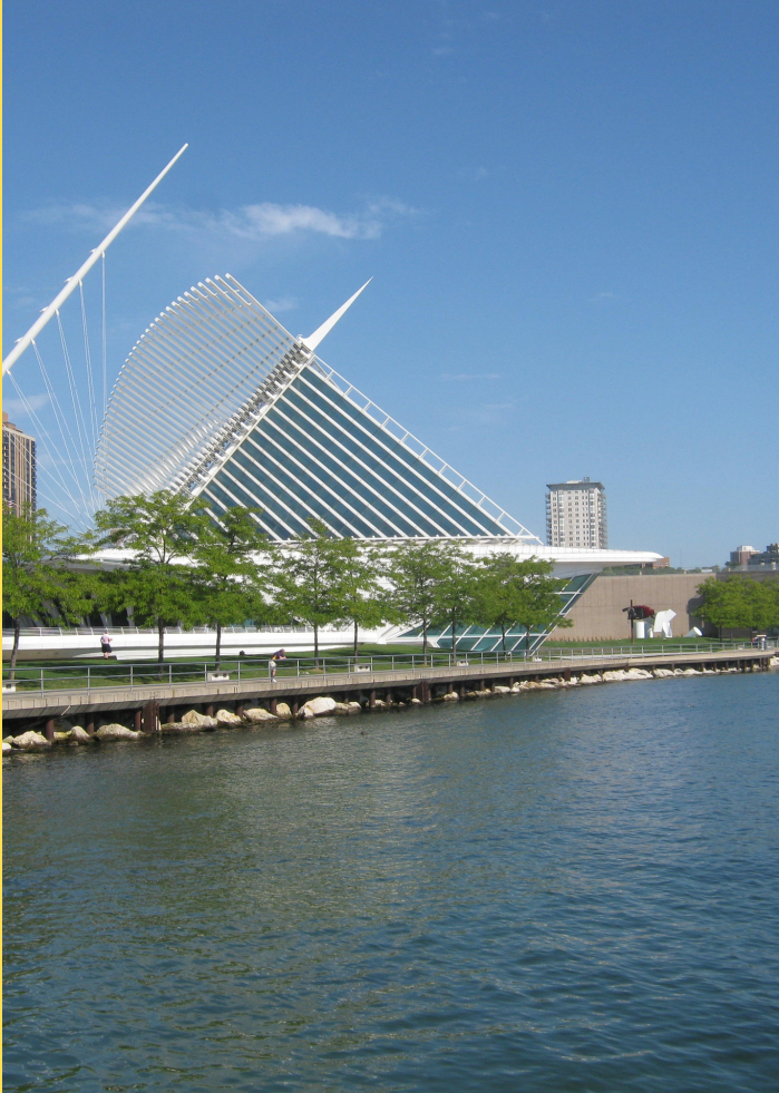
Milwaukee's Art Museum in Downtown Milwaukee