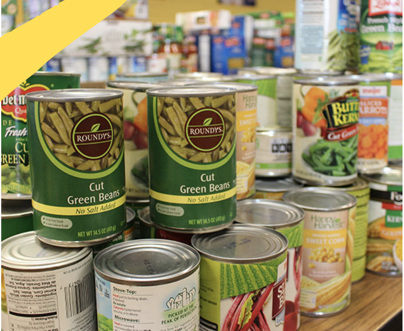
Food Donations from a Hunger Task Force Food Drive