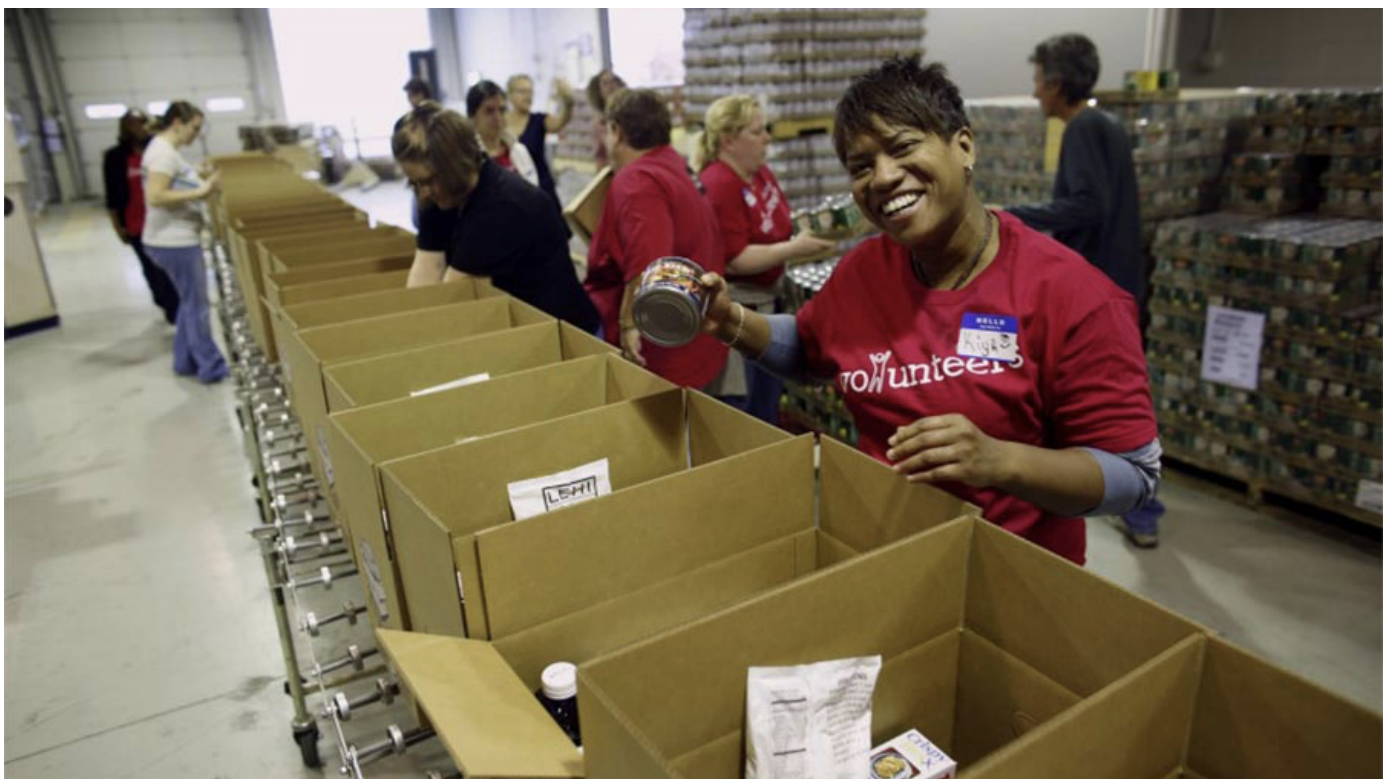
Volunteers stocking some Stockboxes for delivery

Donating your time is just as important as donating money or food. Food banks are in desperate need for volunteers. For more information go to hungertaskforce.org .