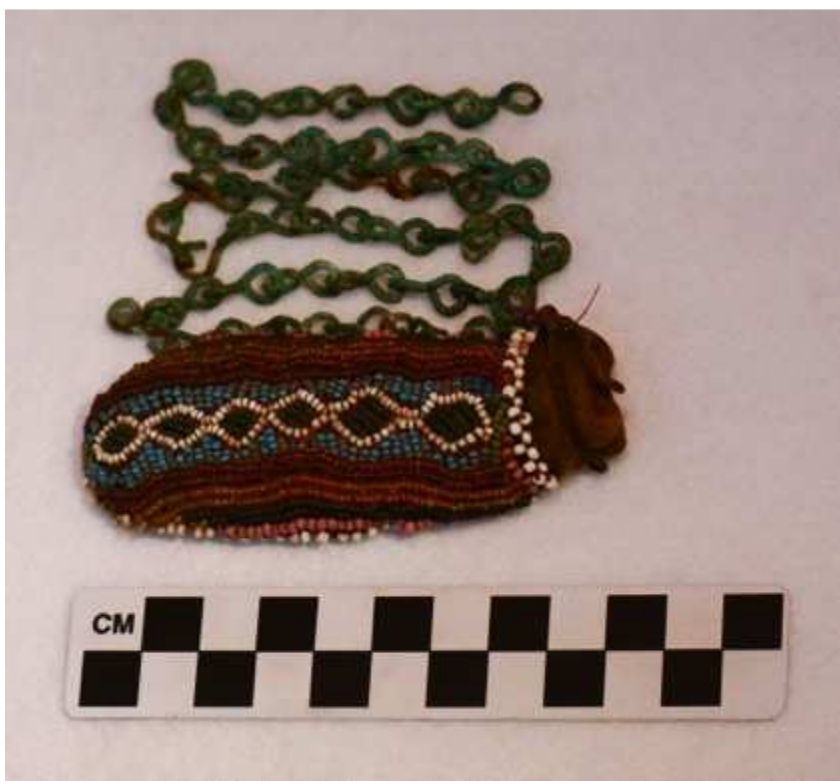
Beaded charm bag (Bag # 6) from Rantoul Woman. This bag is made from hide and seed beads and contains a reed with red ochre.