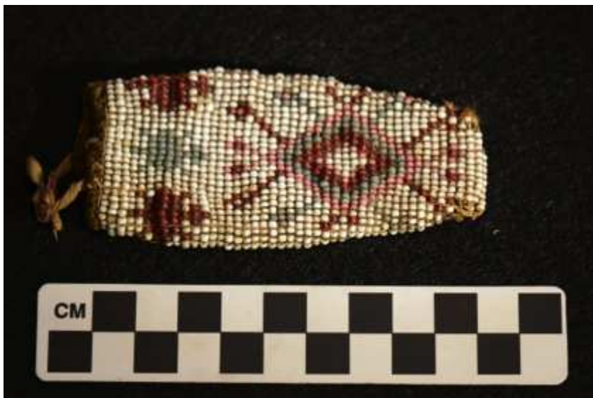
Beaded charm bag (Bag # 2) from Rantoul Woman; made with seed beads, and twine/hemp