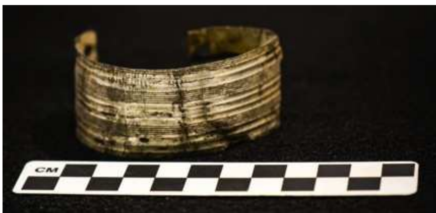
Bracelet #1- German Silver bracelet associated with the Vilas Co. Infant burial