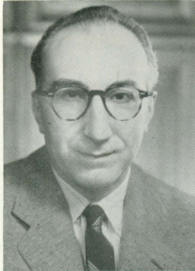
Dr. Michael DeBakey