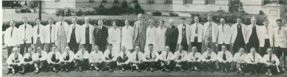
Class of 1929