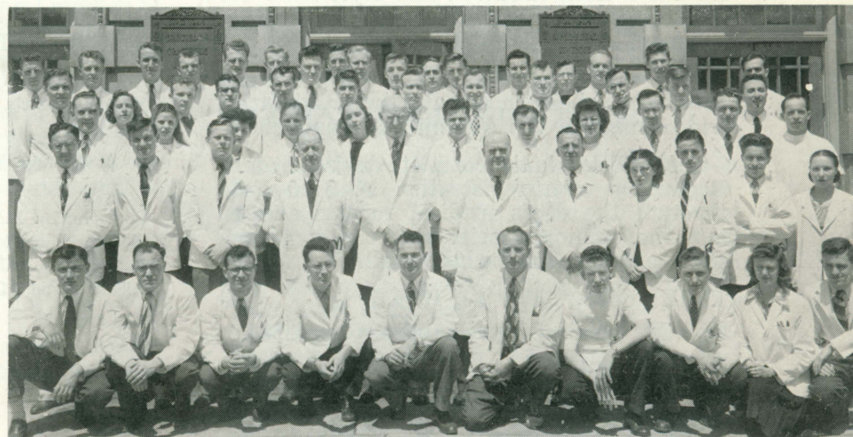
Class of 1949