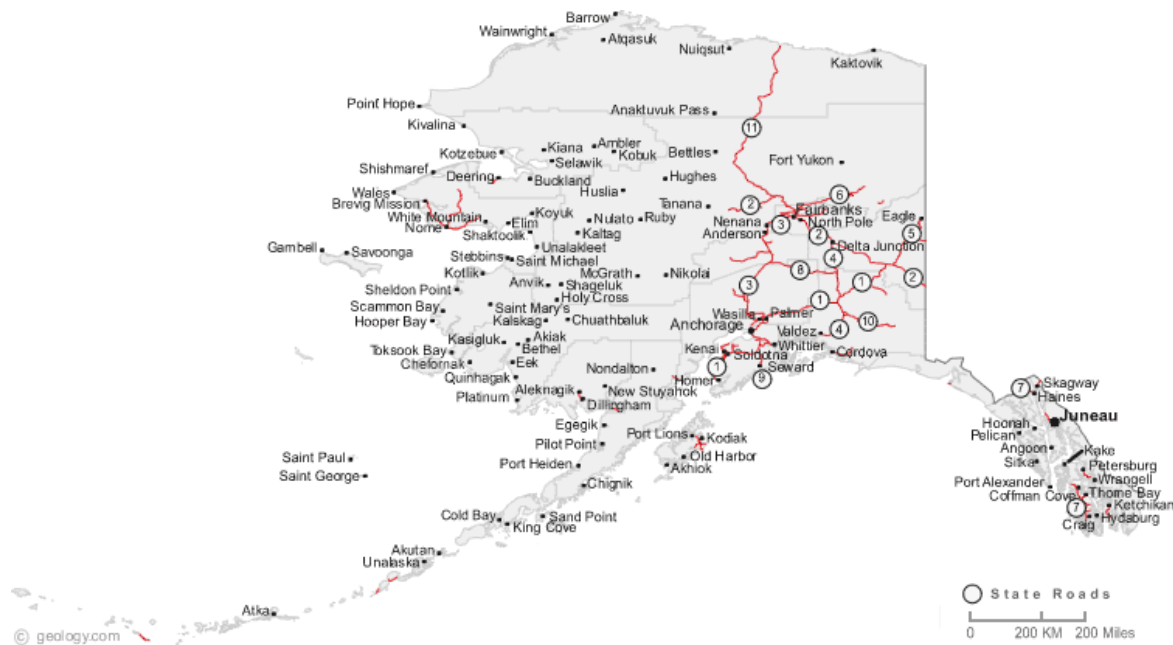
Figure #1: Alaska State Village and City Map 19

Continental United States. However, as the Alaskan Boarding school system changed, it became much different in both how the schools were administered and how the schools treated the students.