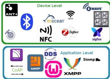
Figure 2. Protocols at Device and Application Layers

the device itself. It is what you find directly in the hardware. Application layer is about communication between devices in software.