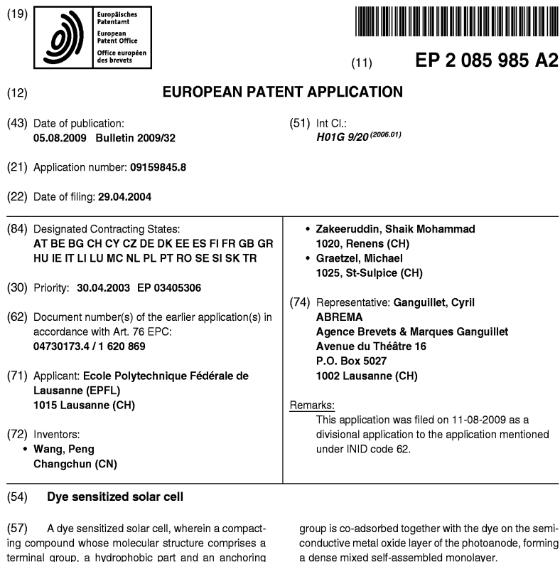
Figure A1: Example collaborative patent abstract