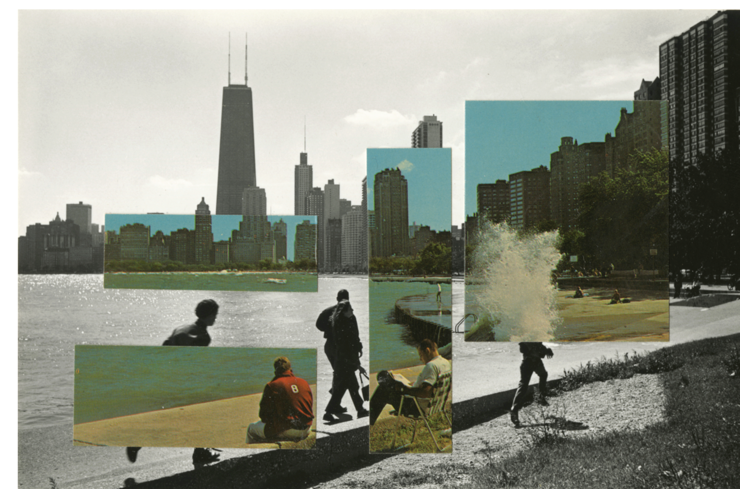
Kenneth Josephson, Chicago , (1973), 7 x 8 5/8", gelatin silver photograph and postcard collage