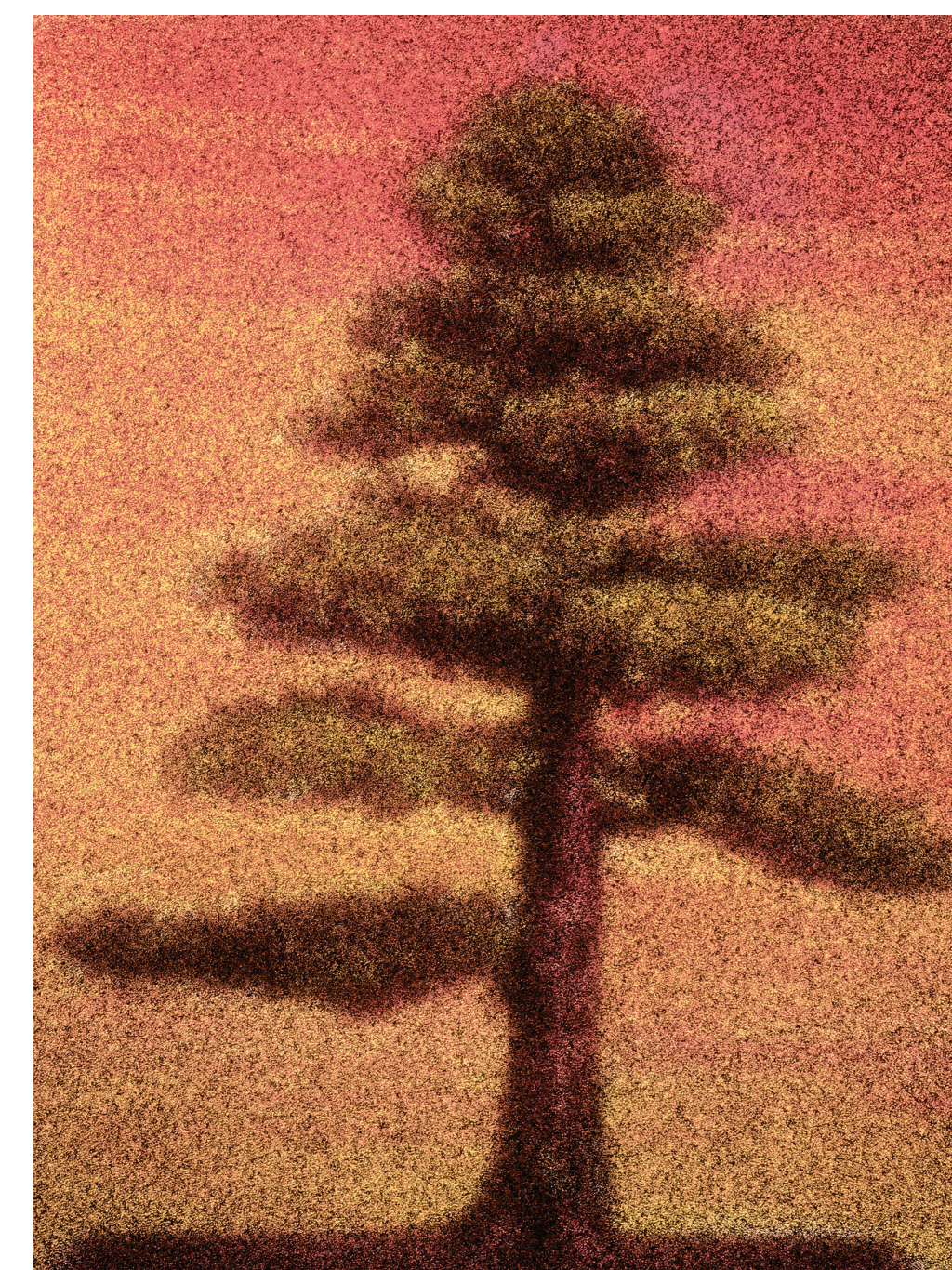
Ellen Brooks, Sunset Tree , (1987), 60 x 50", Cibachrome print