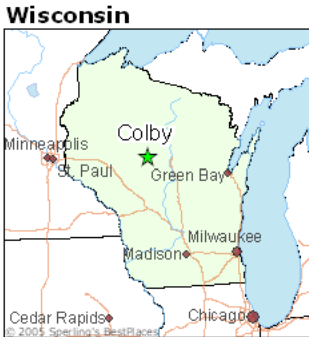
Figure 7. The City of Colby Located on a Map of Wisconsin.