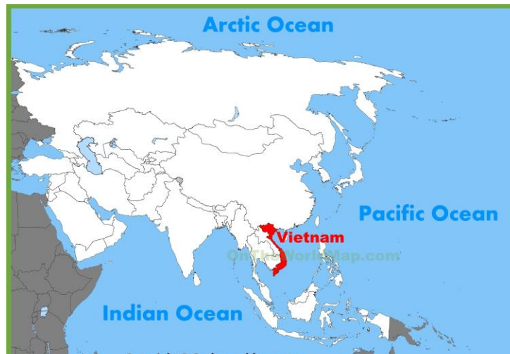
Figure 1. Vietnam Located on a Map of Asia.

was experiencing rebellion and drug culture. At the same time, the Vietnam movement. 2 This decade is one of the