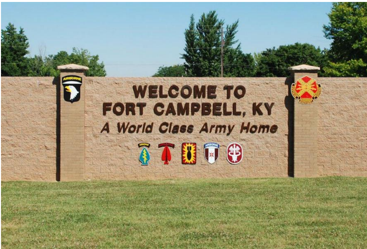
Figure 4. Fort Campbell, Kentucky US Army Base.