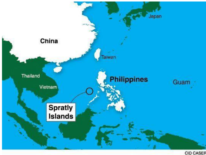
Figure 5. The Island of Guam in Relation to Vietnam on a Map of the South Pacific.

His company was scheduled to head out on the first or second of February, and his sergeant told him that he would be accompanying them. The anti-war sentiment that was